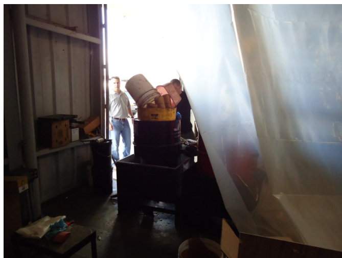
Figure 2: Unlabeled used oil filters