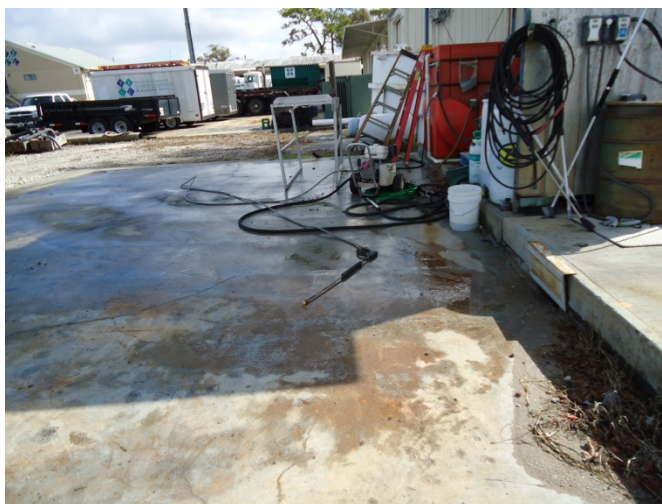
Figure 4: Equipment wash pad