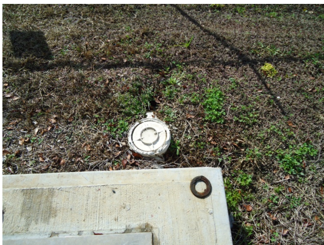
Figure 5: Drain for equipment wash pad