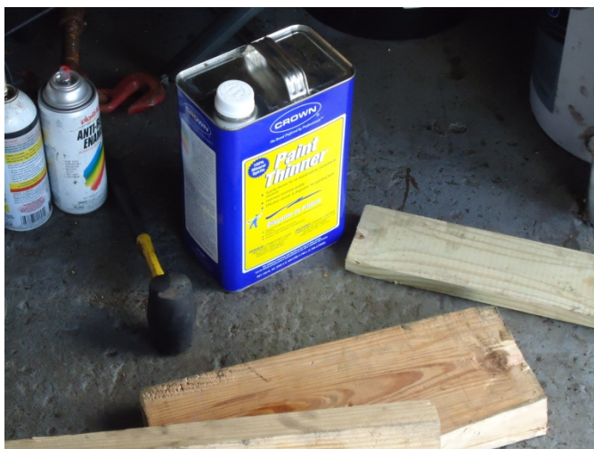
Figure 3: Paint thinner used to clean paint gun