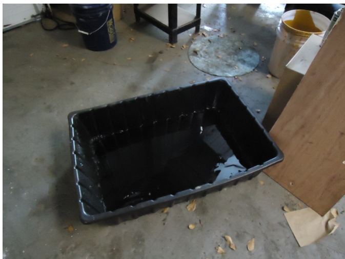
Figure 1: Unlabeled used oil container