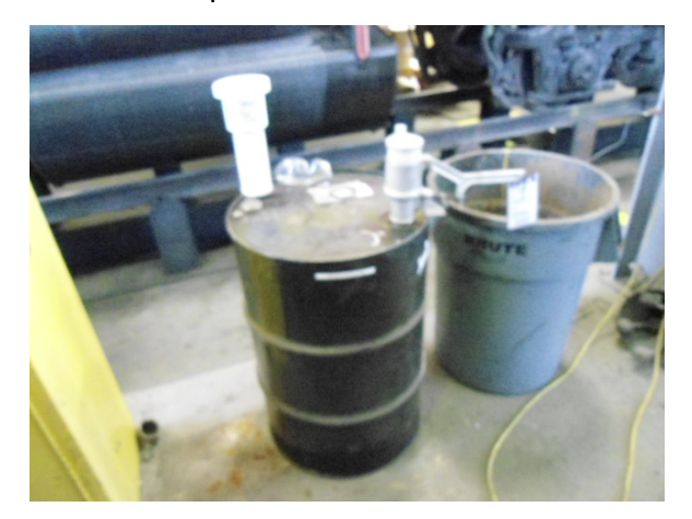
Aerosol can puncturer