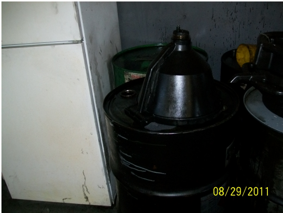
Used Oil drums