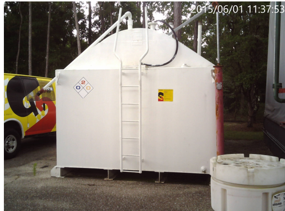
Used antifreeze tank