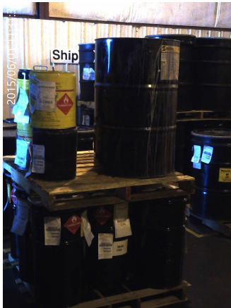
HW Storage Area