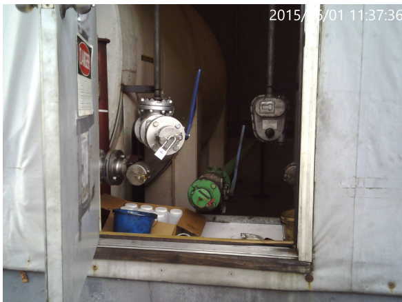
Tank loading and unloading piping