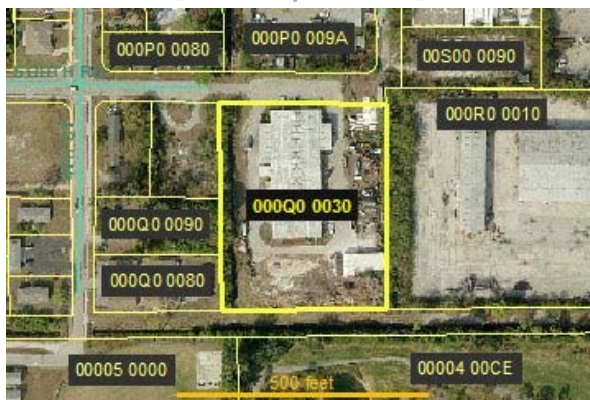
Image of Structure