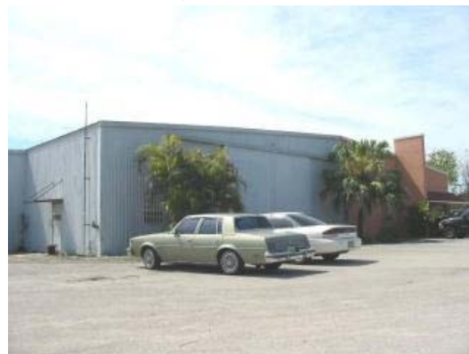
Image of Structure