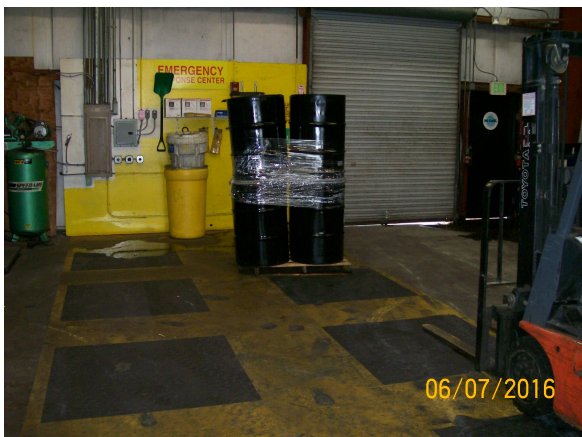
Photo 4. Tank farm w/ permitted hazardous waste tank