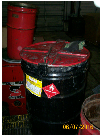
Photo 3. 10-day transfer area