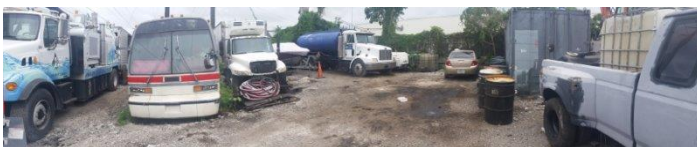
Panoramic view of the used oil release to the ground (before)