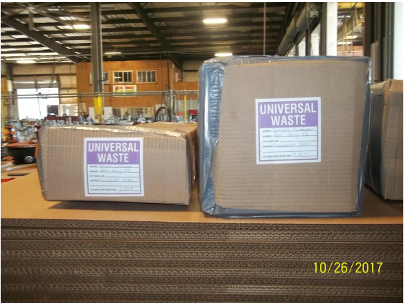
Photo 2 - Used Oil Updated SOP