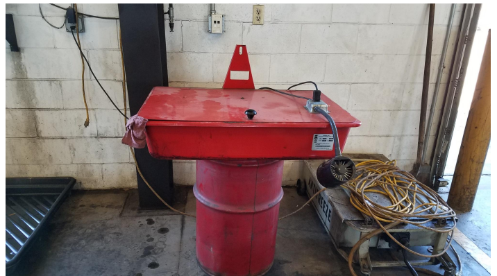
Safety-Kleen parts washer