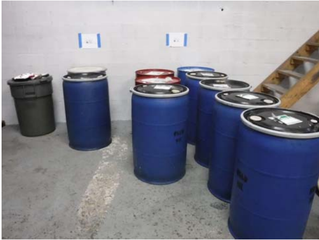
UO drums without secondary containment