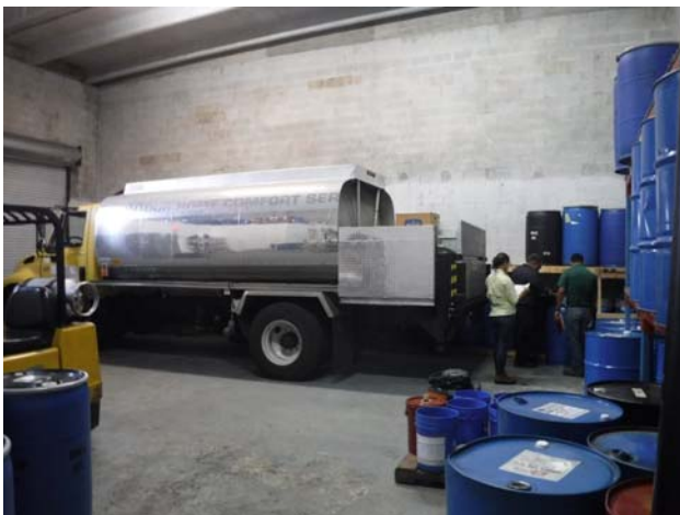
Vacuum truck at oil department