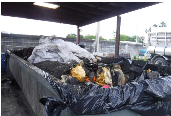
Roll-off with Oily Solid Waste