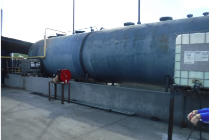
Dexsil Halogen Test