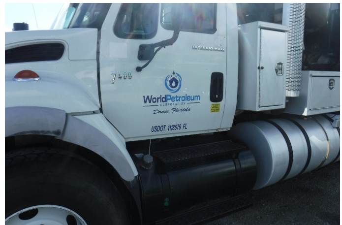
Roll-off with Scrap Metal from Crushed Used Oil Filters