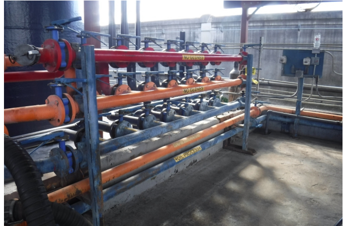
Daily Tank Inspection Checklists