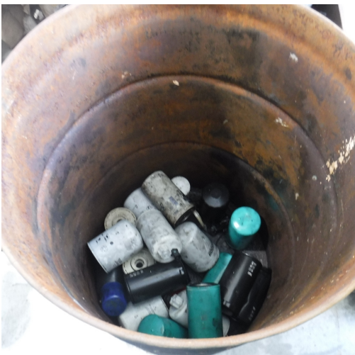
Before - Unlabeled 55-gallon Drum for Used Oil Filters