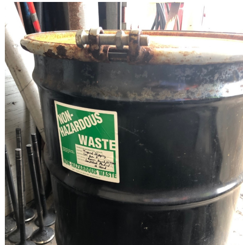
2. Labeled 55-gallon Drum for Spent Sandblast Media