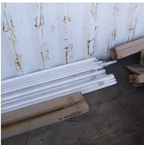
Before - Spent Mercury Lamps without Container