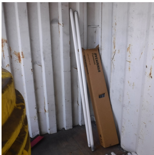
Before- Unlabeled Box of Spent Lamps