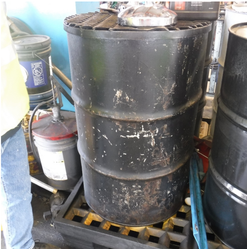
Before - Unlabeled 55-gallon Drum of Used Oil