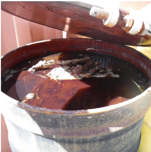
1. Unlabeled 55-gallon Drum Unknown Content