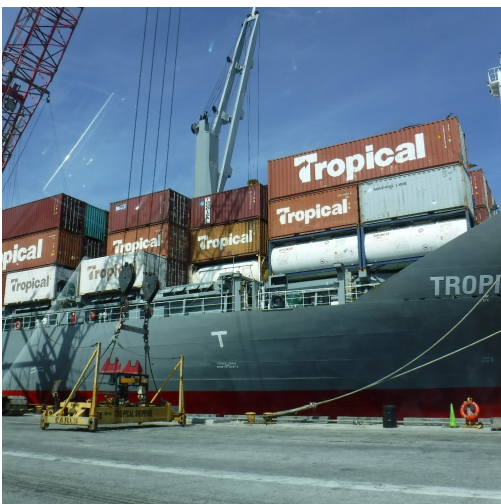
Cargo Containers Storage Area