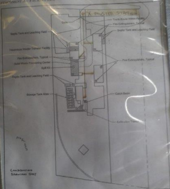
ATTACHMENT A - FACILITY MAP

BRANIFF USE: Braniff Environmental Services, Inc. PERMIT NUMBER: 316140-004-100 & 316140-005-50 EPA ID NUMBER: FL 9,000 (76 27) EXPIRATION DATE: August 12, 2023