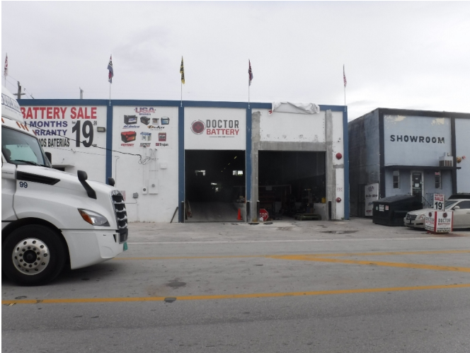
Front of facility