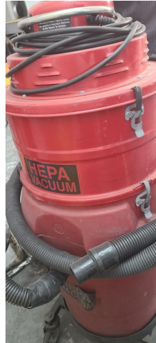
Lead contaminated Heppa filter container