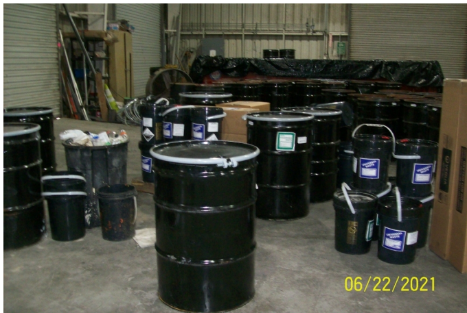
Wastes stored in Warehouse #2