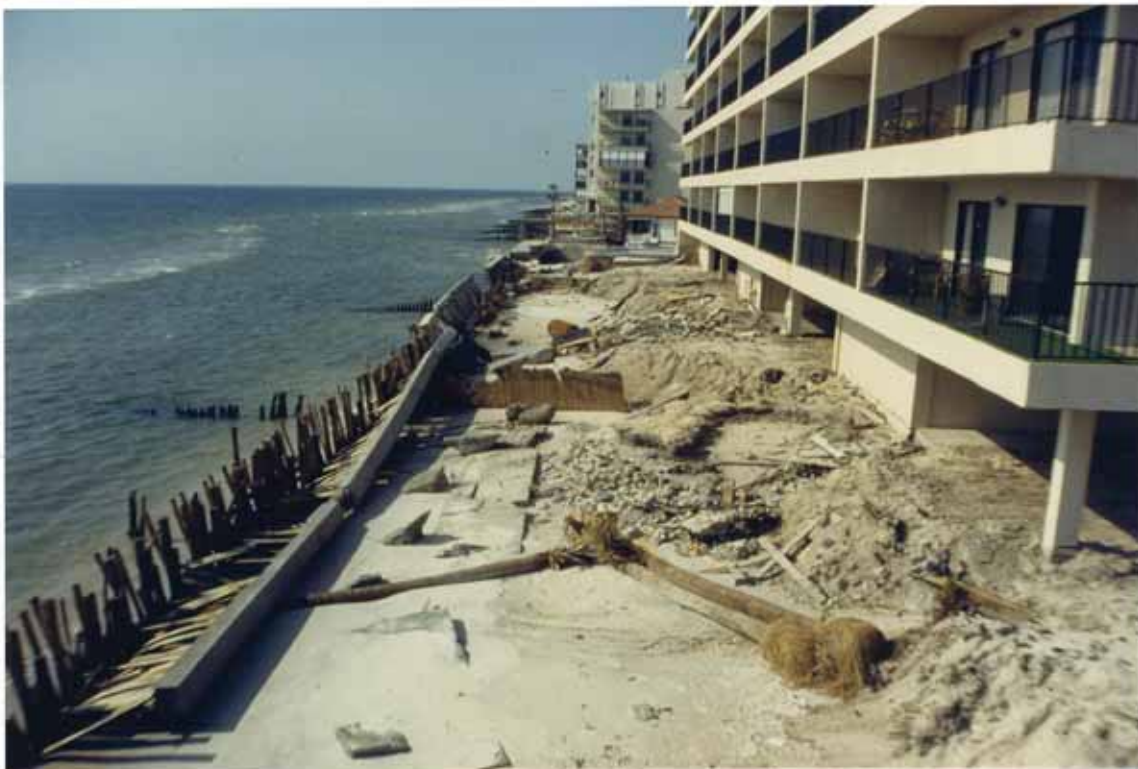
FIGURE 108. Indian Shores bulkheads destroyed, 820 feet