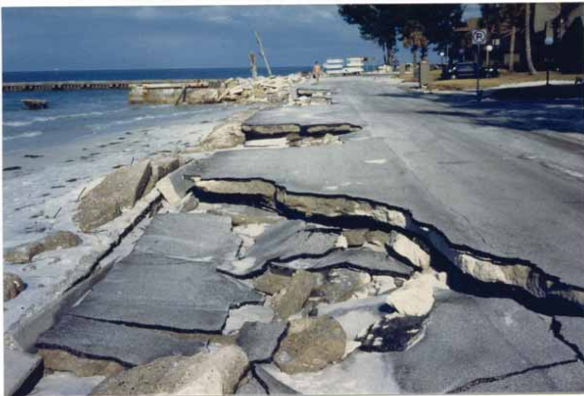
FIGURE 151. Beach Road damaged on Siesta Key (S. West)