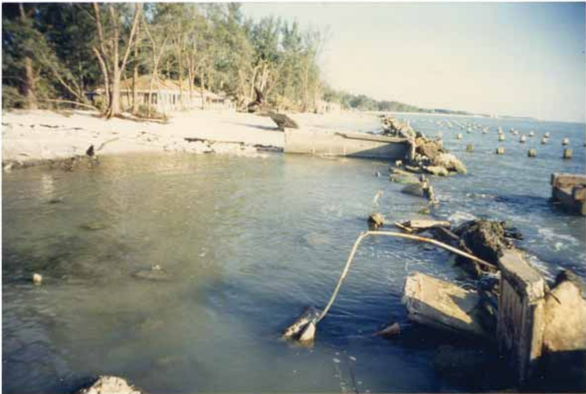
FIGURE 142. Juan destroyed 700 feet of bulkheads