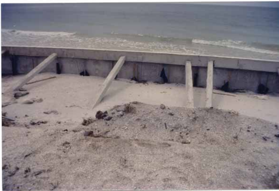
FIGURE 59. Inadequate fill containment with strips of filter fabric