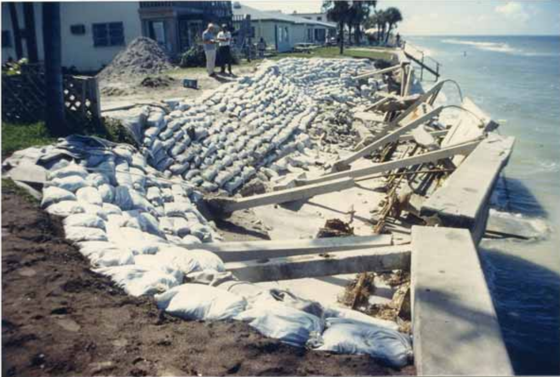
FIGURE 75. Post-Elena emergency protection, 23rd Avenue