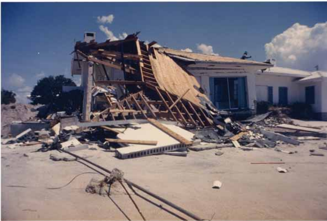
FIGURE 63. Belleair Shore dwelling damaged