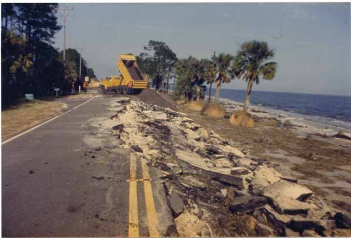
FIGURE 16. U.S. Highway 98 damaged by Elena, Carrabelle Beach