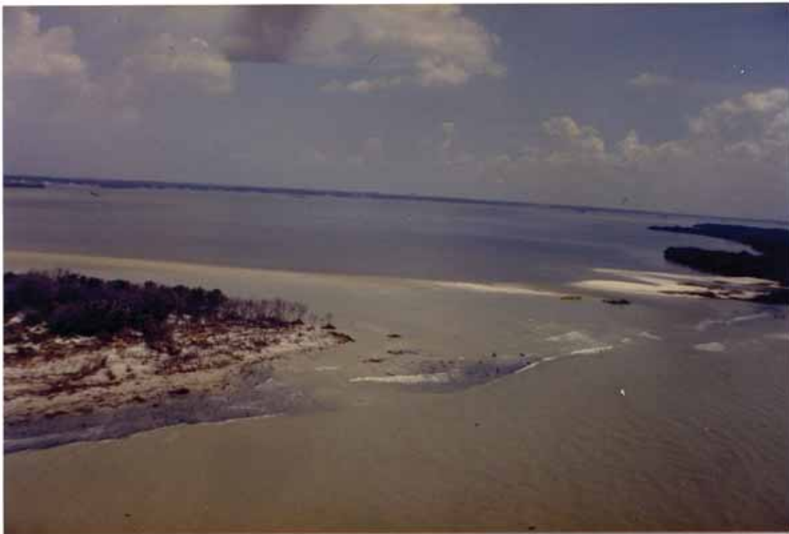
FIGURE 49. Major inlet breakthrough on Caladesi Island