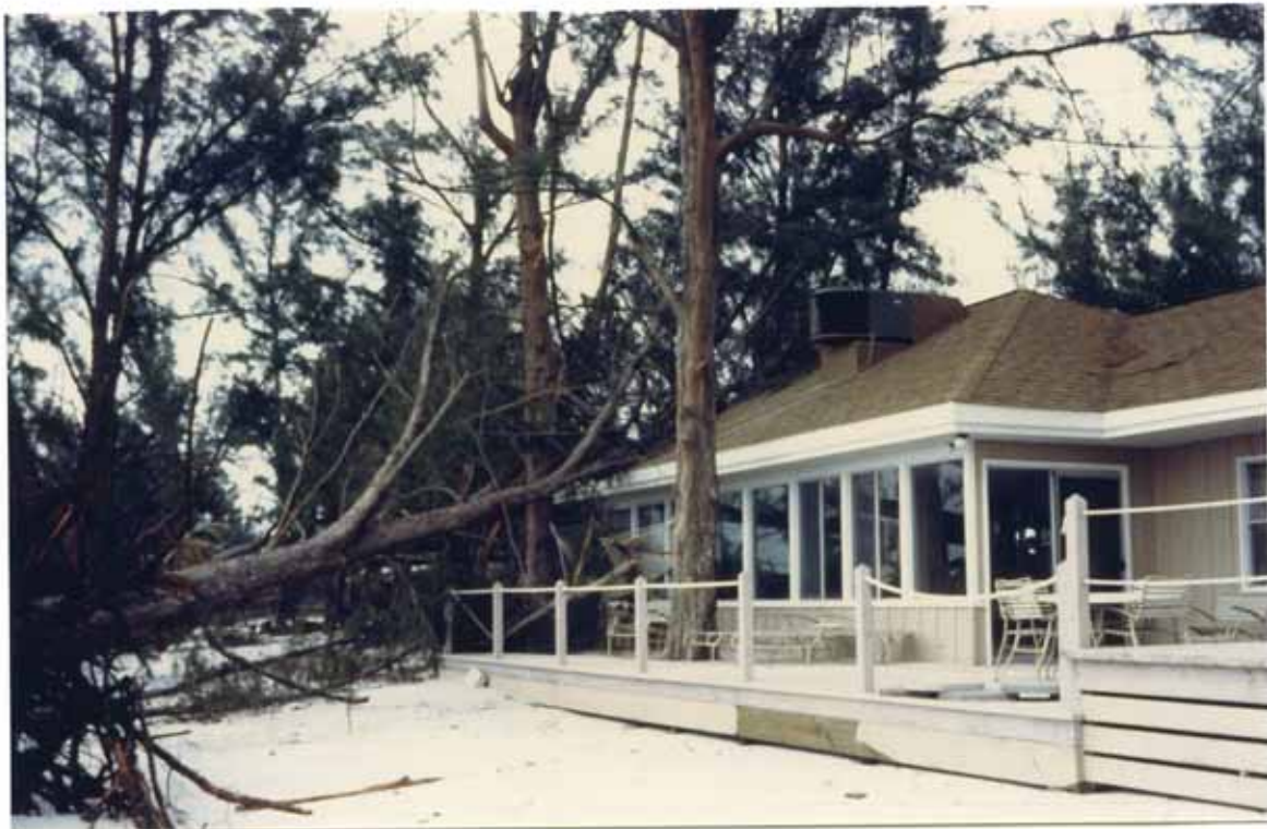
FIGURE 146. Australian pine toppled by erosion (S. West)