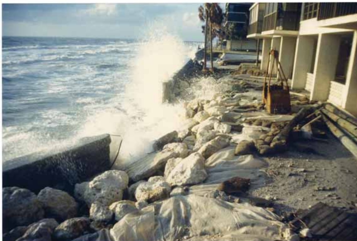
FIGURE 116. Emergency revetment protection from Juan