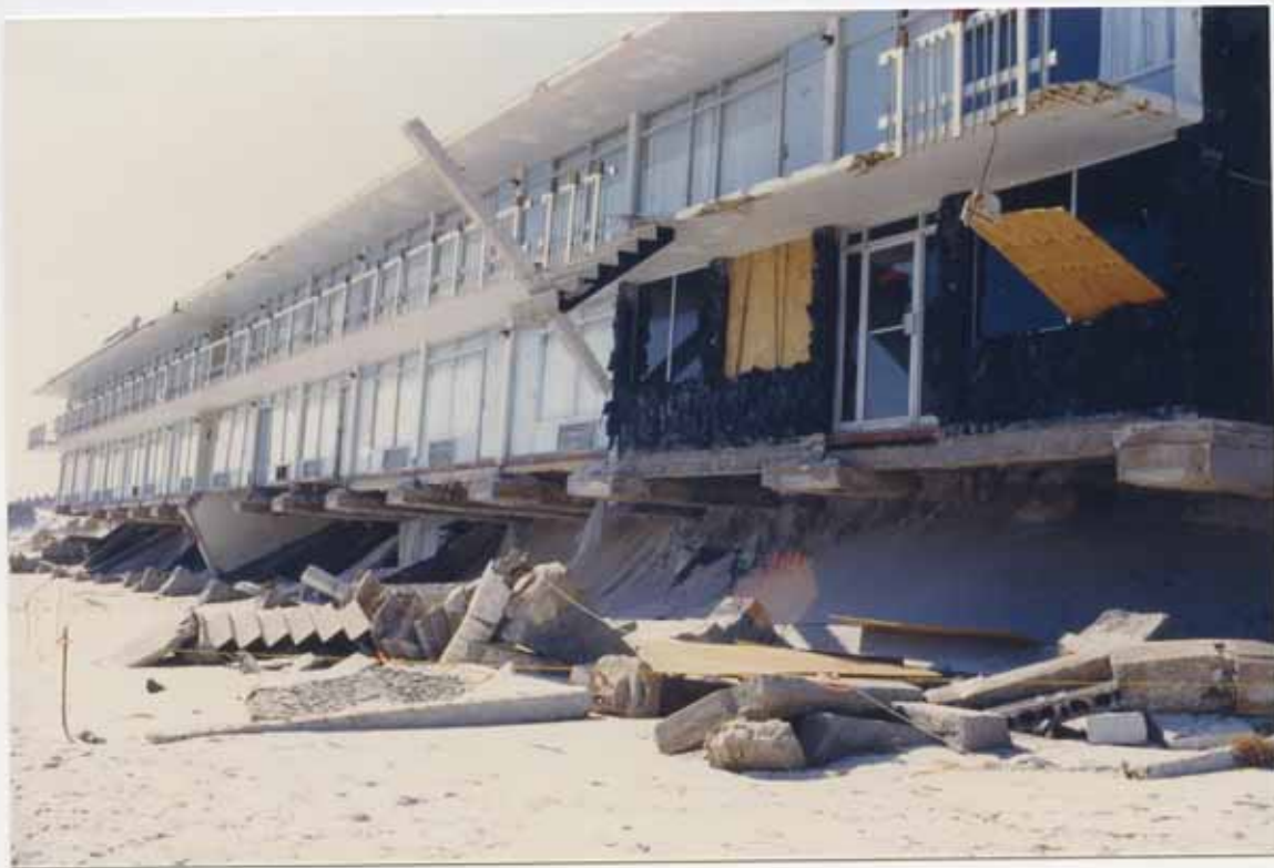
FIGURE 2. Dunes Motel damaged by Elena's erosion, Pensacola Beach (D. Dodder)