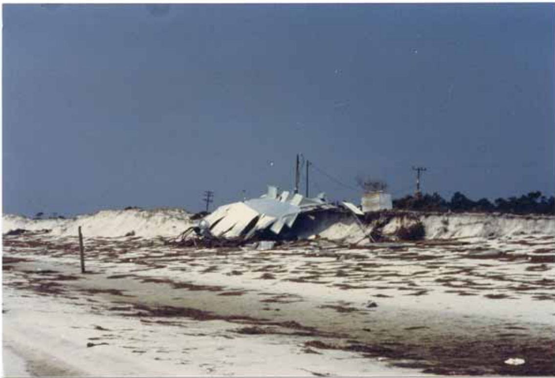
FIGURE 12. Metal community center destroyed by Elena's waves, Dog Island (G. L. Hill)