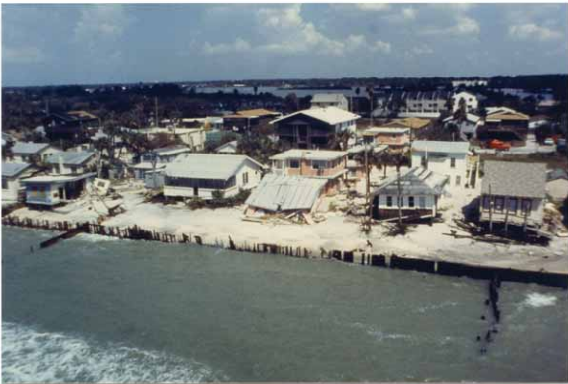
FIGURE 89. Bulkheads and dwellings destroyed and damaged