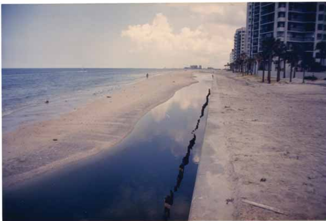
FIGURE 51. Scoured beach adjacent vertical bulkhead