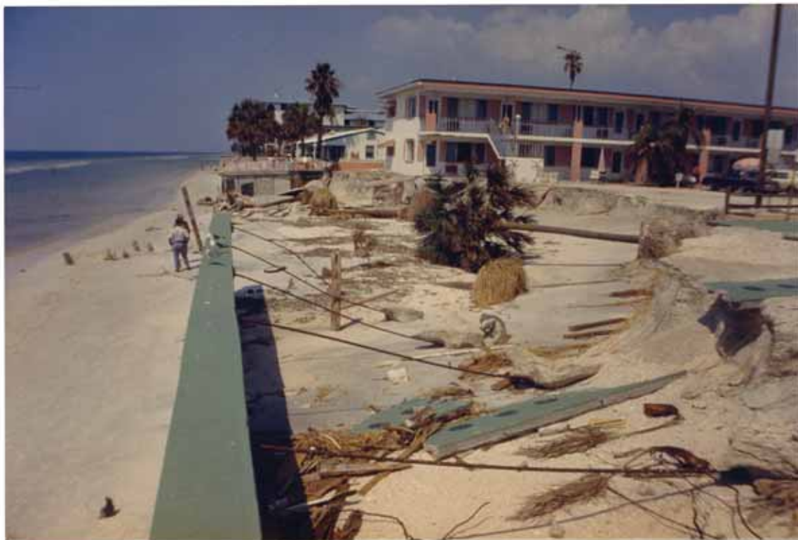
FIGURE 77. Elena destroyed 22nd Avenue