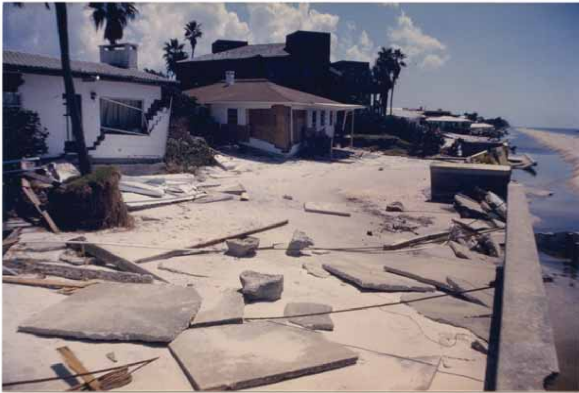
FIGURE 62. North Belleair Shore damage