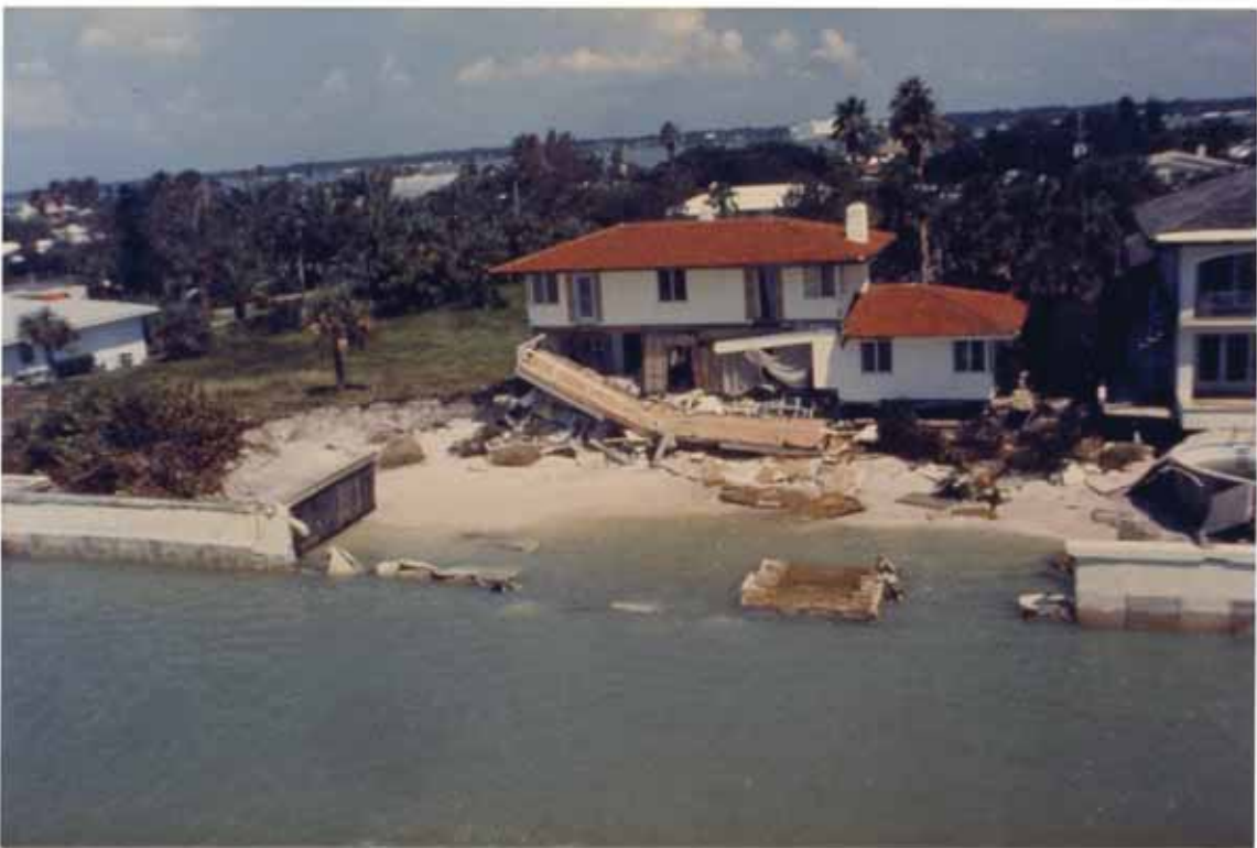
FIGURE 67. Wall destroyed and dwelling damaged