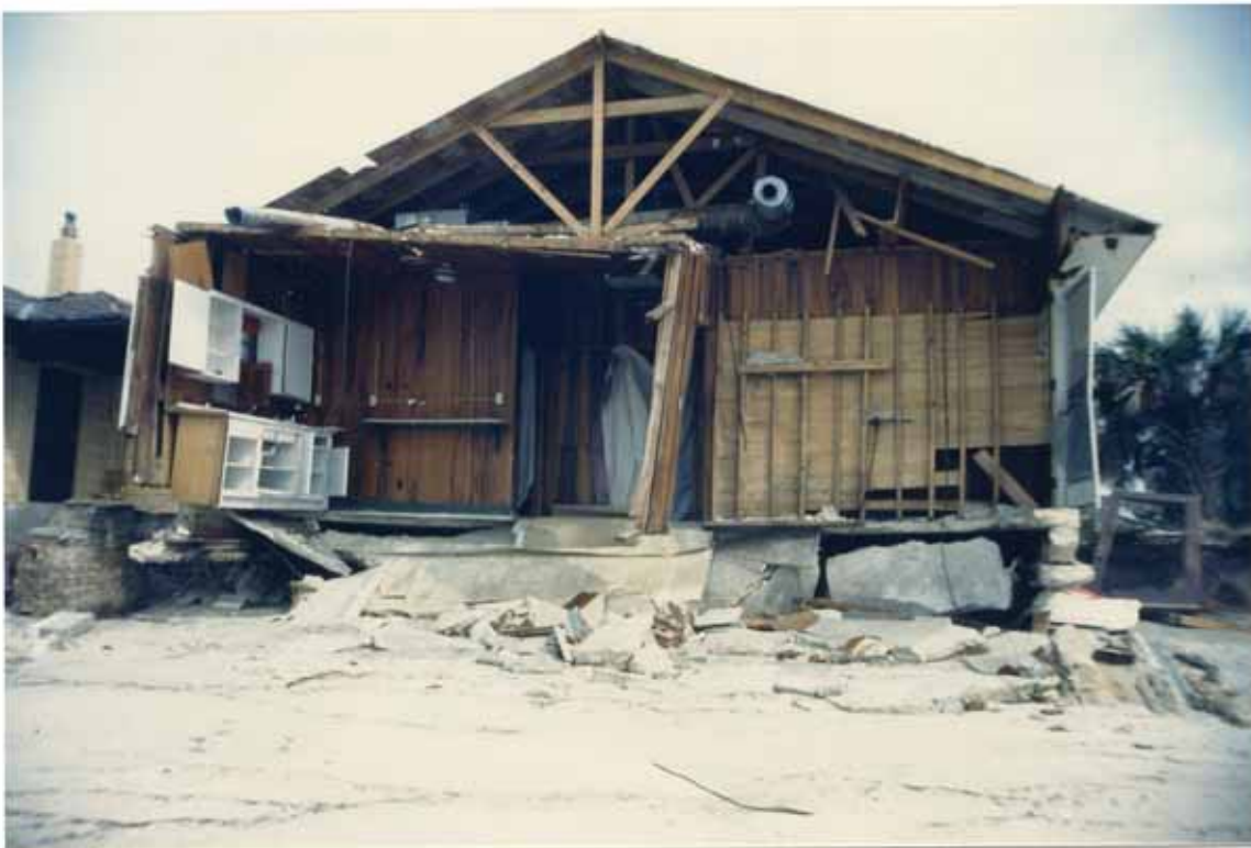
FIGURE 87. Same dwelling damaged by Juan