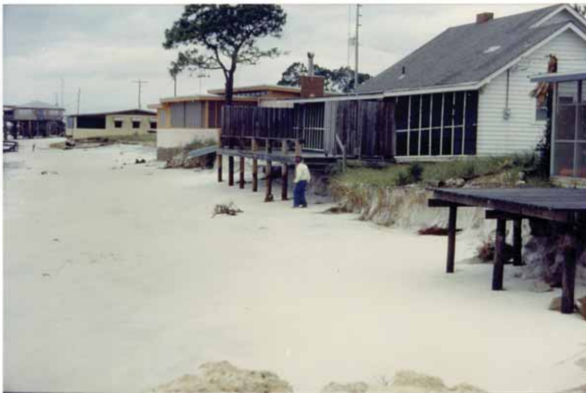
FIGURE 36. Erosion of Elena's first pass on August 30 (H. N. Bean)