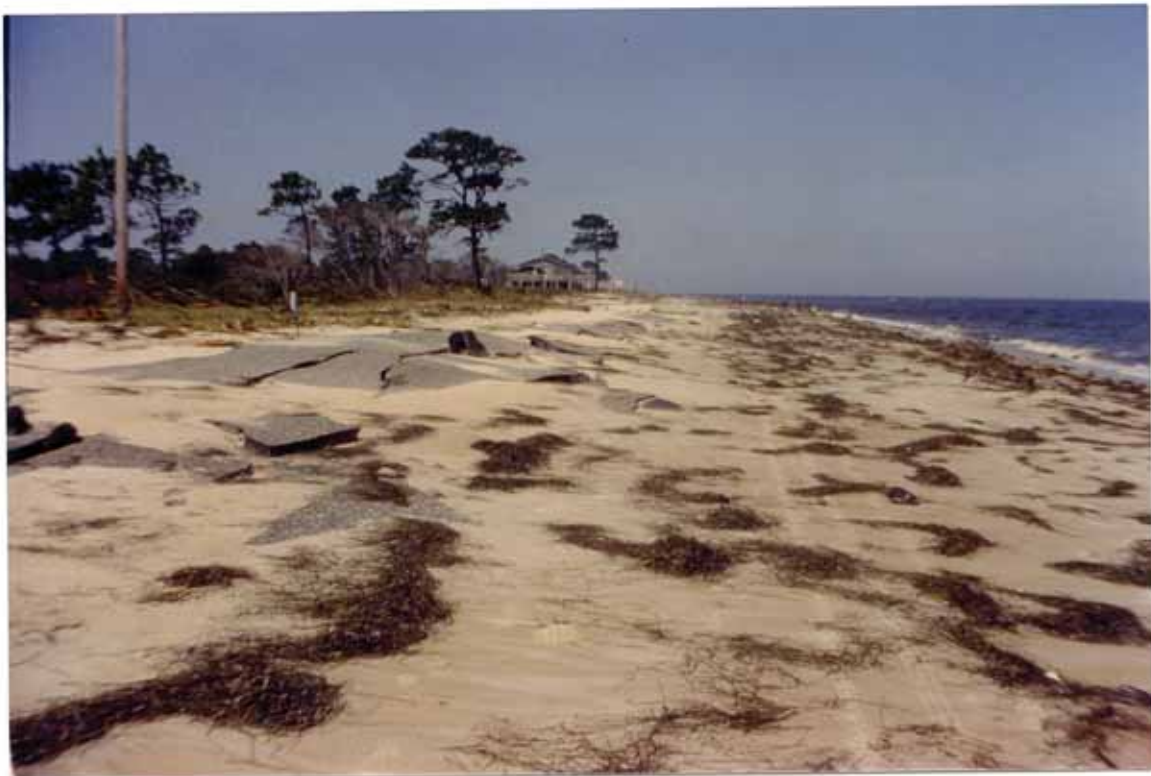
FIGURE 45. Lighthouse Point road destroyed on September 1