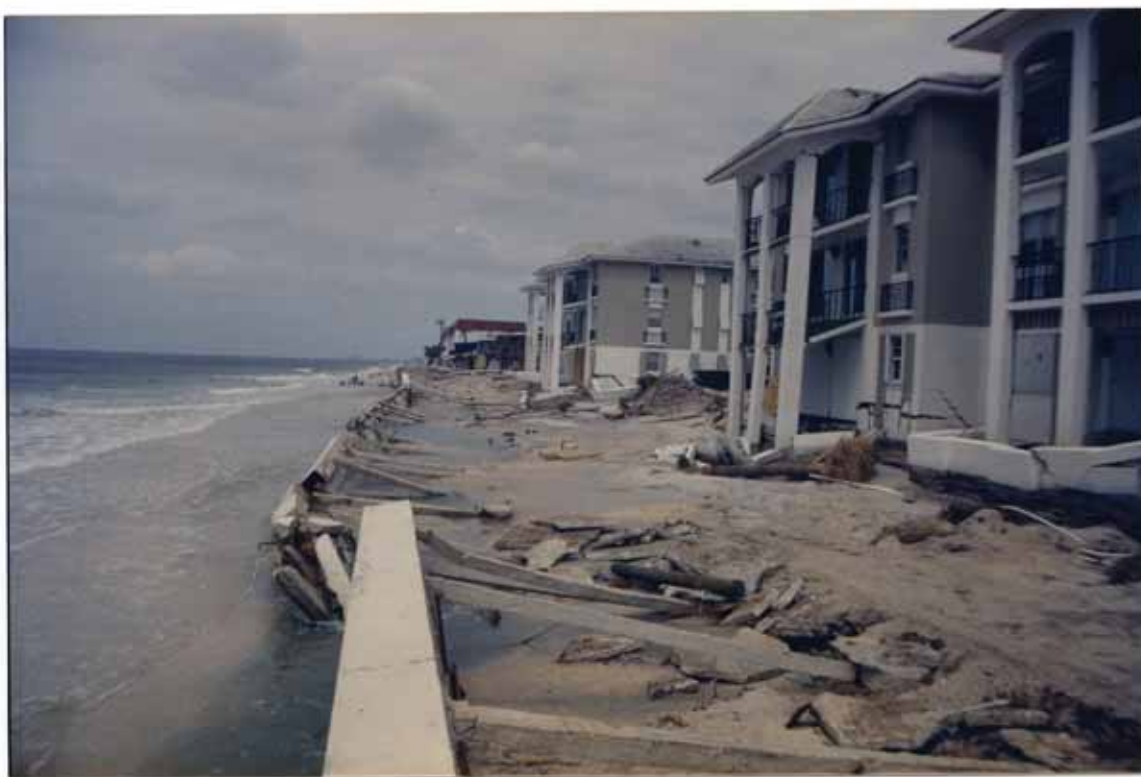
FIGURE 58. Tortugas Condominium bulkhead destroyed and buildings damaged