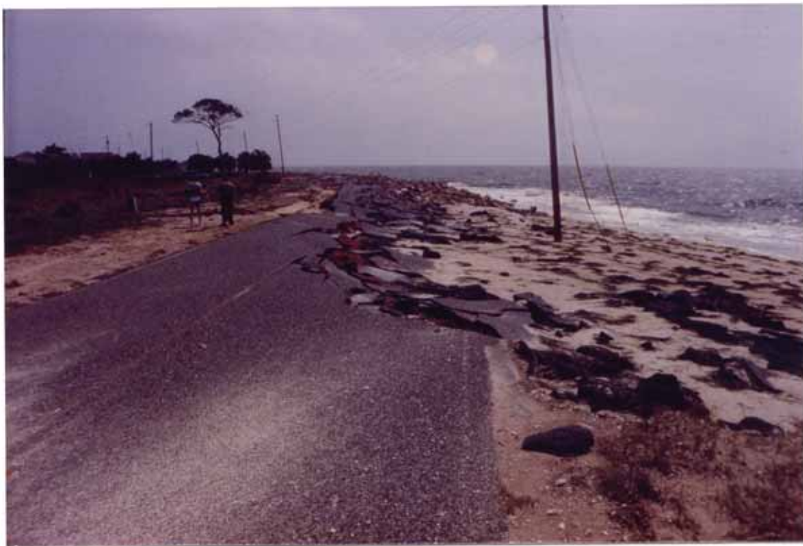
FIGURE 31. Elena's second pass destroyed County Road C370 on September 1