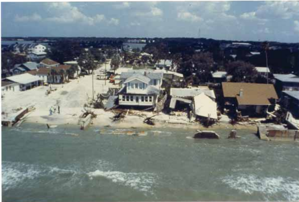
FIGURE 91. Bulkheads and dwellings destroyed and damaged