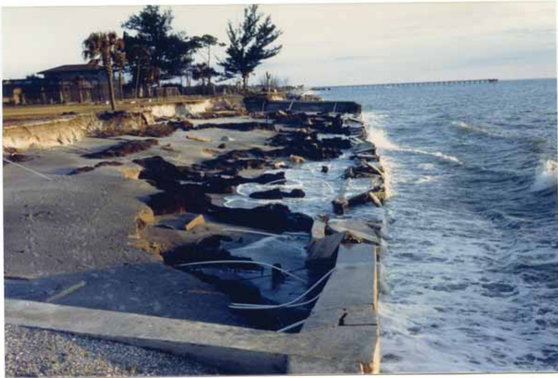
FIGURE 153. Juan destroyed Venice bulkhead (S. West)