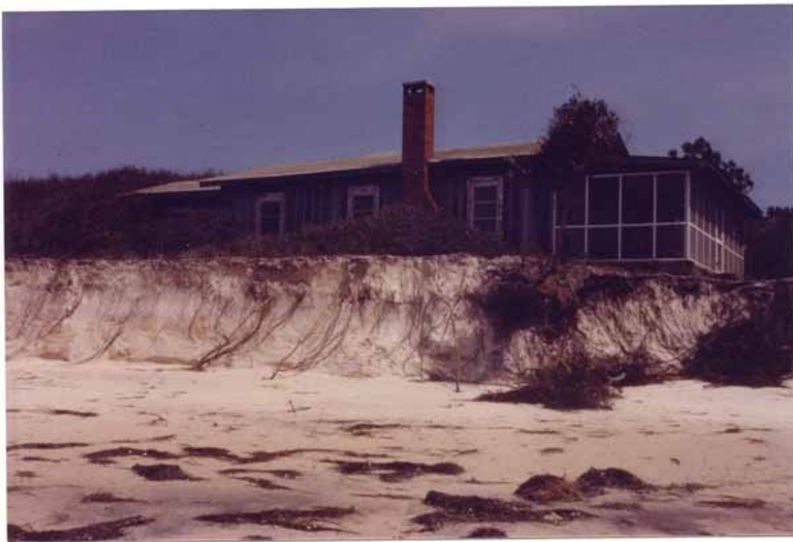
FIGURE 26. Southwest Cape dwelling threatened by Elena's erosion