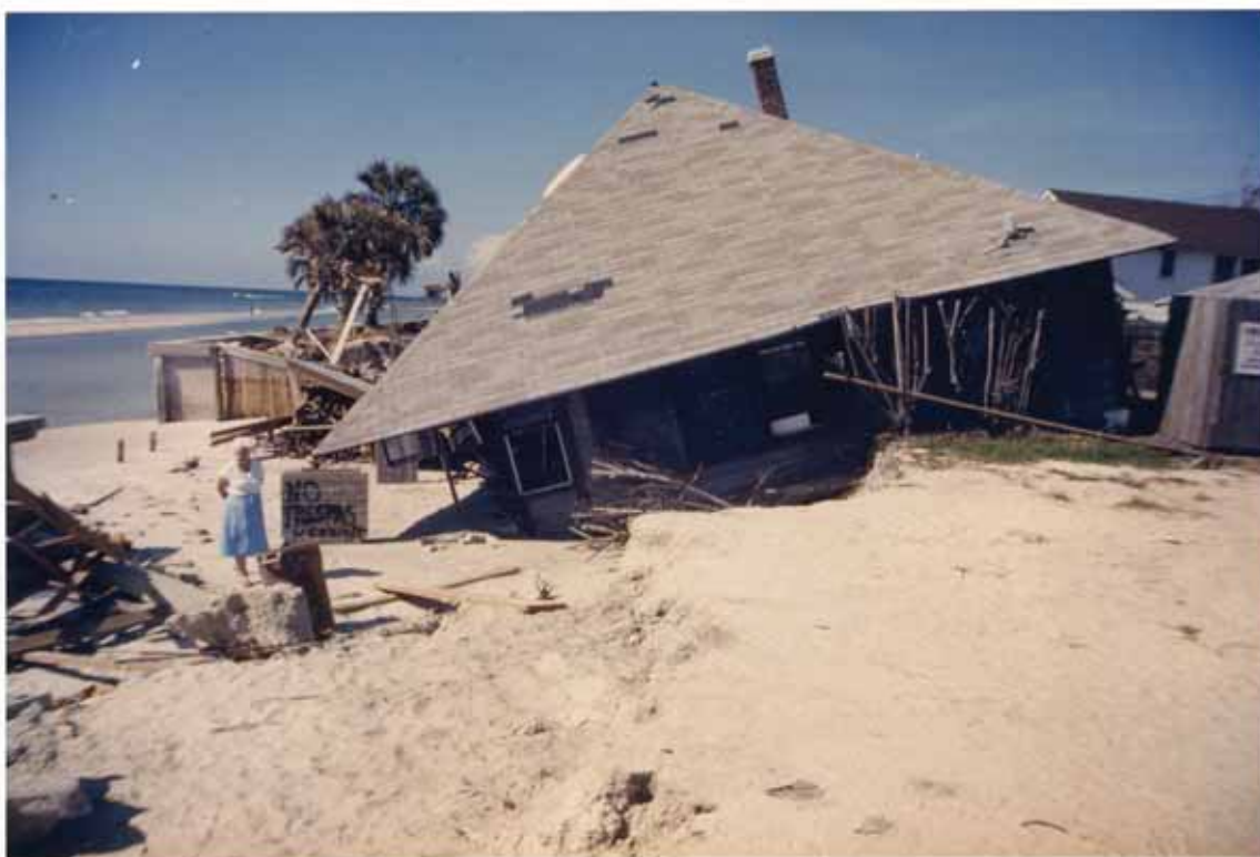
FIGURE 96. Dwelling destroyed by Elena, 2nd Avenue