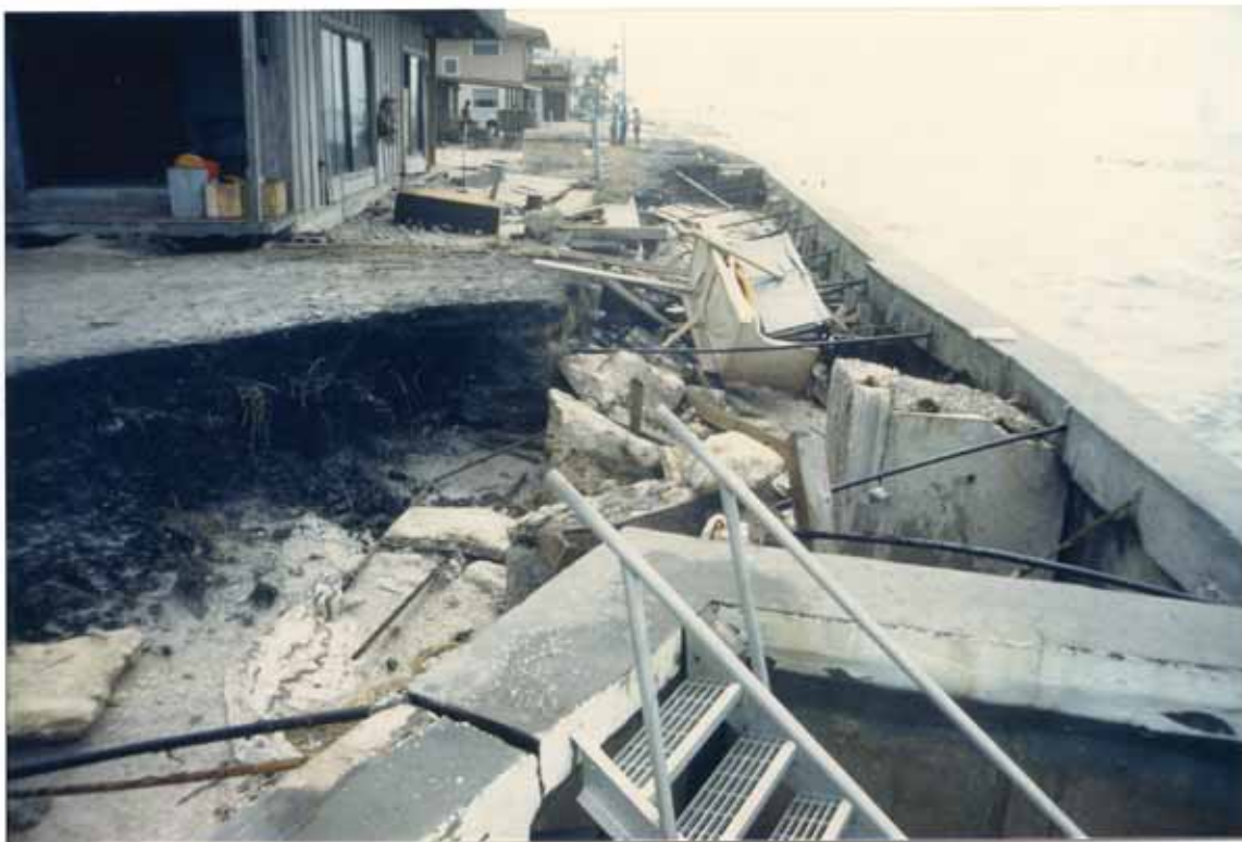
FIGURE 95. Juan eroded street-end fill, 7th Avenue