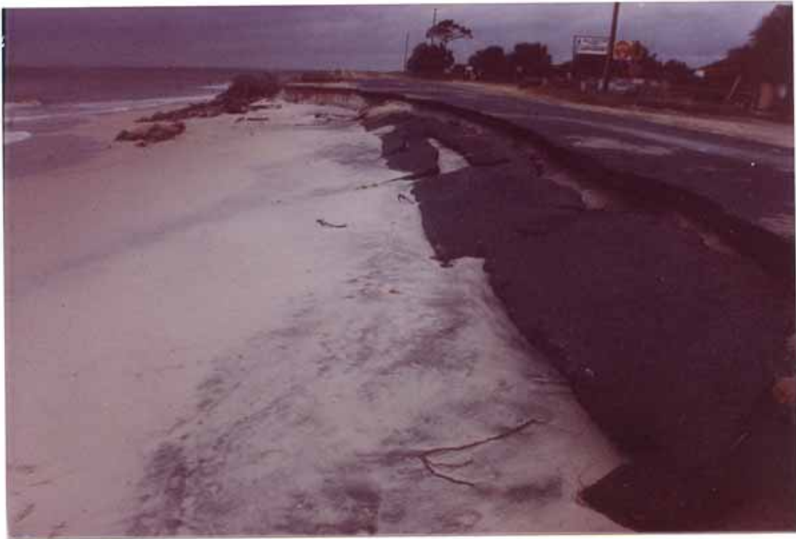
FIGURE 30. Elena's first pass damaged County Road C370 on August 30