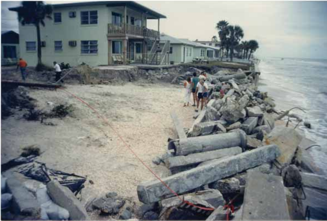
FIGURE 76. Juan destroyed 23rd Avenue