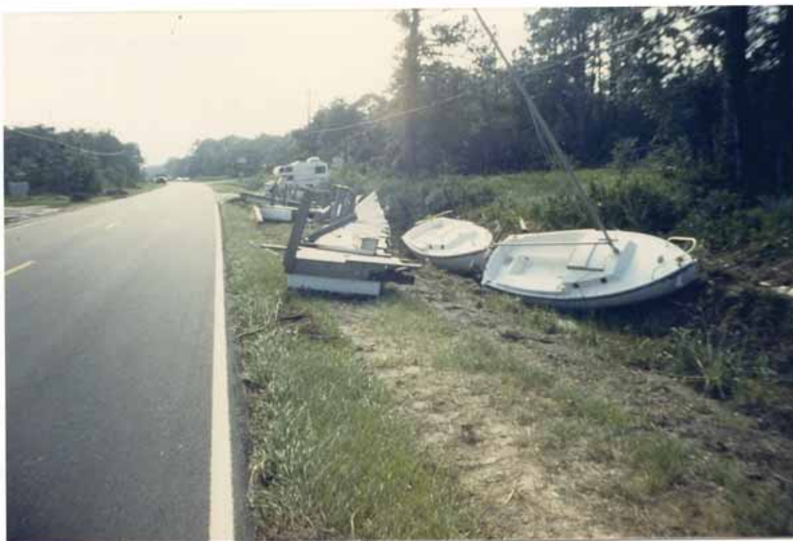
FIGURE 23. Elena's flooding at Lanark Marina, U.S. 98