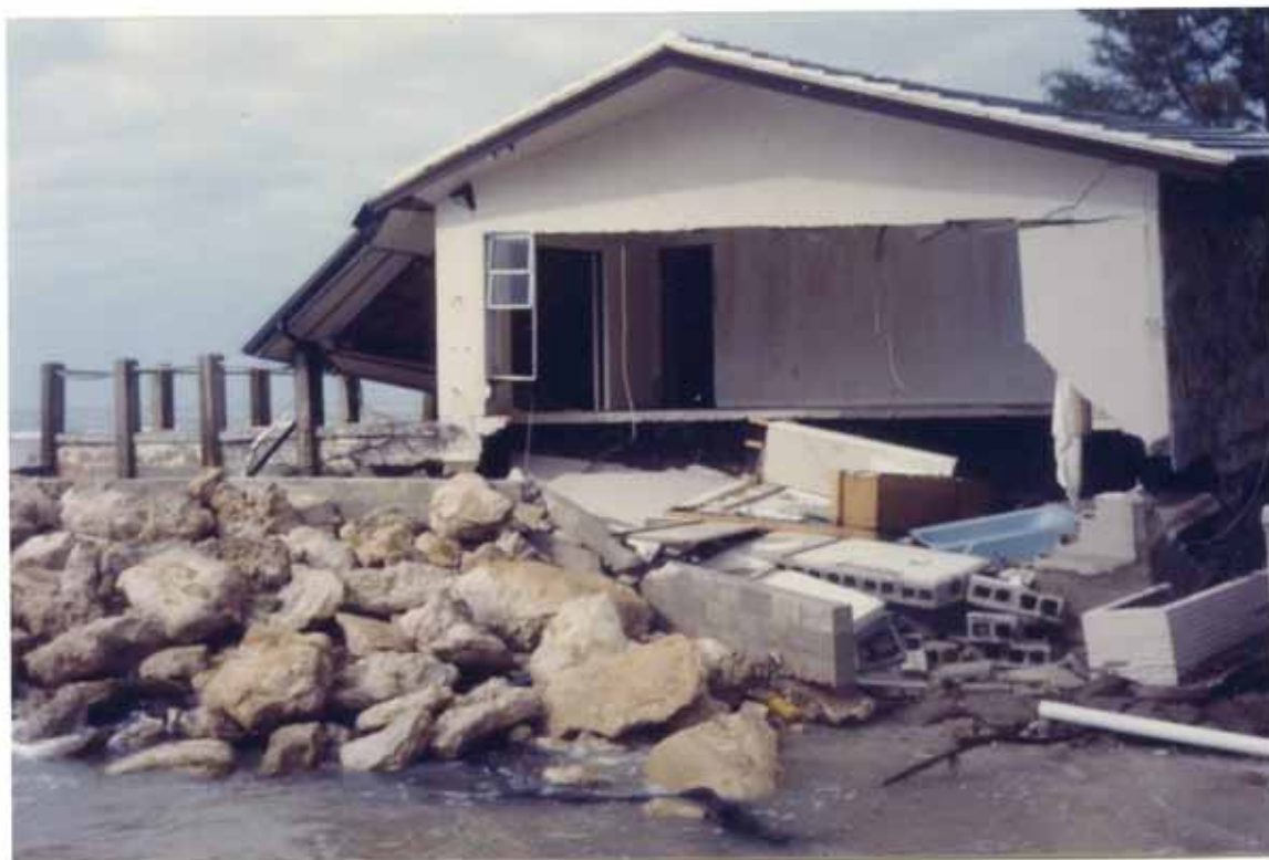
FIGURE 144. Same dwelling destroyed by wave flanking (M. Joity)