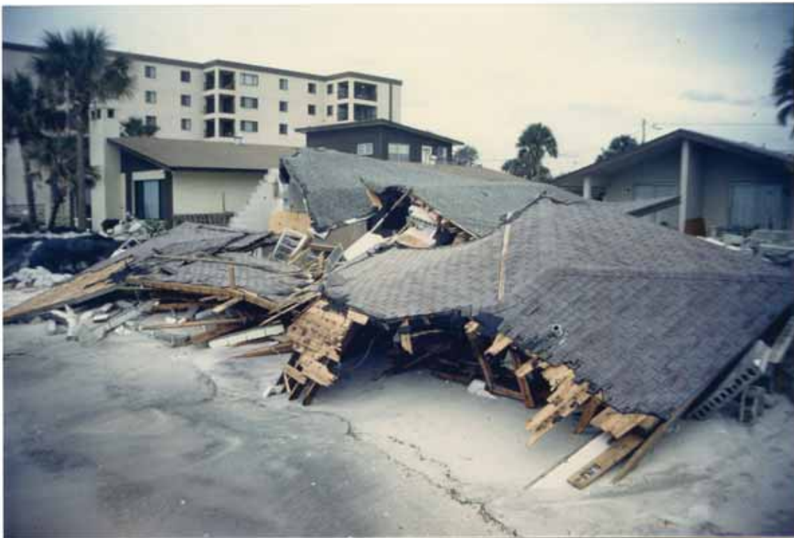
FIGURE 71. Dwelling destroyed by Juan