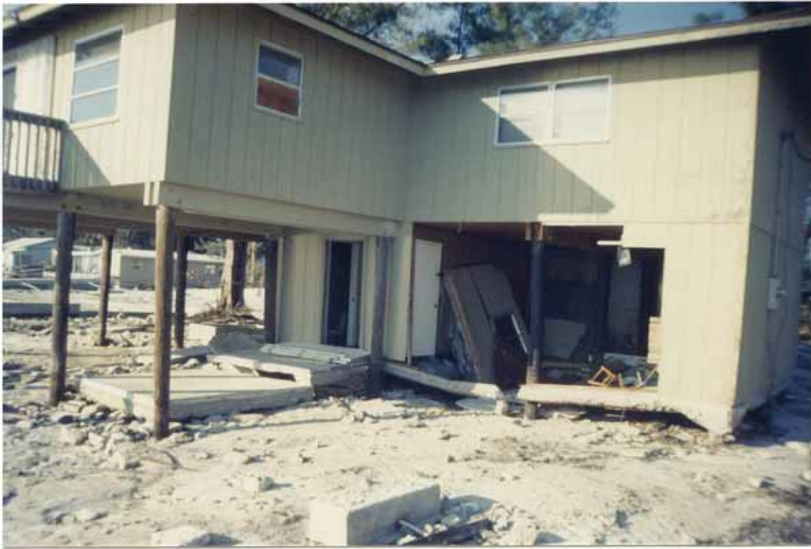
FIGURE 141. Subfloor damage to Longboat Key dwelling