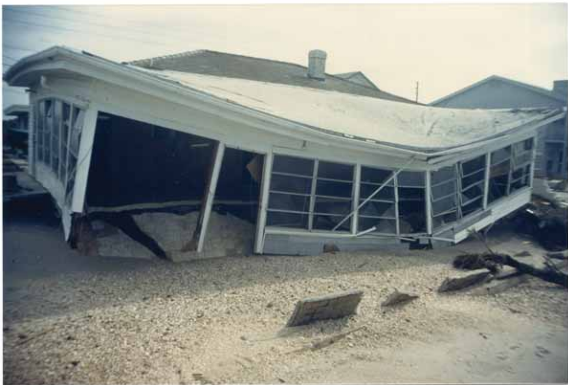
FIGURE 104. Same dwelling with beach accreted by Juan