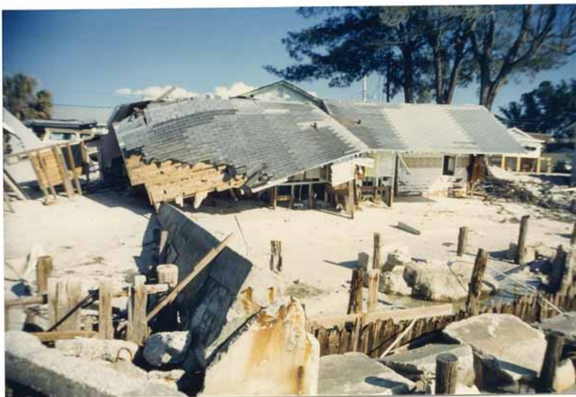
FIGURE 136. Bradenton Beach dwelling destroyed by Elena