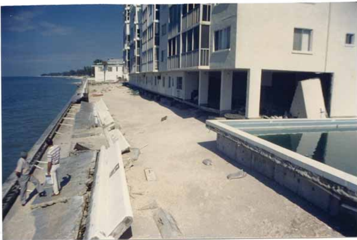
FIGURE 126. Juan destroyed sloping wall at Martinique Condominium