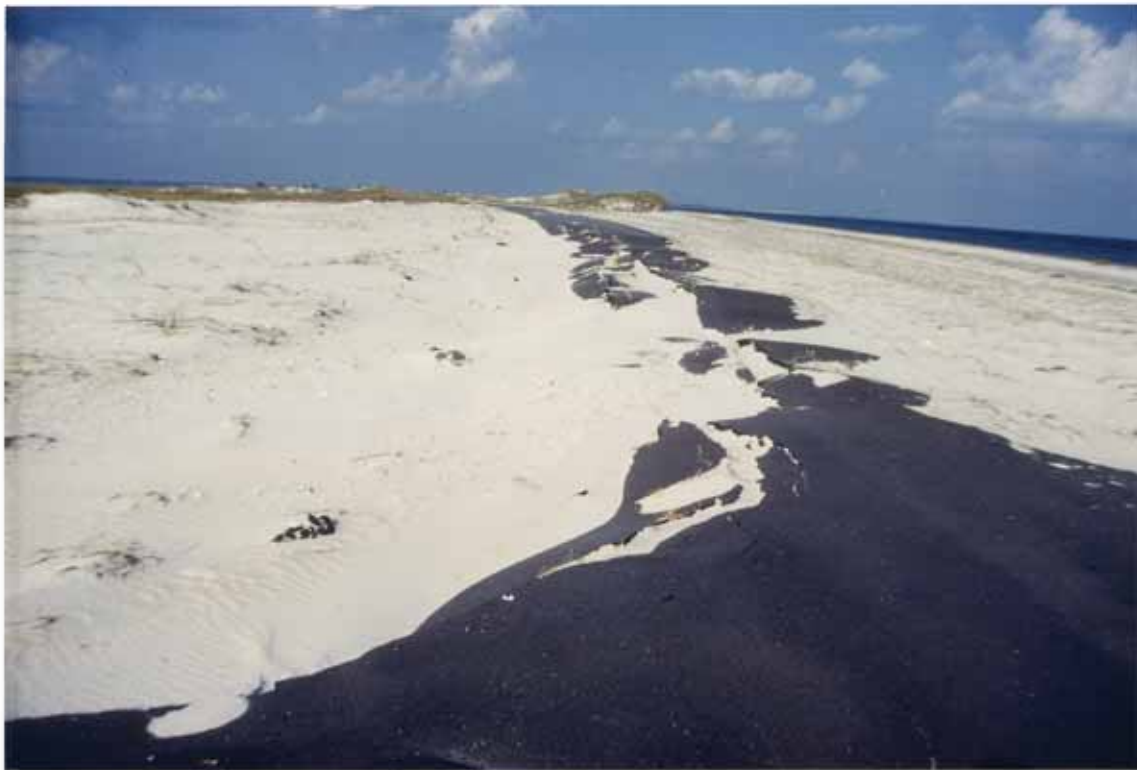
FIGURE 10. Park road segment destroyed by Elena, St. George Island