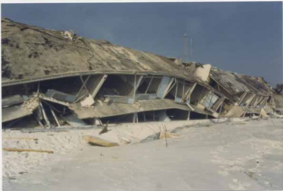
FIGURE 3. Dunes Motel destroyed by Juan, Pensacola Beach (G. L. Hill)