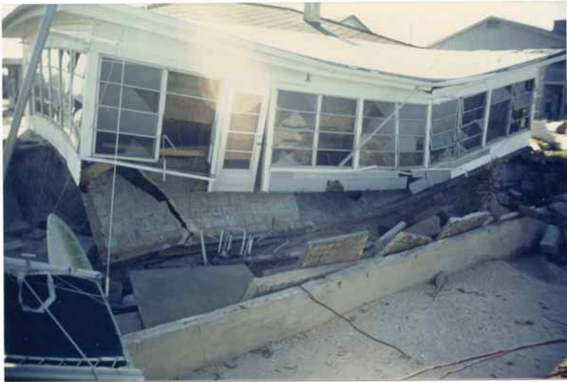
FIGURE 103. Indian Shores dwelling destroyed by Elena