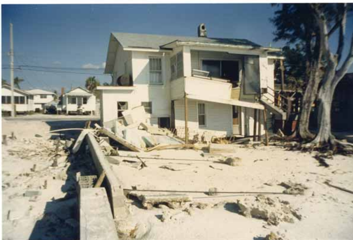
FIGURE 140. Dwelling damaged and settled