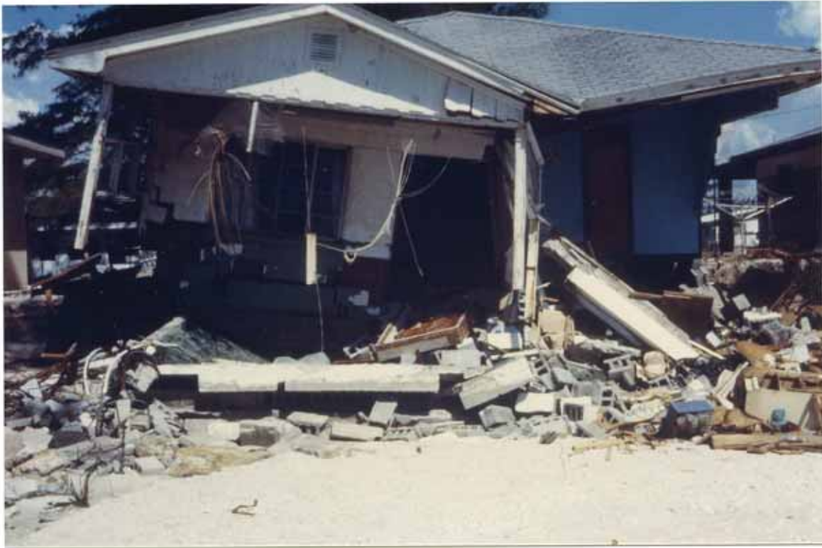
FIGURE 131. Holmes Beach dwelling destroyed by Elena (S. West)