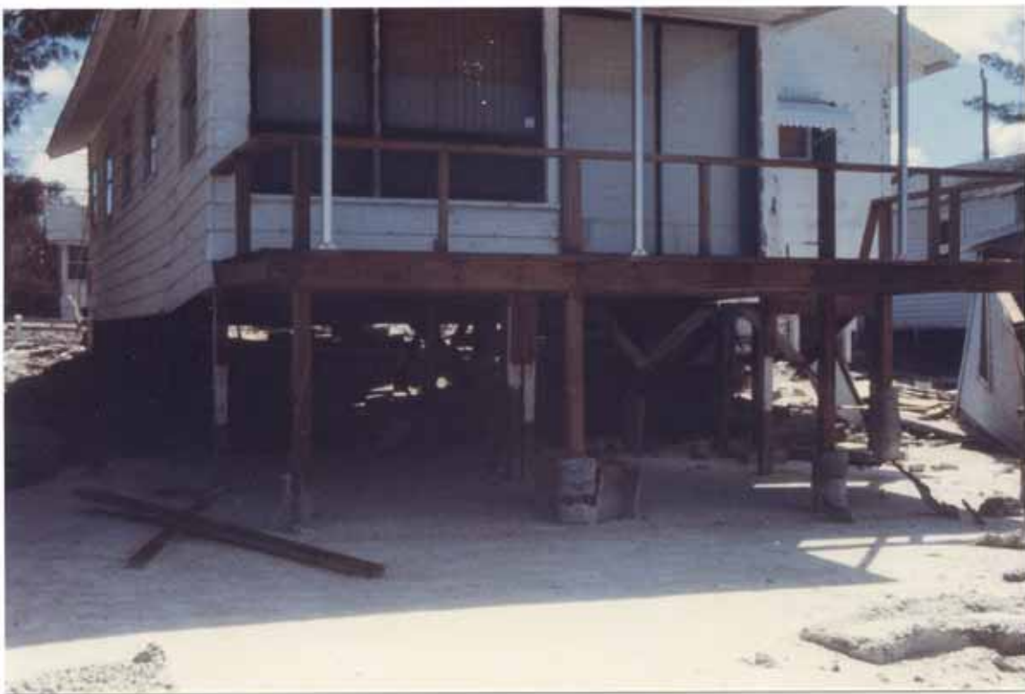
FIGURE 137. Bradenton Beach dwelling damaged by Elena