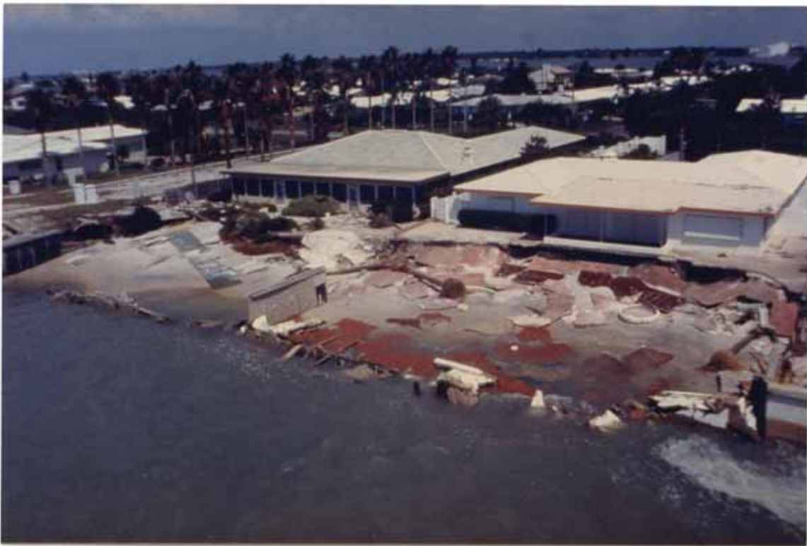
FIGURE 66. Beach, wall, and property destroyed