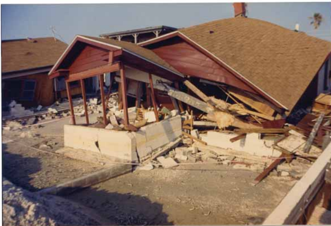
FIGURE 105. Dwelling destroyed by Elena