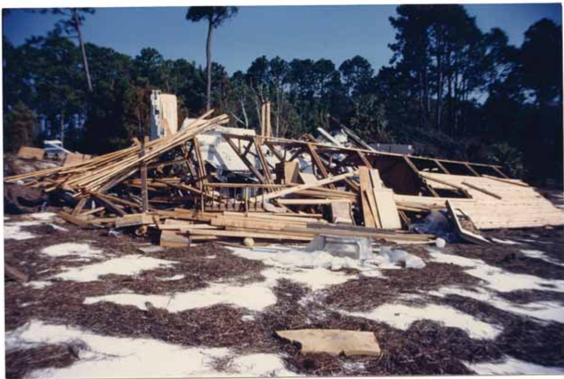
FIGURE 21. Carrabelle Beach dwelling destroyed by Elena