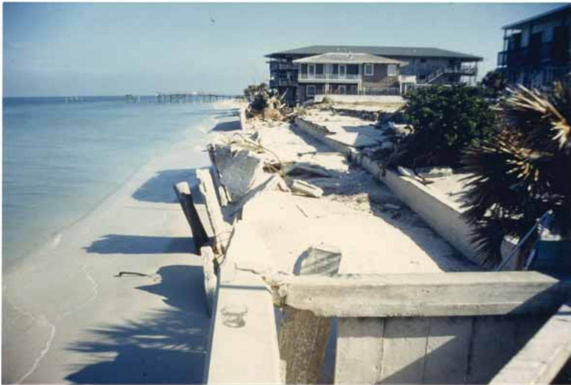
FIGURE 101. South Indian Rocks Beach after Elena