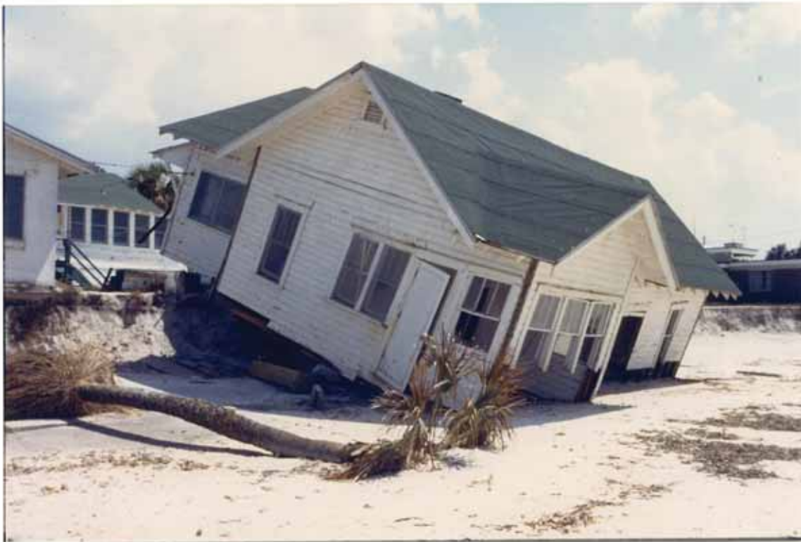
FIGURE 83. Frame dwelling collapsed when undermined