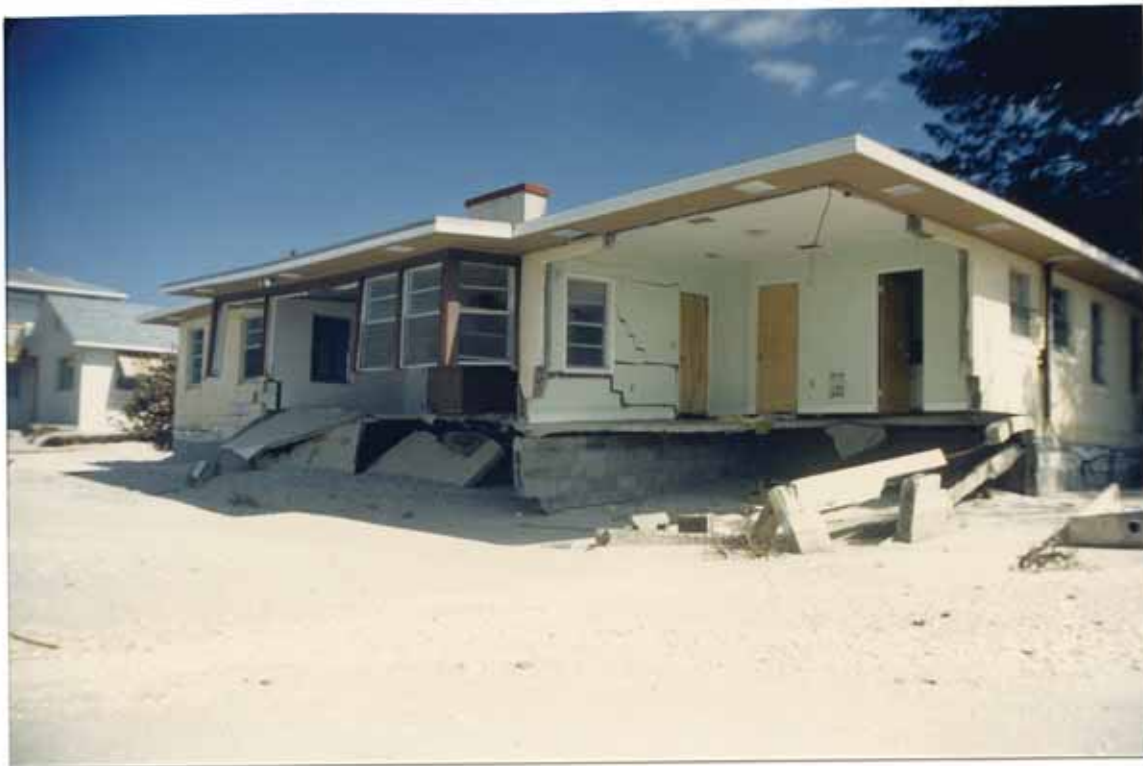
FIGURE 129. Juan's beach accretion at damaged dwelling