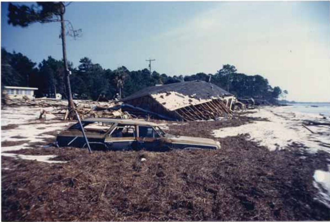
FIGURE 18. Carrabelle Beach after Elena