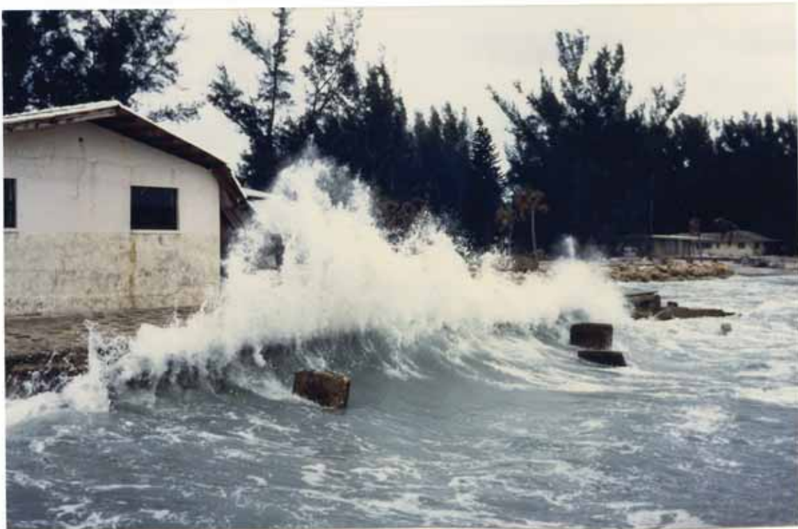
FIGURE 143. Longboat Key dwelling under wave attack (S. West)