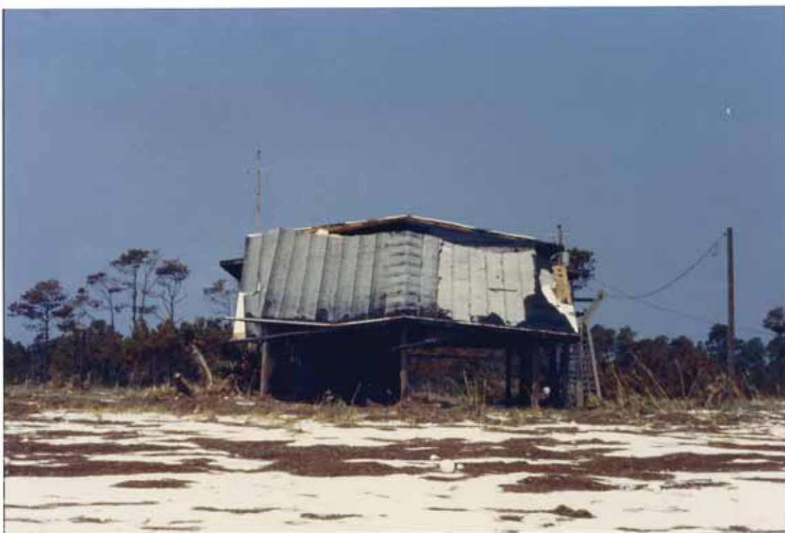
FIGURE 11. Dwelling damaged by Elena's wind, Dog Island