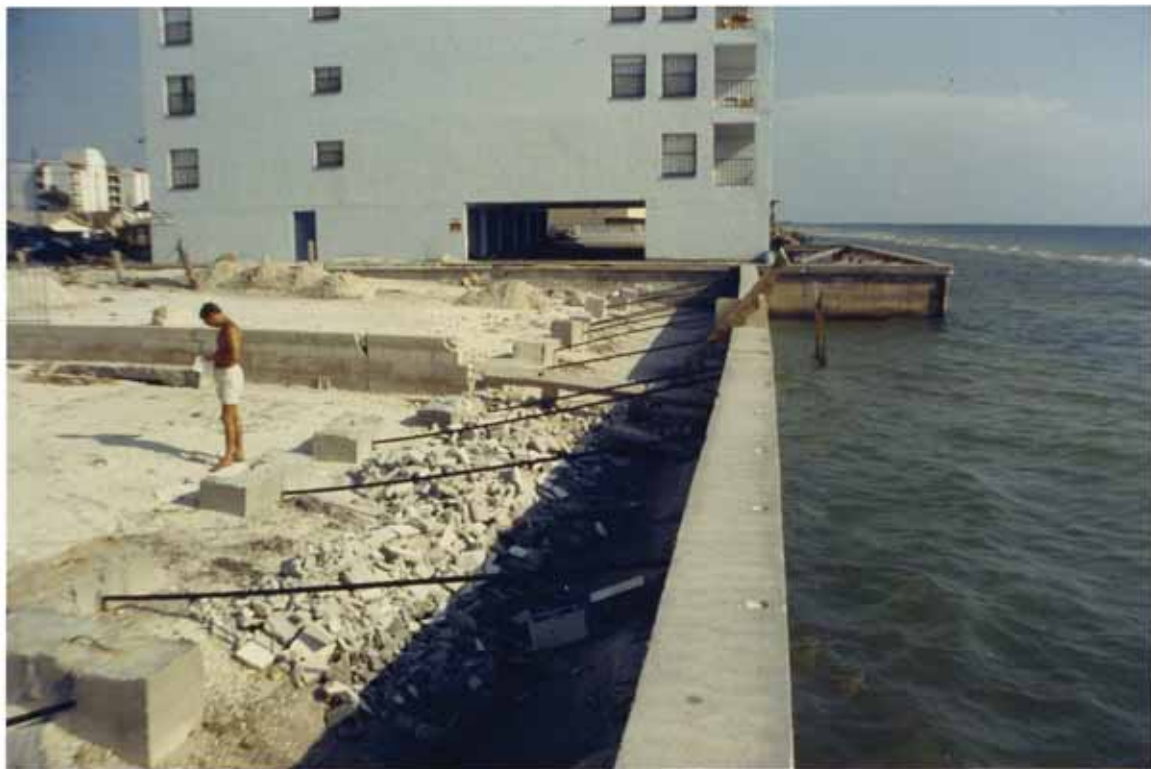
FIGURE 112. No beach at 193rd Avenue after Elena