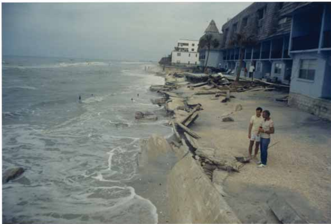
FIGURE 98. Happy Fiddler Condominium bulkhead after Juan