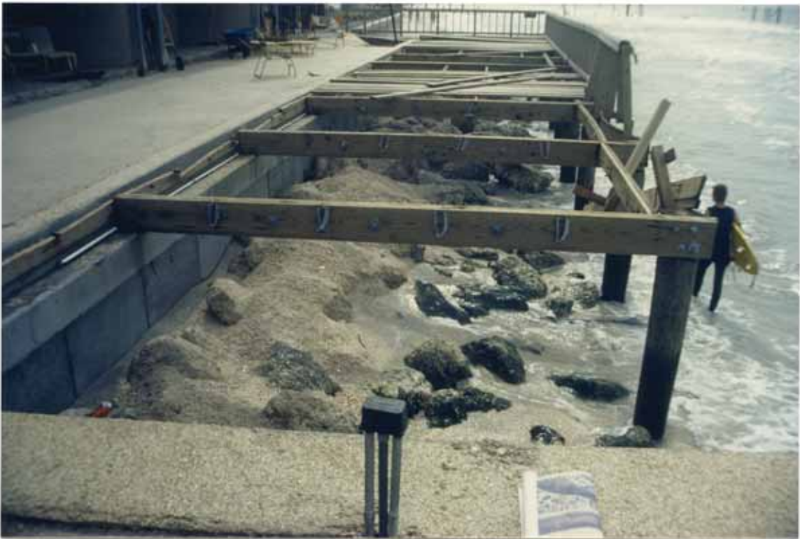
FIGURE 100. Toe-scour protection after Juan