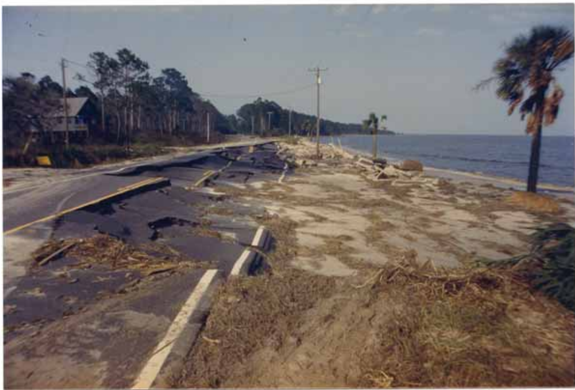
FIGURE 17. U.S. Highway 98 damaged by Elena