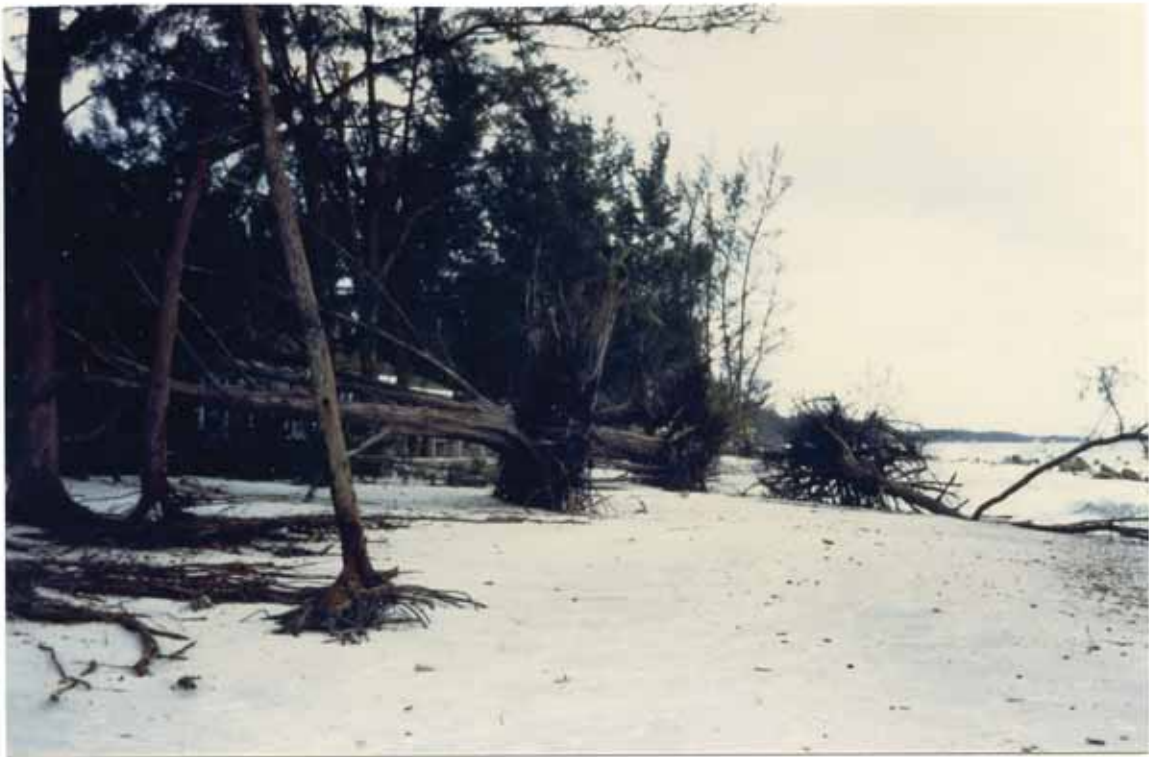
FIGURE 145. Severe erosion on Longboat Key