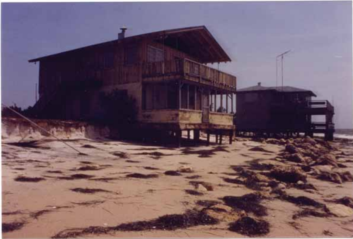
FIGURE 28. Southwest Cape revetment destroyed and dwelling undermined