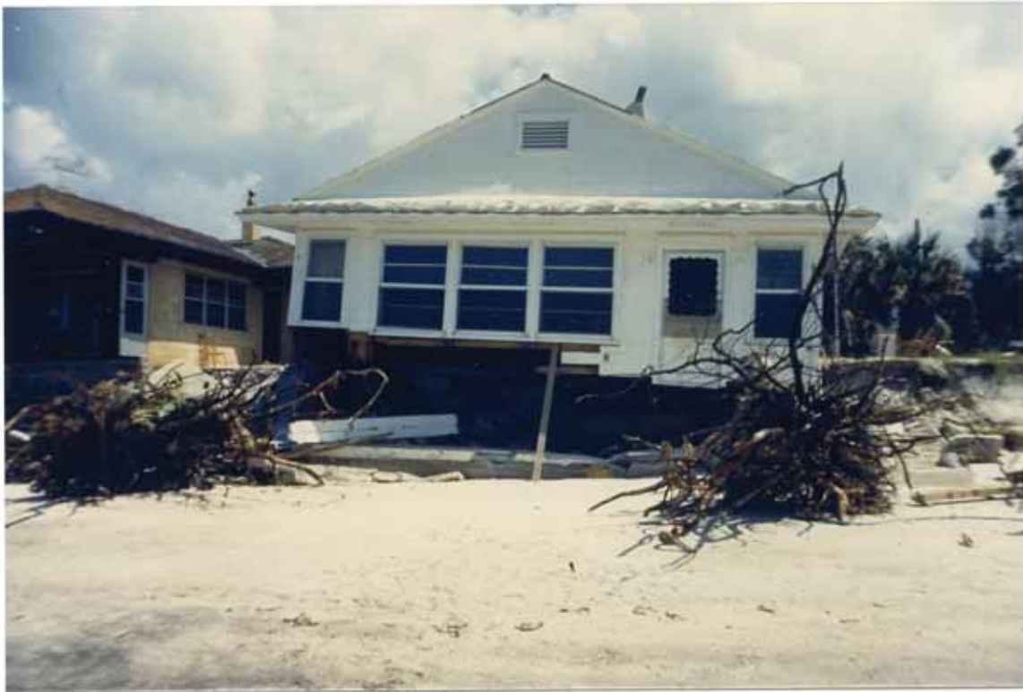
FIGURE 86. Dwelling damaged by Elena