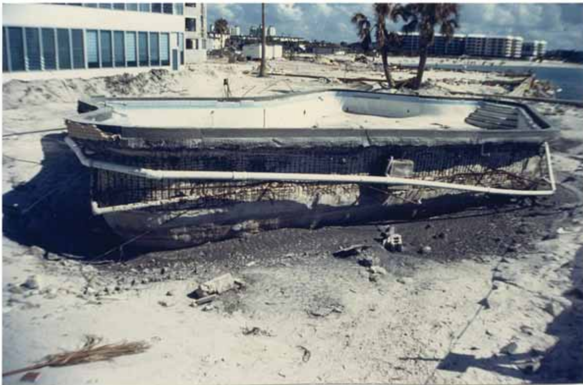
FIGURE 124. Pool at Starlight Tower Condominium floated above grade during Juan's flooding, St. Petersburg Beach