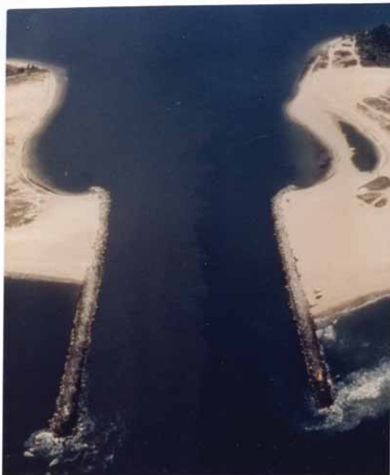
FIGURE 6. St. George Island Channel, November, 1984