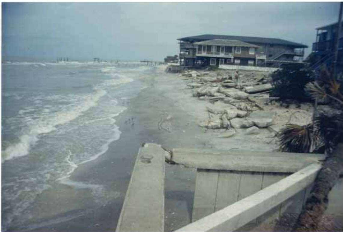
FIGURE 102. South Indian Rocks Beach after Juan