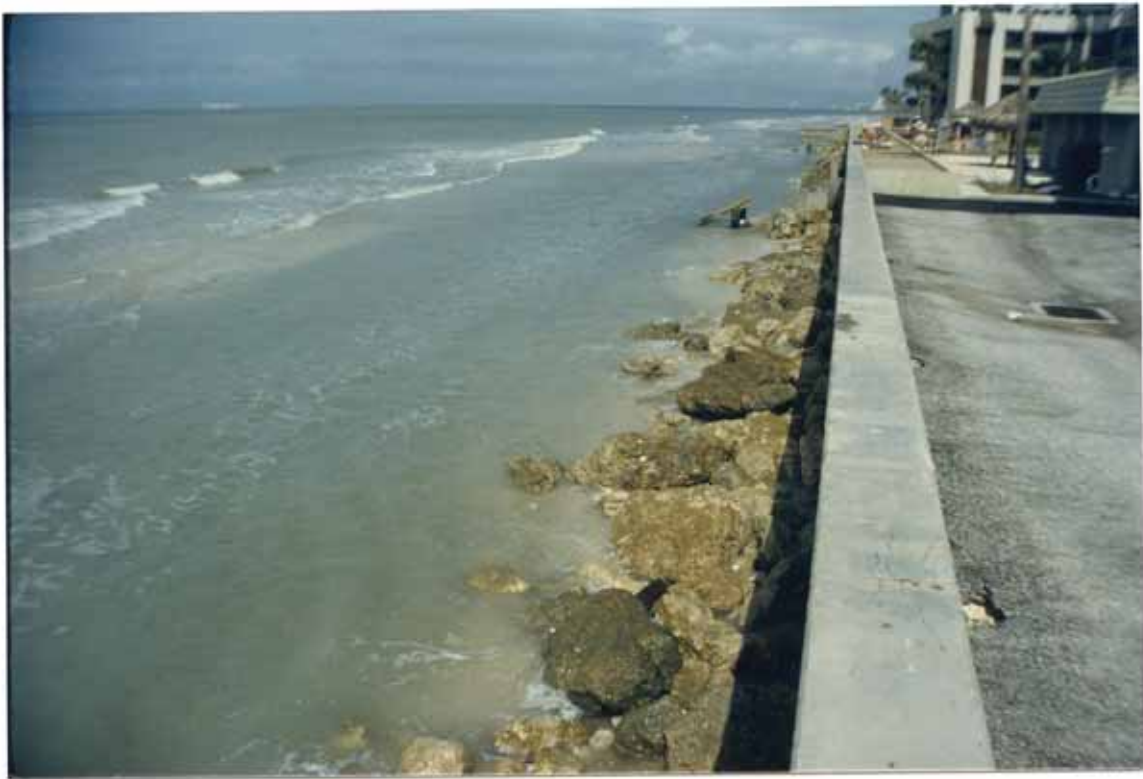
FIGURE 54. Beach erosion due to Juan at Montmartre Apartments