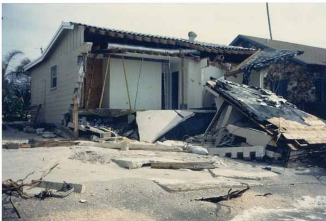
FIGURE 93. Dwelling damage by Juan