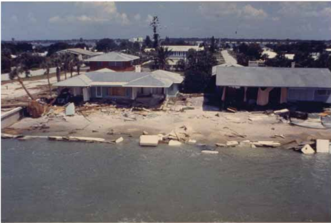
FIGURE 68. Wall destroyed and dwellings damaged