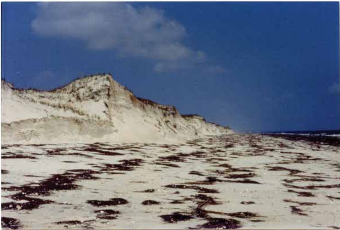
FIGURE 8. Dunes eroded by Elena, St. George Island (G. L. Hill)