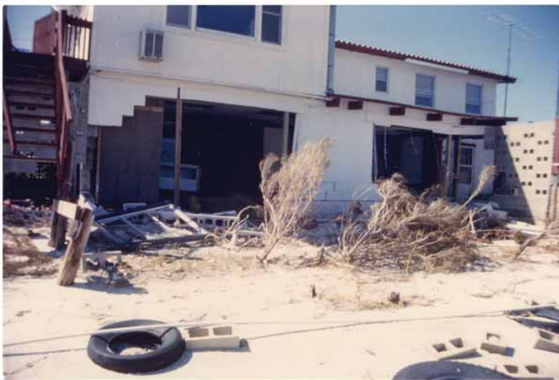
FIGURE 24. Alligator Harbor shoreline dwelling damaged by Elena