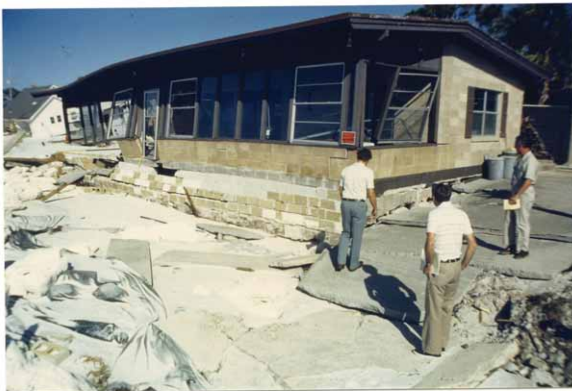
FIGURE 40. Concrete block dwelling damaged by Elena