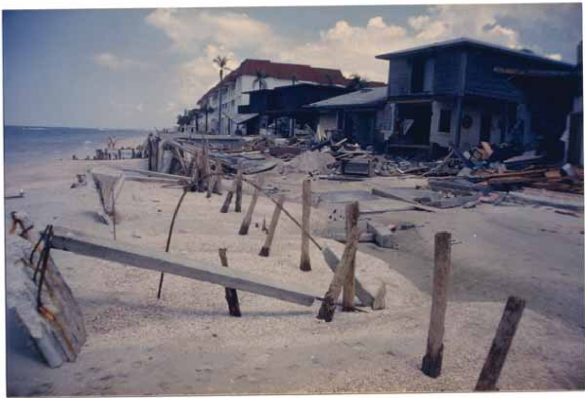
FIGURE 55. Concrete bulkhead destroyed by Elena, Belleair Beach