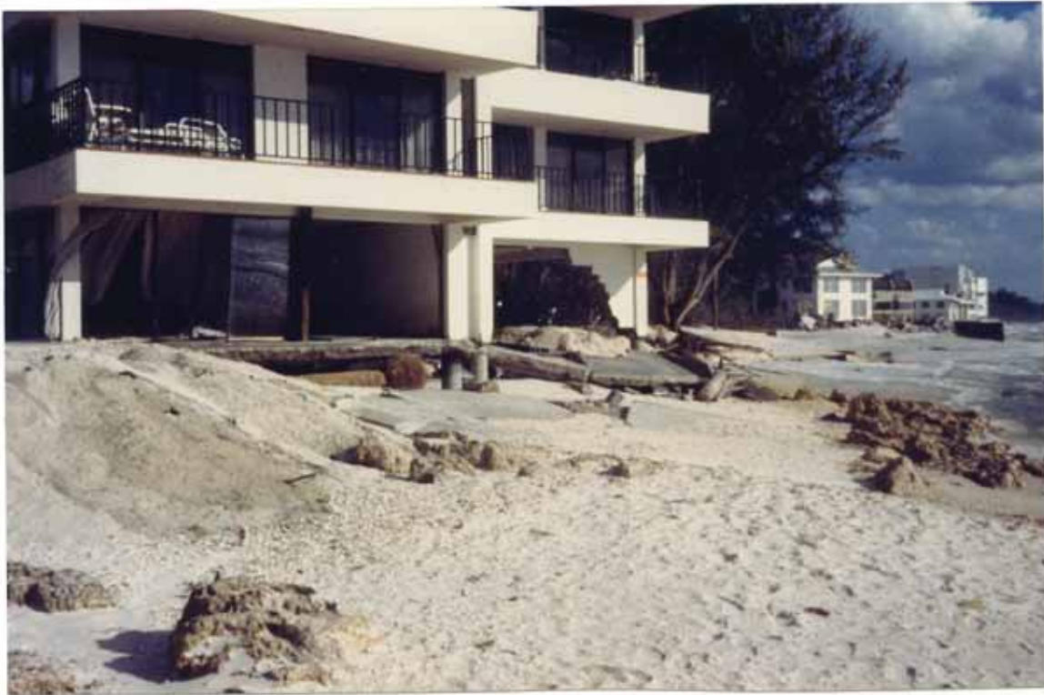
FIGURE 125. Waters Edge Condominium damaged by Elena (S. West)