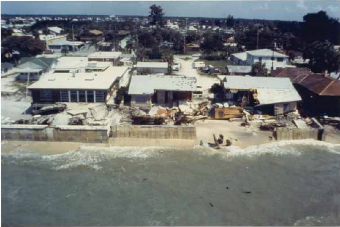
FIGURE 84. Bulkhead and dwellings damaged