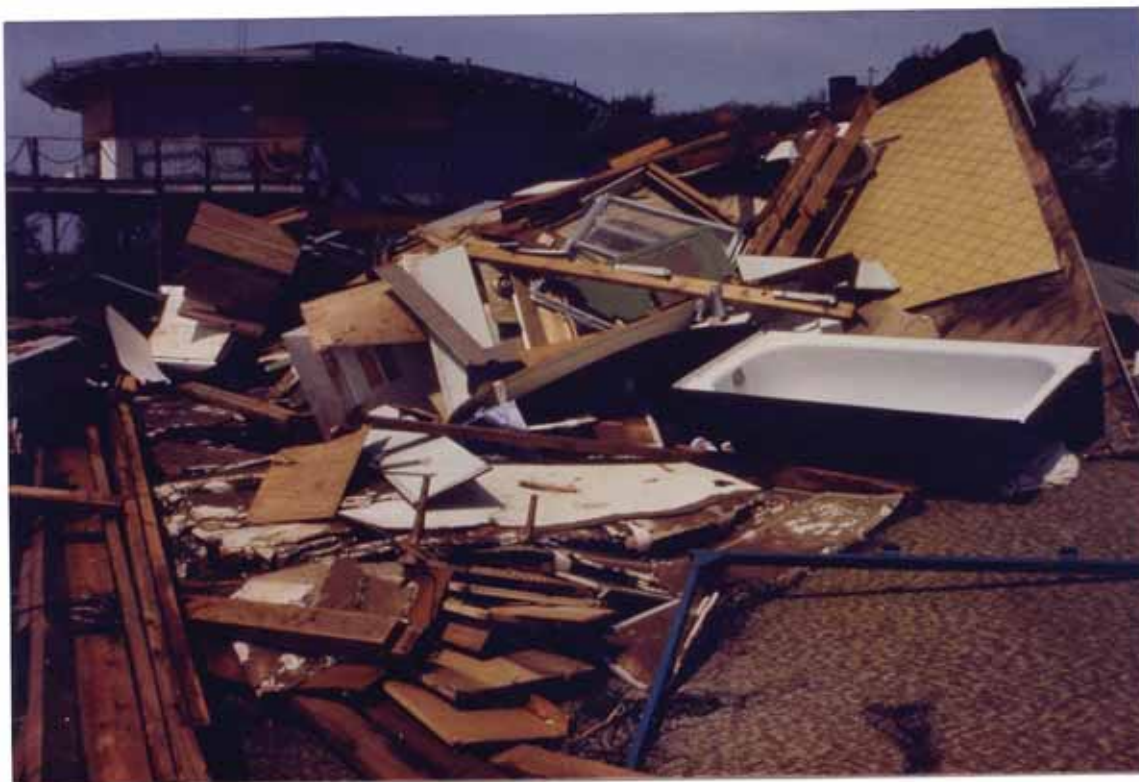
FIGURE 27. Southwest Cape dwelling destroyed by Elena