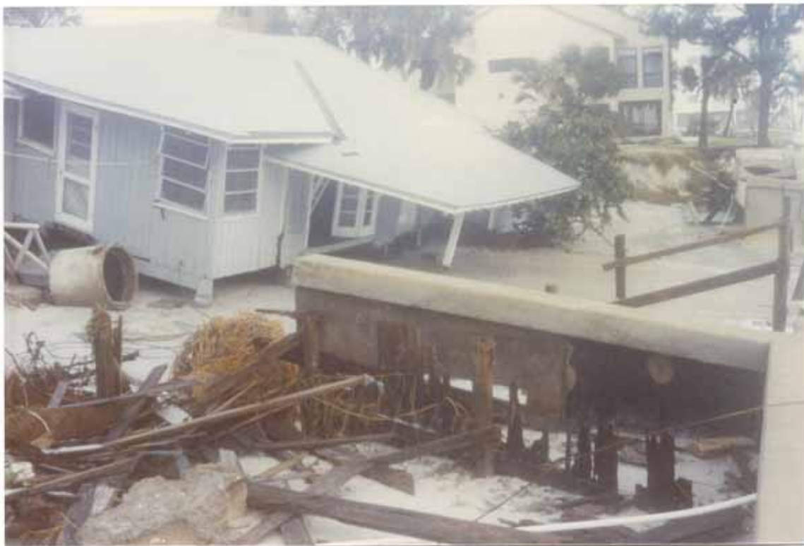
FIGURE 150. Sarasota County dwelling destroyed by Elena (S. West)