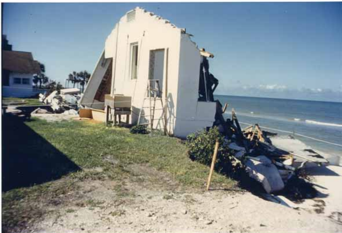
FIGURE 81. Dwellings destroyed at 17th Avenue