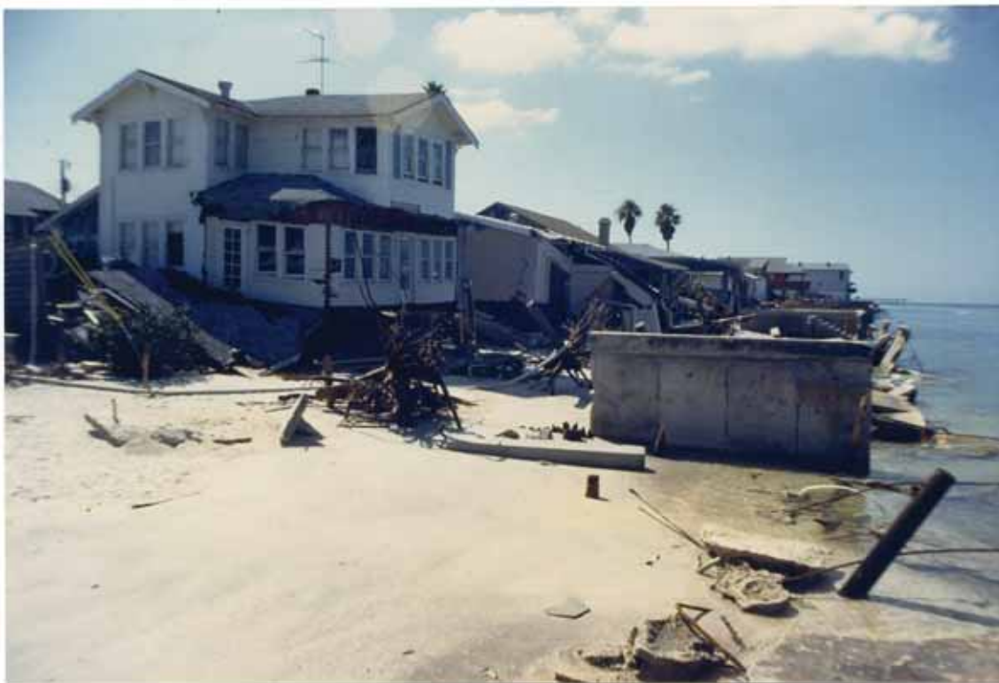
FIGURE 92. Elena destroyed 8th Avenue