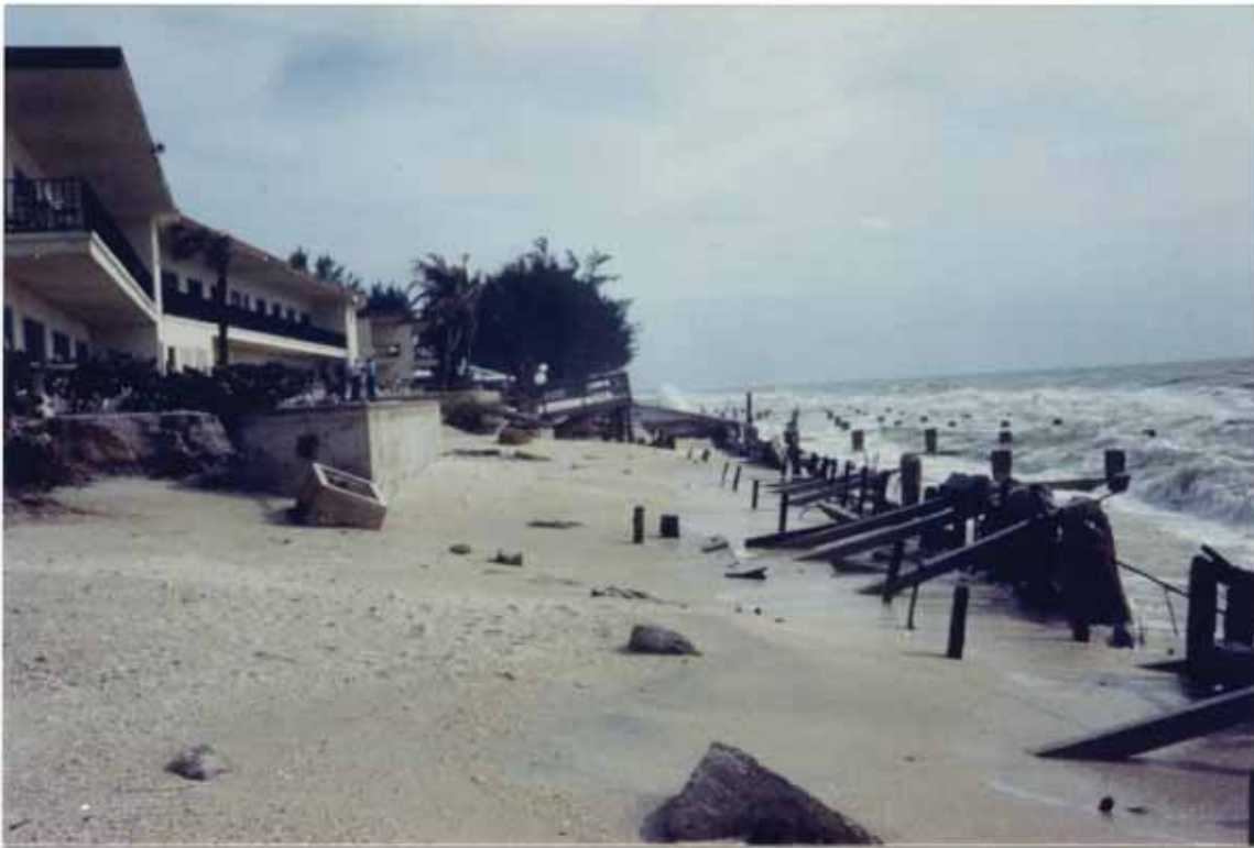
FIGURE 149. Seahorse Condominium bulkhead destroyed by both storms (S. West)