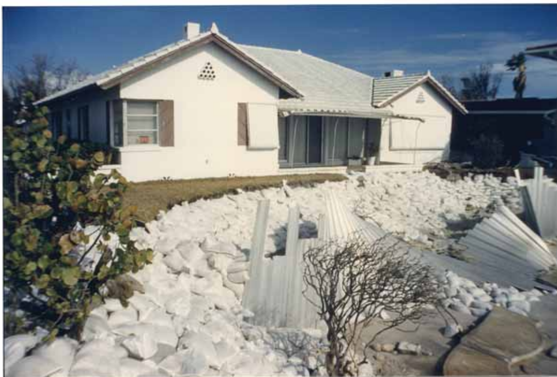
FIGURE 118. Emergency protection after Juan