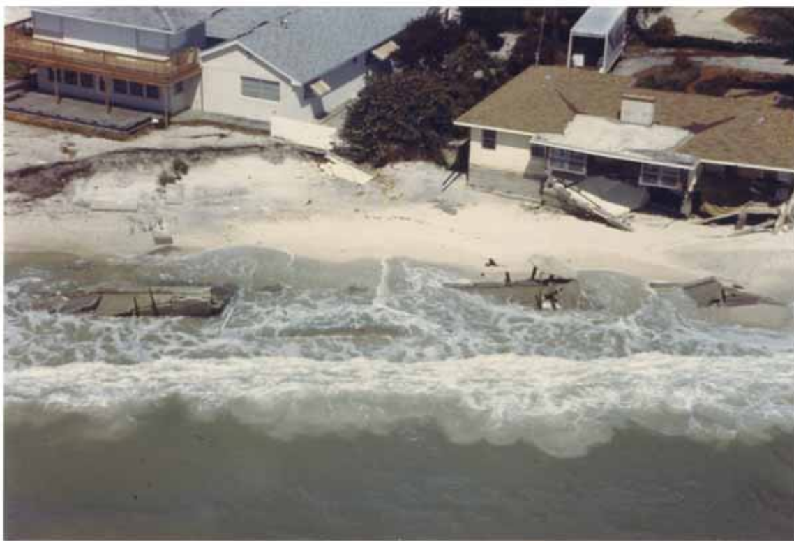
FIGURE 128. Dwelling damaged by Elena