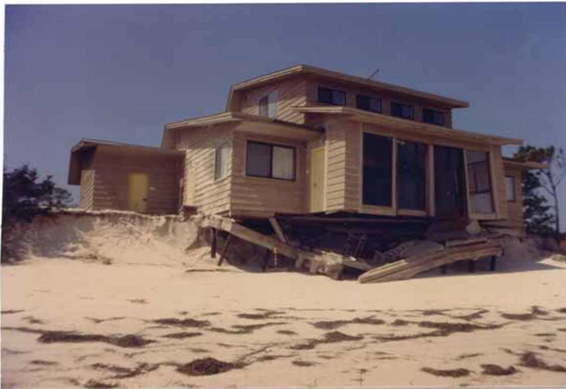
FIGURE 42. Lighthouse Point dwelling damaged by Elena's erosion