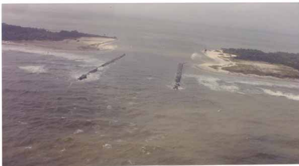
FIGURE 7. St. George Island Channel, September 2, 1985