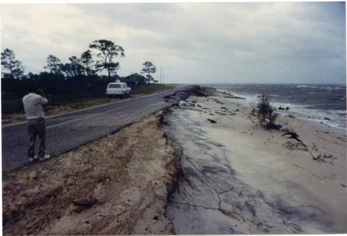
FIGURE 44. Lighthouse Point road damaged on August 30