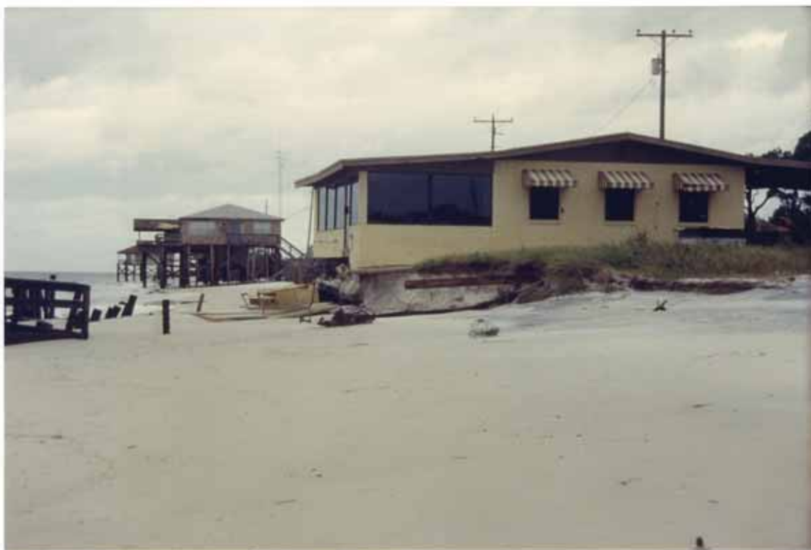
FIGURE 34. Wood bulkhead destroyed and dwelling undermined on August 30 (H. N. Bean)