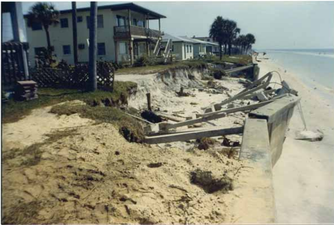
FIGURE 74. Elena damaged 23rd Avenue