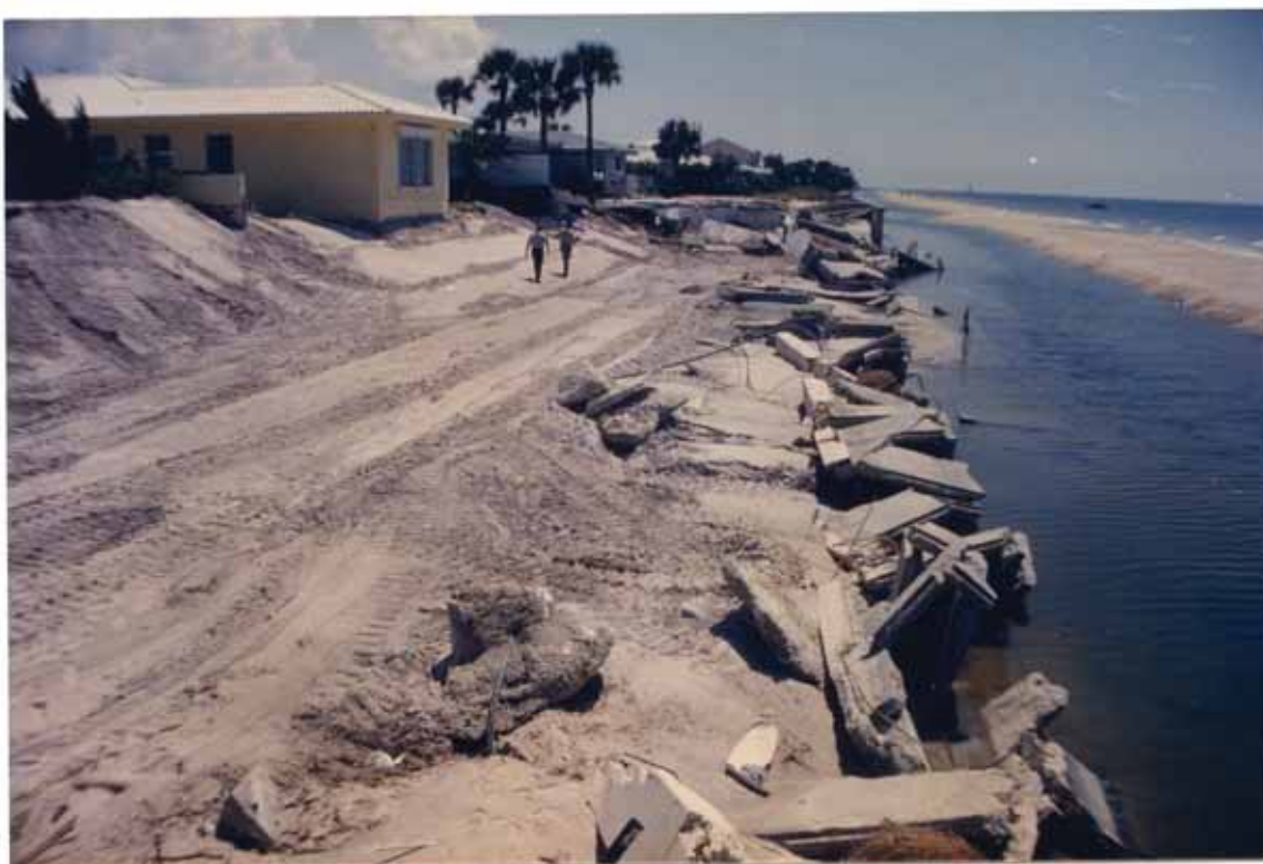
FIGURE 64. Concrete bulkhead destroyed, 650 feet