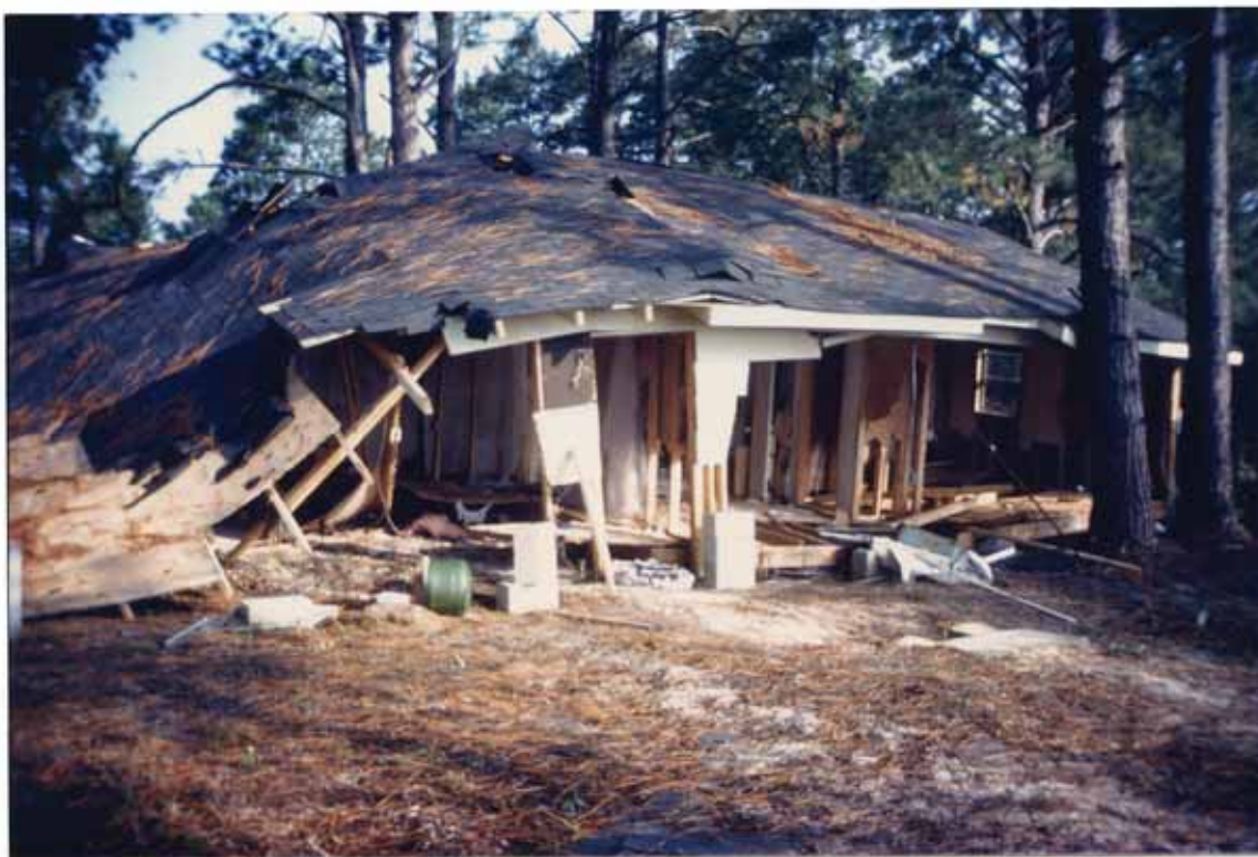
FIGURE 22. Lanark dwelling destroyed by Elena