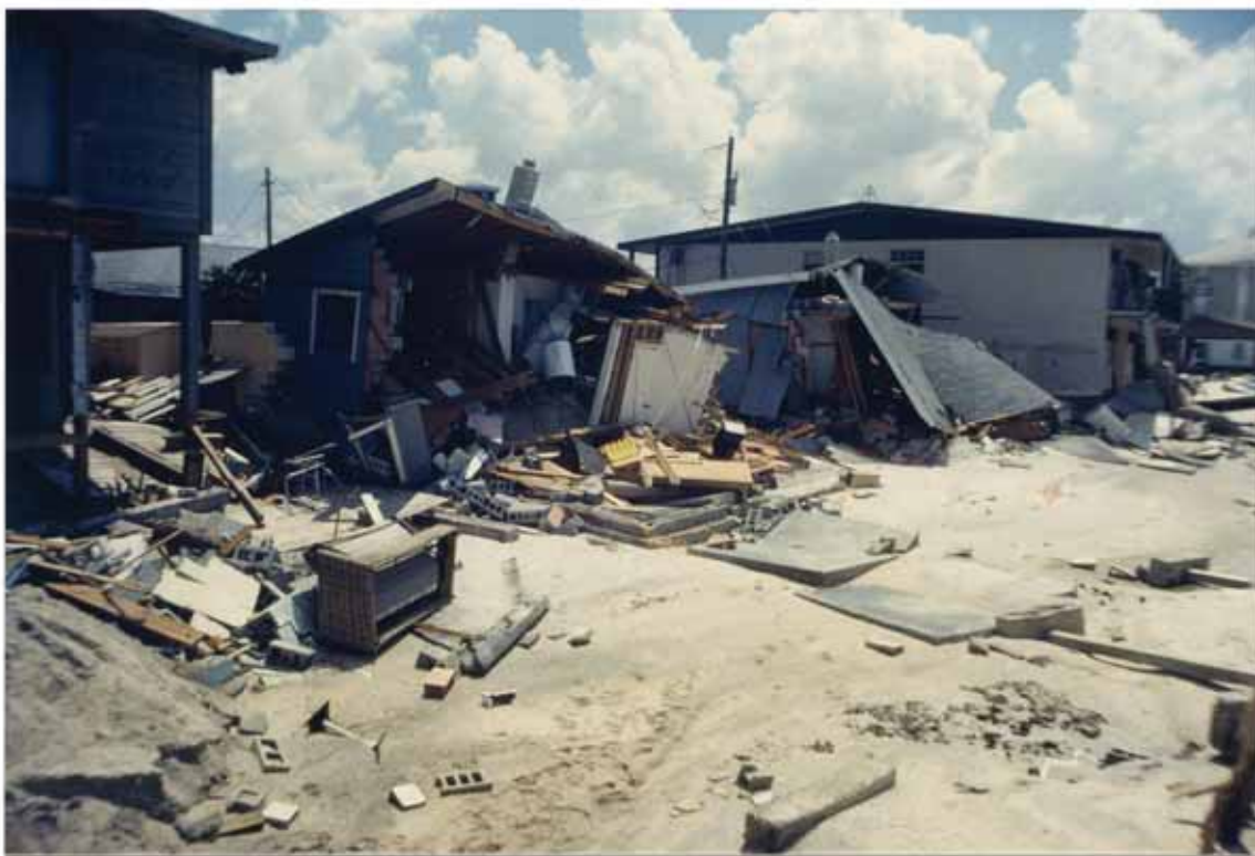
FIGURE 56. Belleair Beach dwellings destroyed by Elena