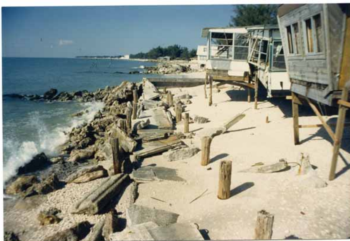
FIGURE 134. Bulkhead with toe-scour protection destroyed