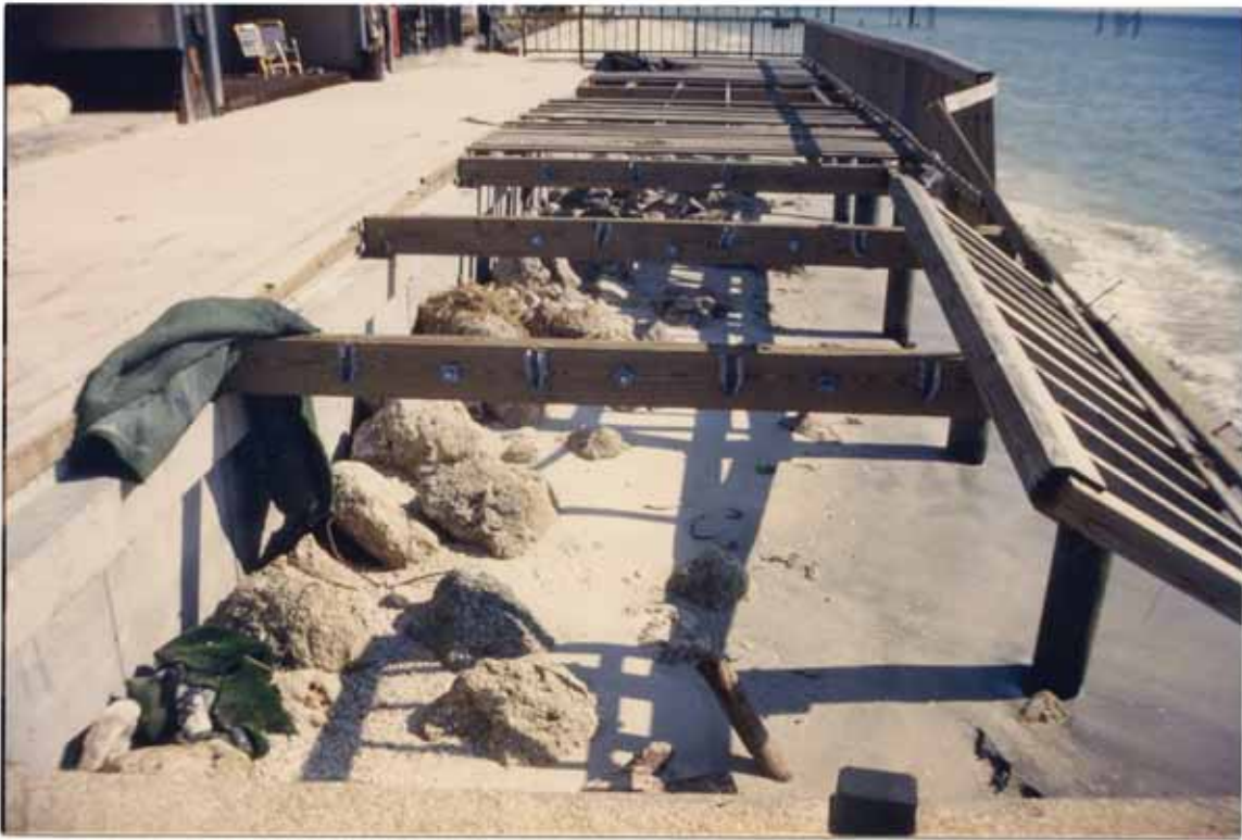
FIGURE 99. Toe-scour protection after Elena, 50 Gulfside Condominium