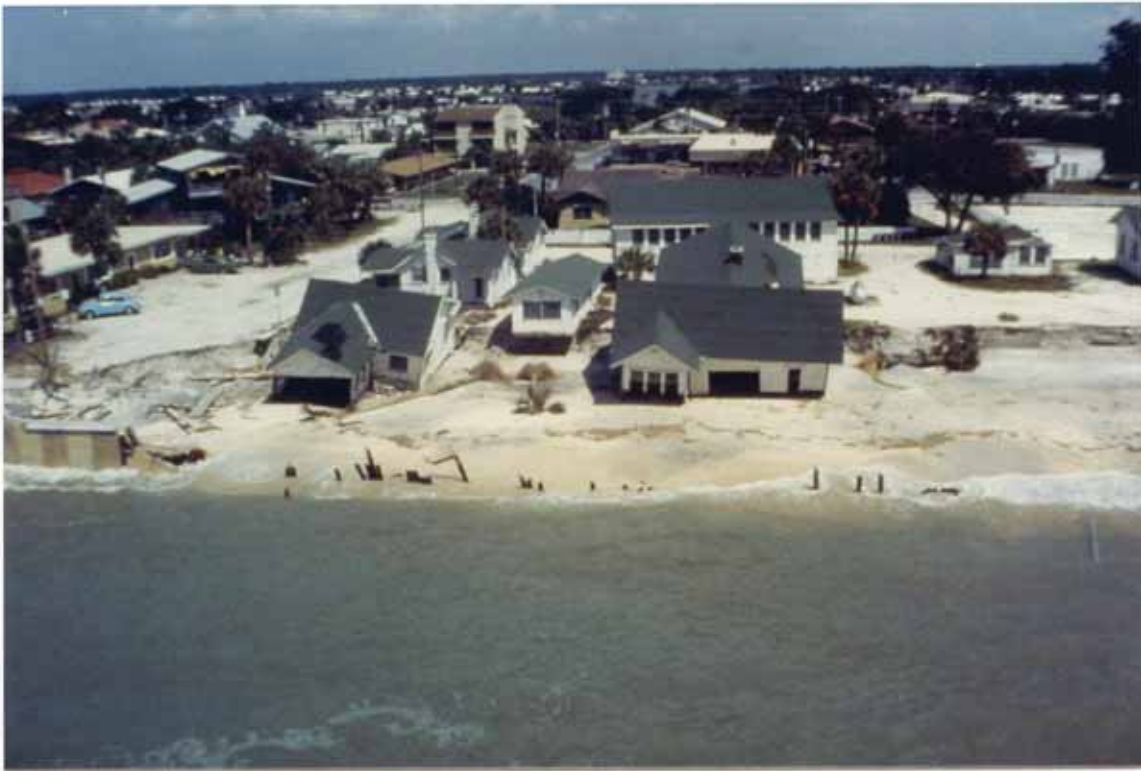
FIGURE 82. Wall, dwellings and property destroyed, 16th Avenue