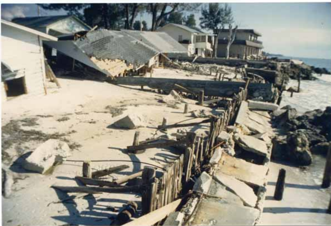
FIGURE 139. Bulkheads destroyed by wave loads