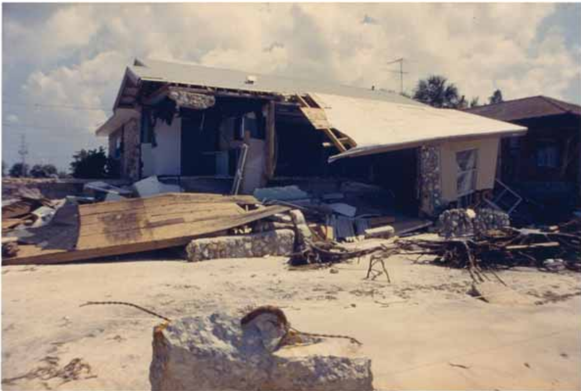
FIGURE 85. Dwelling damaged by Elena