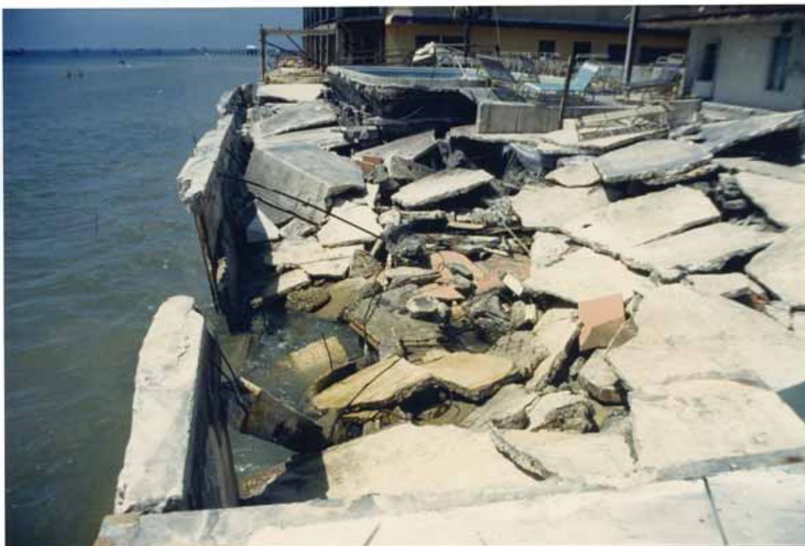
FIGURE 119. Flagship property damage after Elena