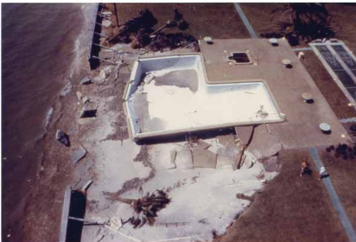
FIGURE 115. Wall and pool destroyed, Shore Mariner Condominium