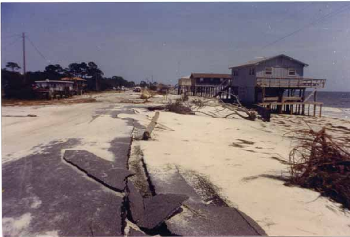
FIGURE 32. Elena erosion and damage