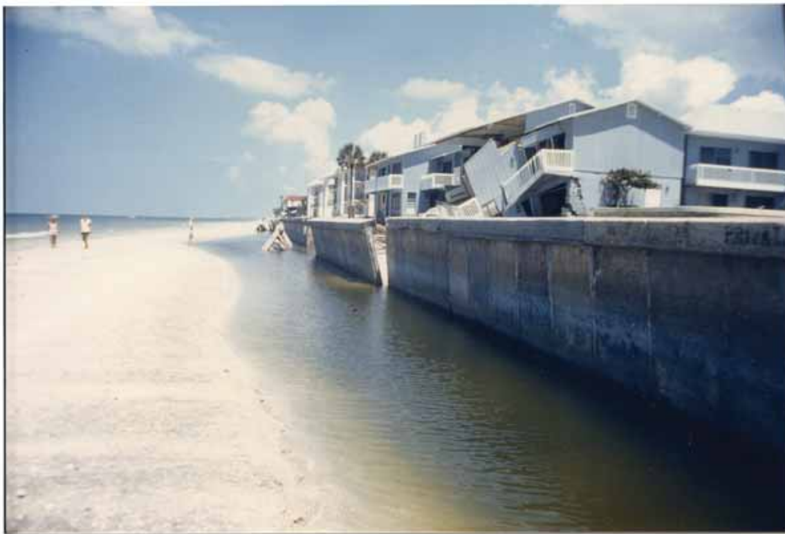
FIGURE 60. Bulkhead damage, La Casa de los Caracoles, Belleair Beach