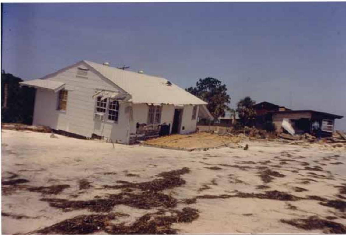
FIGURE 39. Frame dwelling damaged on September 1