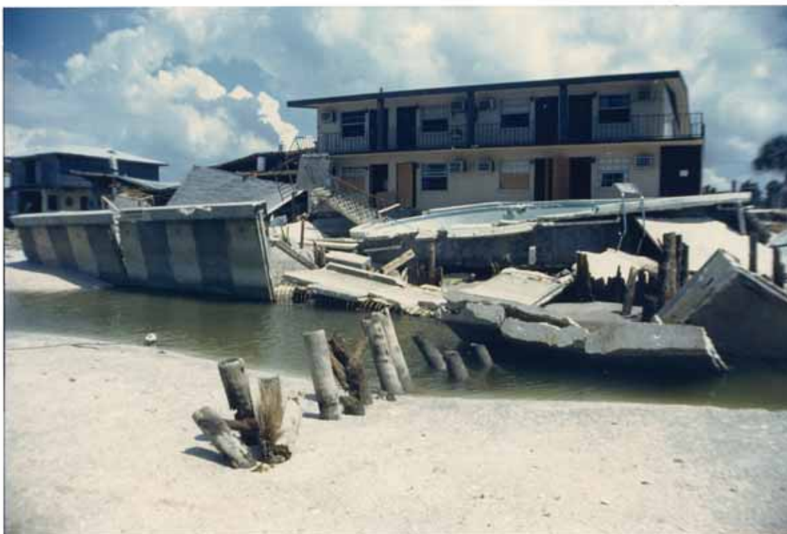
FIGURE 57. Bulkhead and swimming pool destroyed Chateau Motel, Belleair Beach