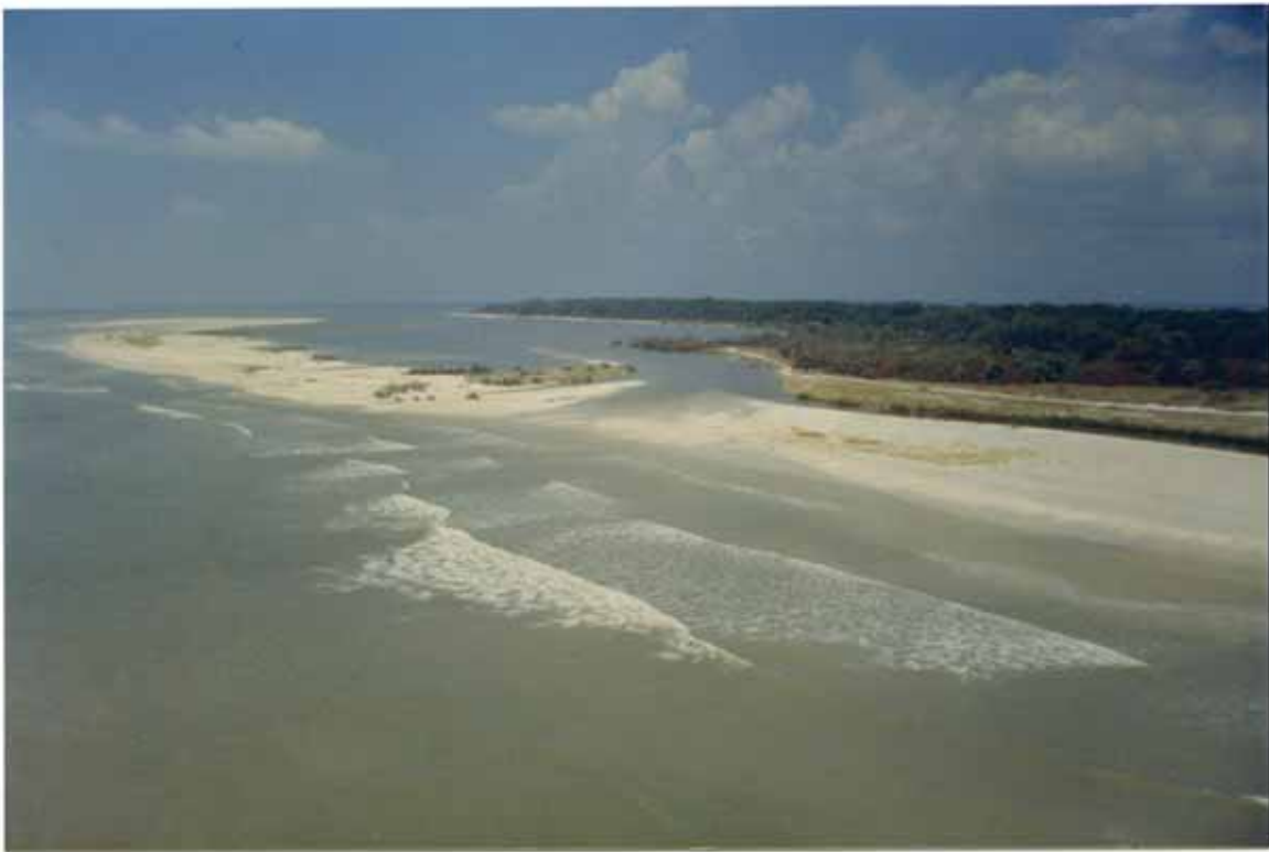
FIGURE 48. Inlet breach on Honeymoon Island