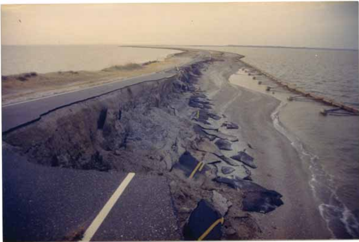
FIGURE 15. St. George Island causeway damaged by Elena's waves