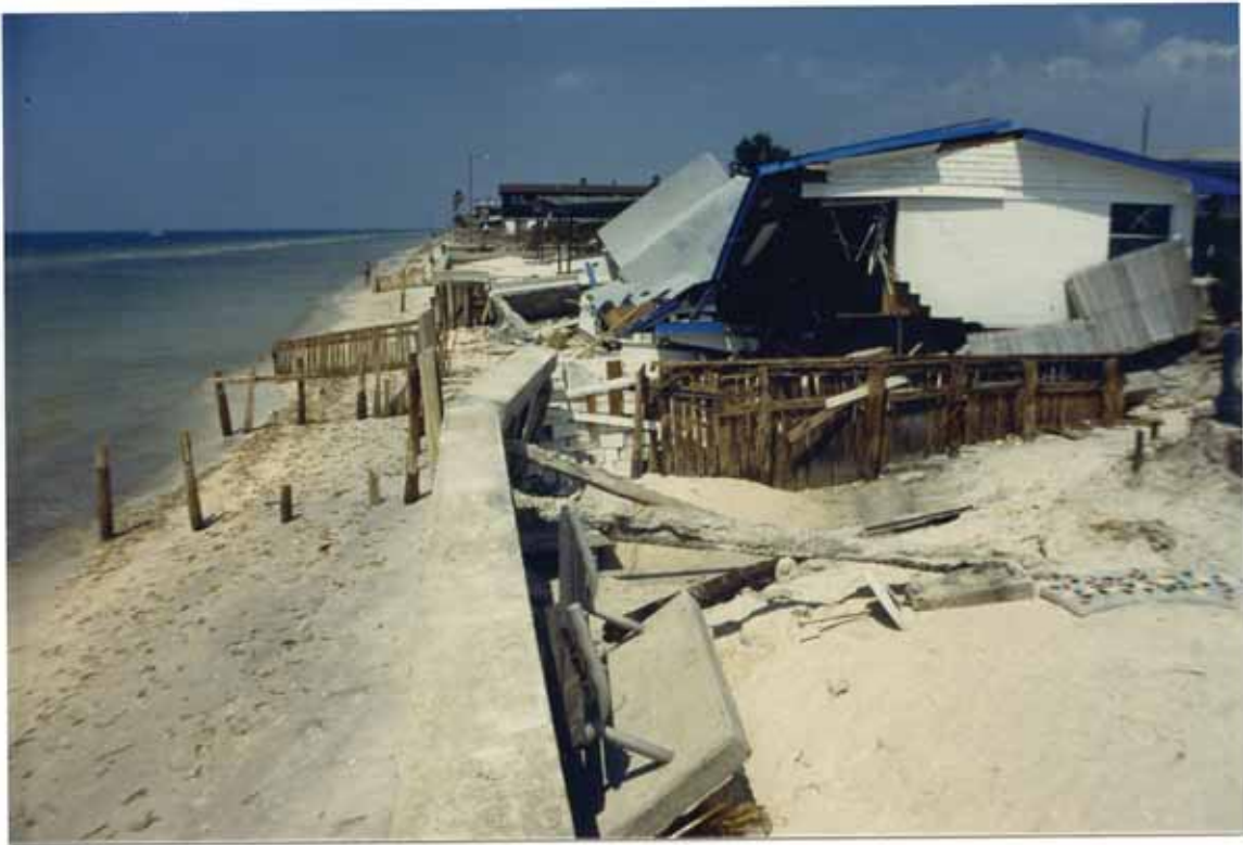
FIGURE 78. Elena destroyed 18th Avenue dwellings