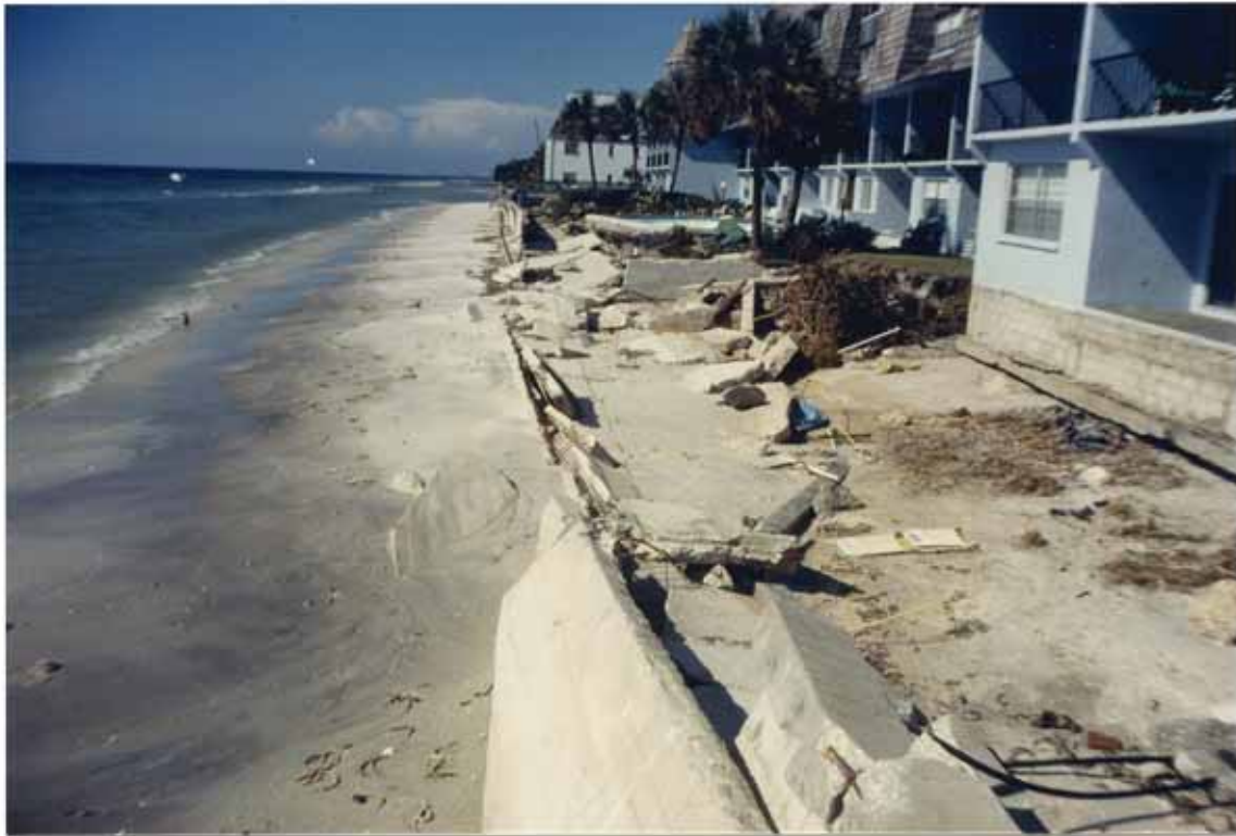
FIGURE 97. Happy Fiddler Condominium bulkhead after Elena