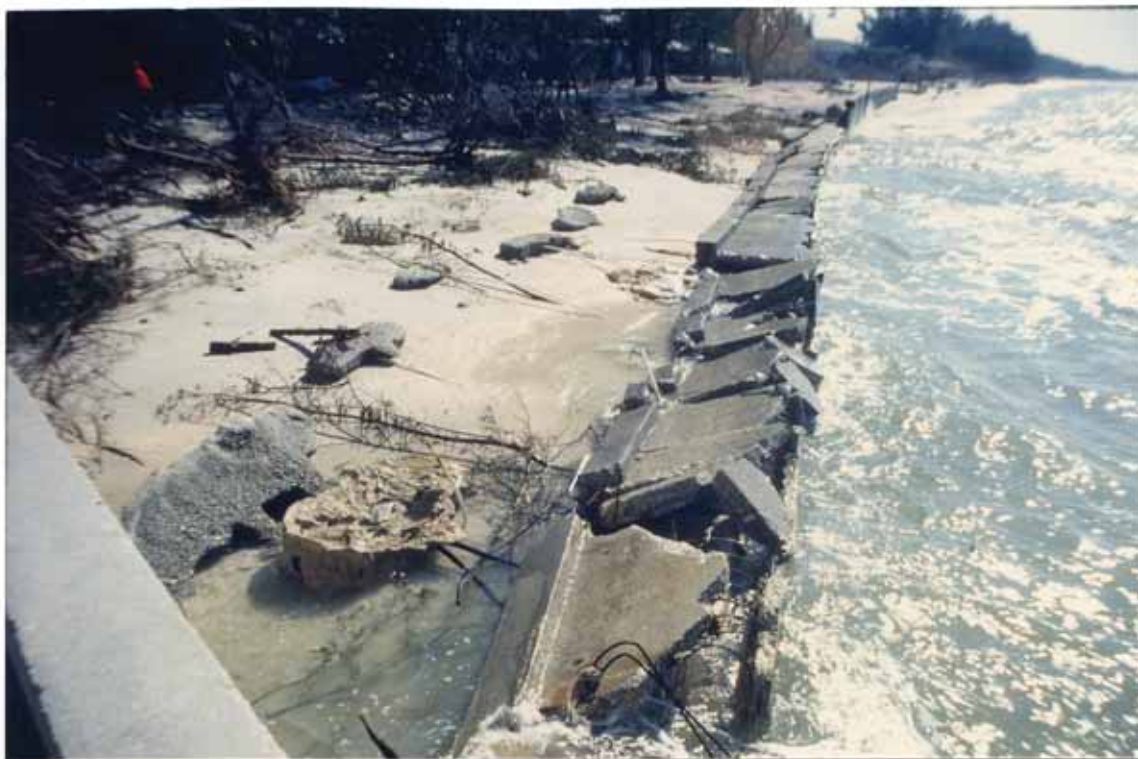
FIGURE 127. Elena and Juan destroyed 920 feet of bulkhead