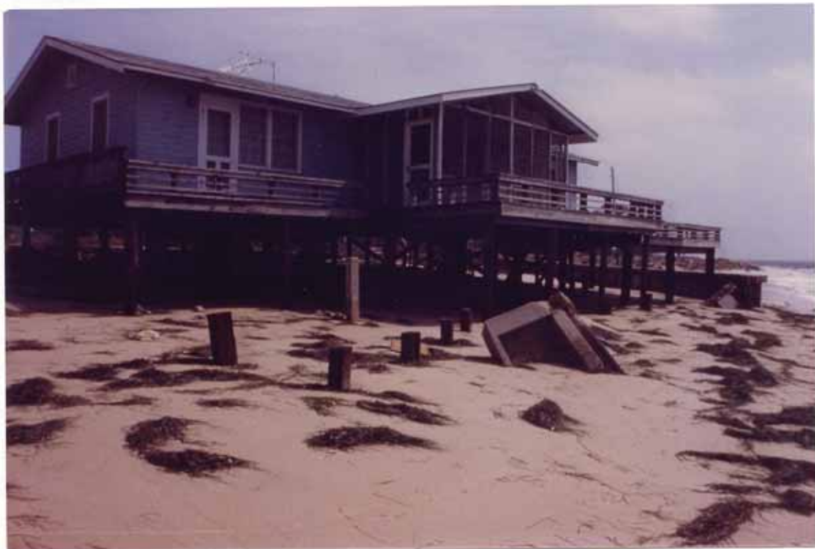
FIGURE 29. Southwest Cape bulkhead destroyed by Elena's waves