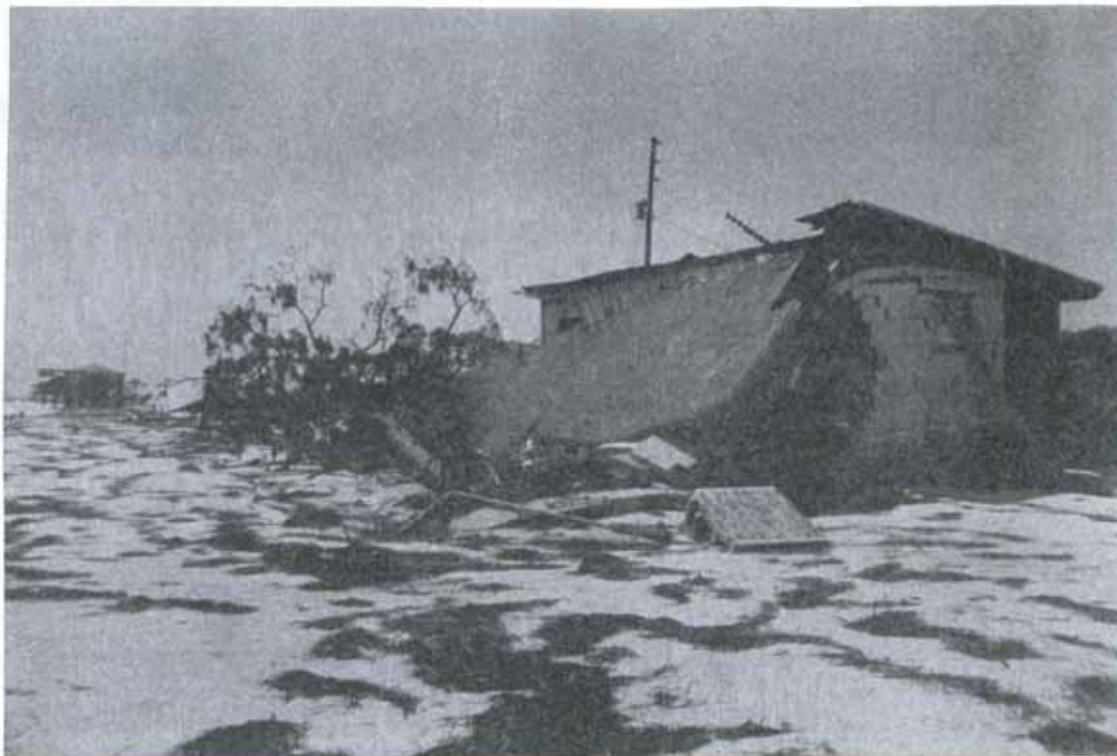
FIGURE 37. Concrete block dwelling destroyed on September 1