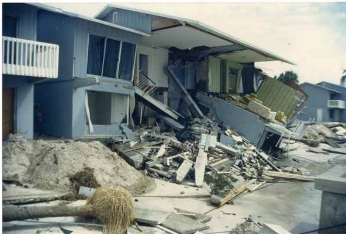
FIGURE 61. Two-unit building destroyed by Elena's waves