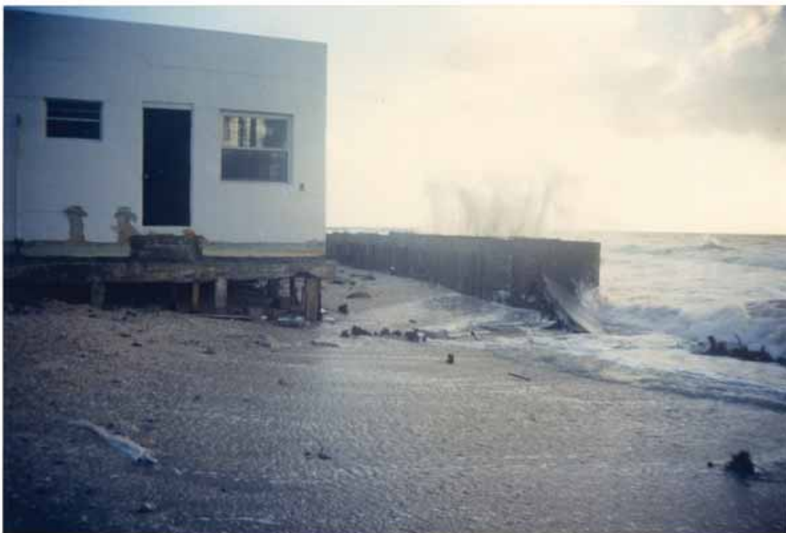
FIGURE 110. New bulkhead damaged without toe-scour protection