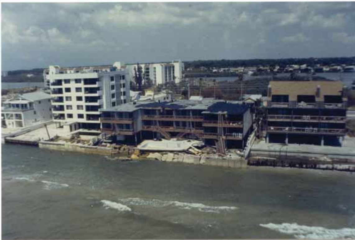
FIGURE 113. Bulkhead destroyed by Elena