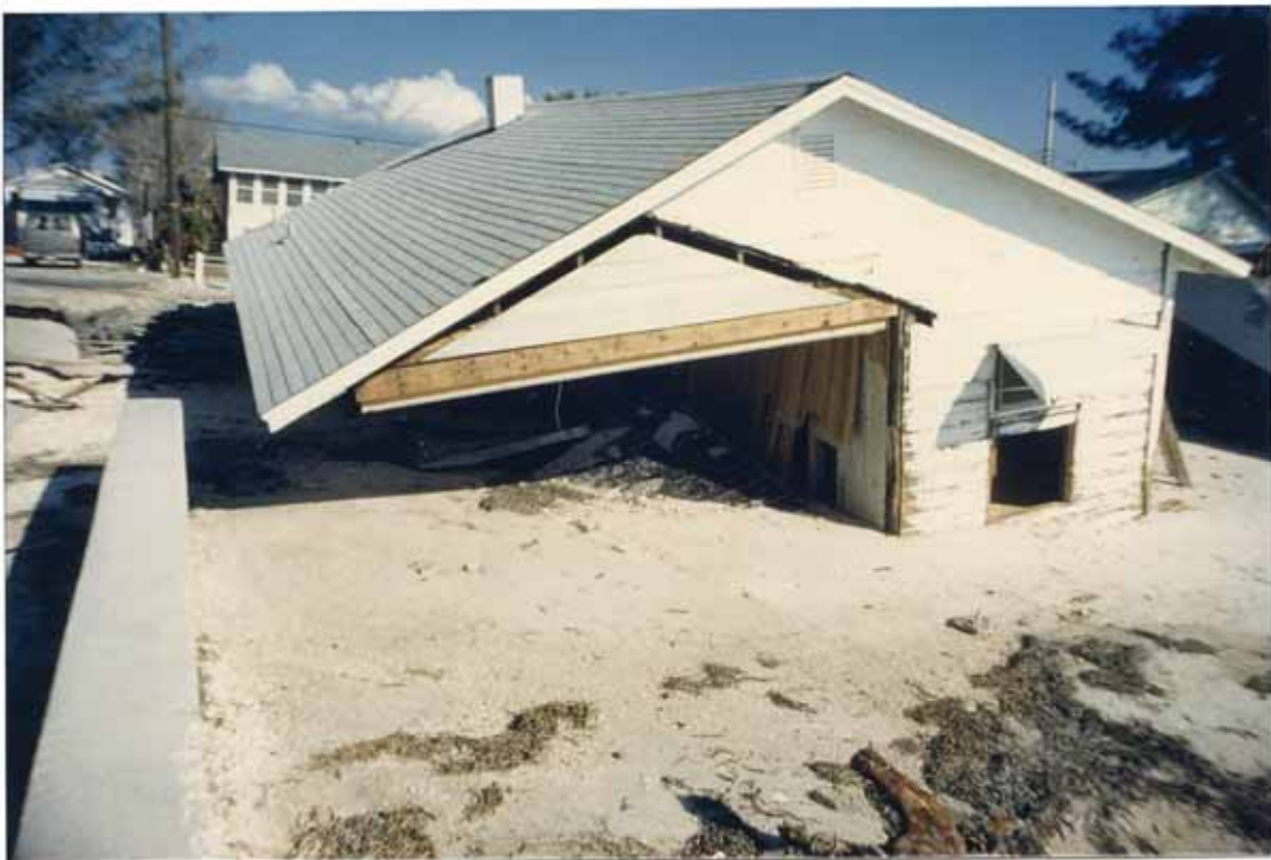
FIGURE 138. Same dwelling destroyed by Juan