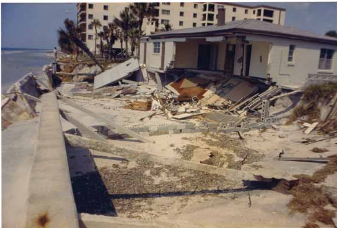
FIGURE 72. Dwelling damaged by Elena