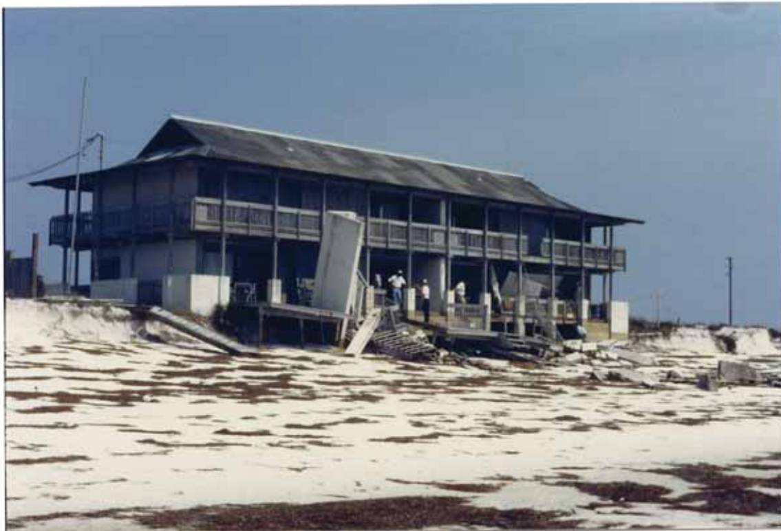
FIGURE 13. Pelican Inn damaged by Elena, Dog Island (G. L. Hill)