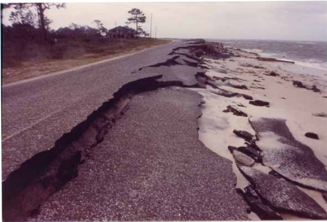
FIGURE 46. Lighthouse Point road damaged on August 30