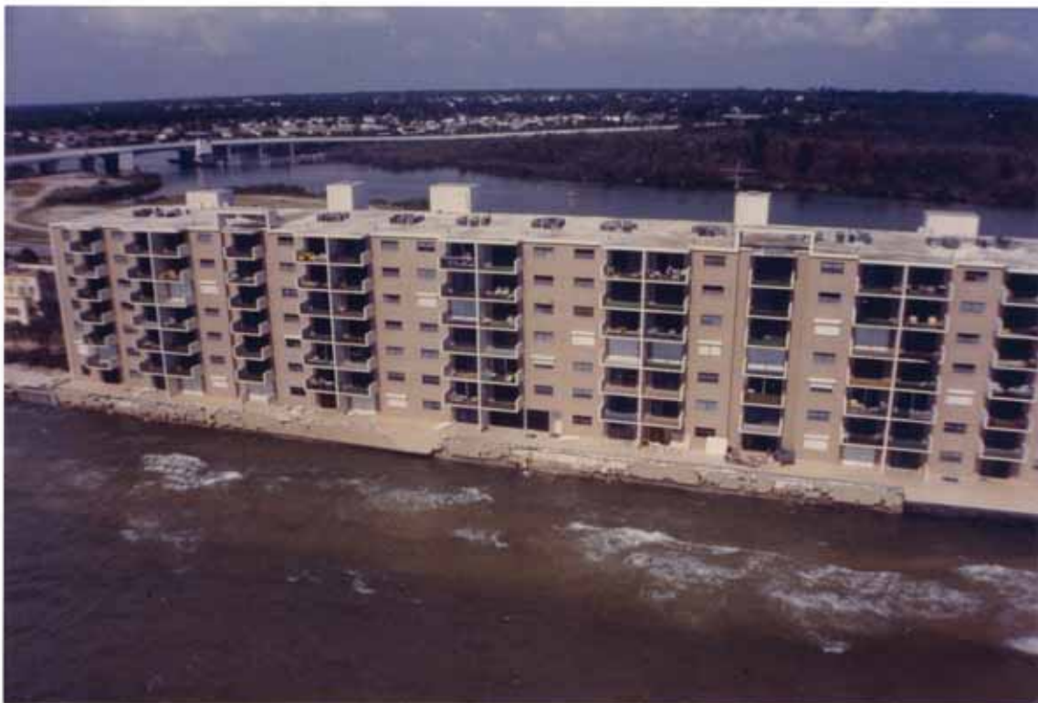
FIGURE 114. Gulf Shores Condominium after Elena