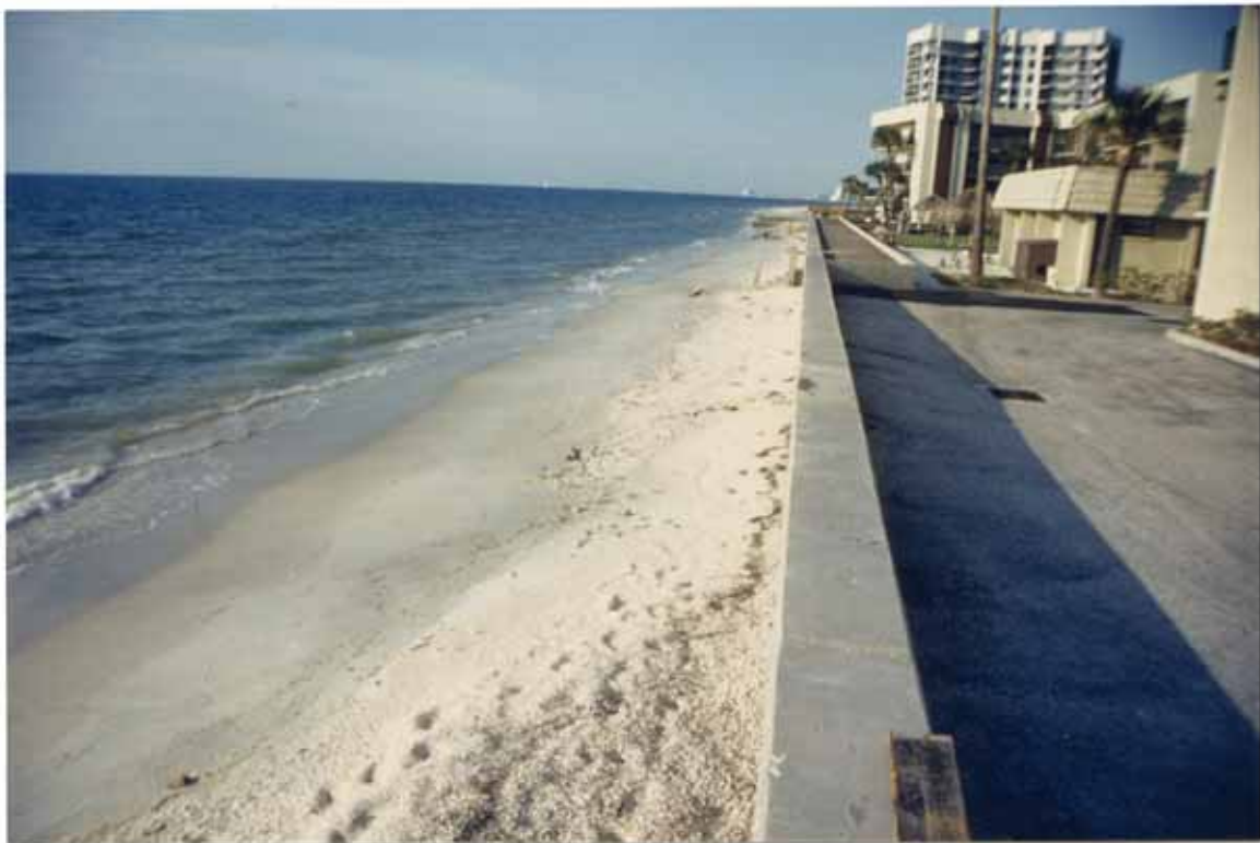
FIGURE 53. Post-Elena beach recovery after one month