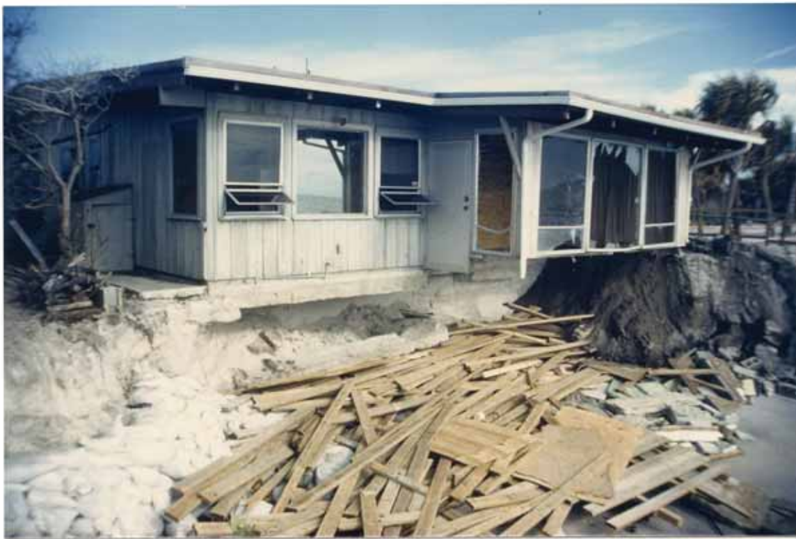
FIGURE 117. Redington Shores dwelling damaged by Juan