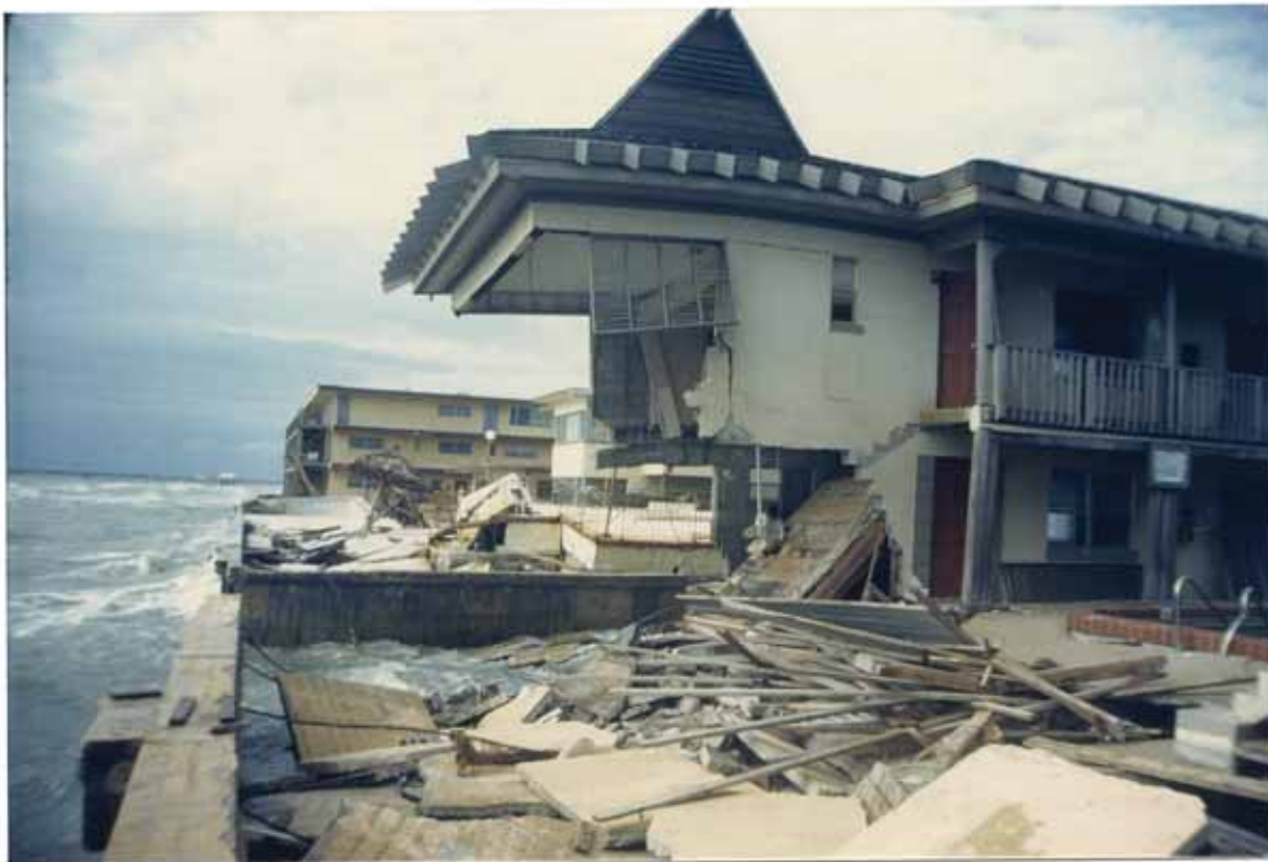
FIGURE 122. The Islander after Juan's additional damage