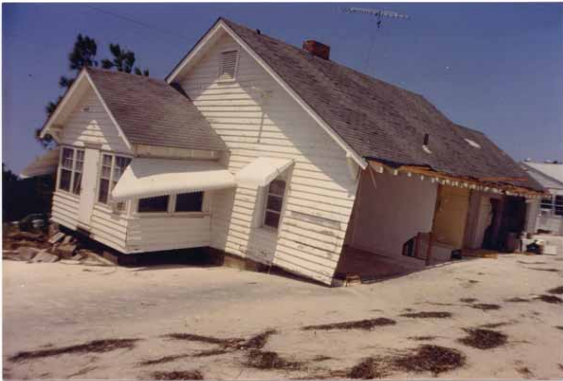
FIGURE 38. Frame dwelling substantially damaged on September 1