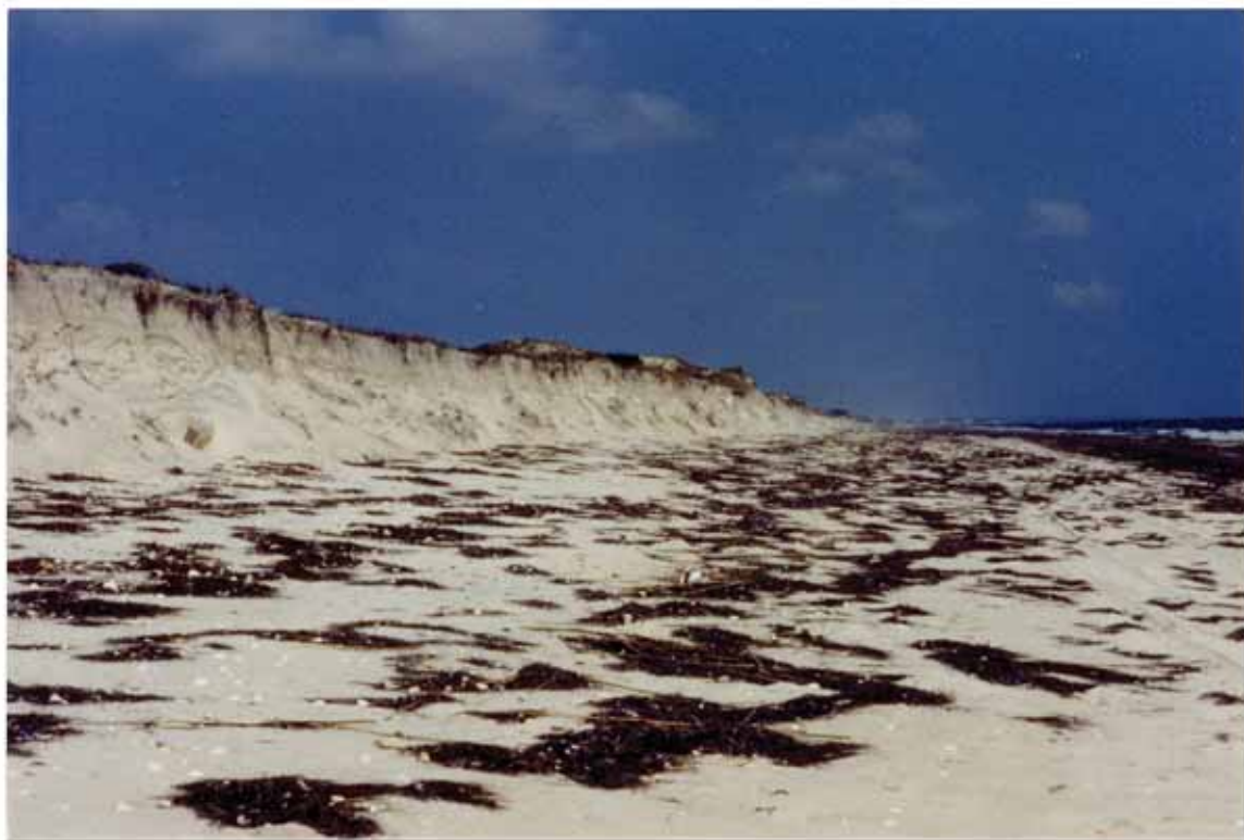
FIGURE 9. Dunes eroded by Elena, St. George Island