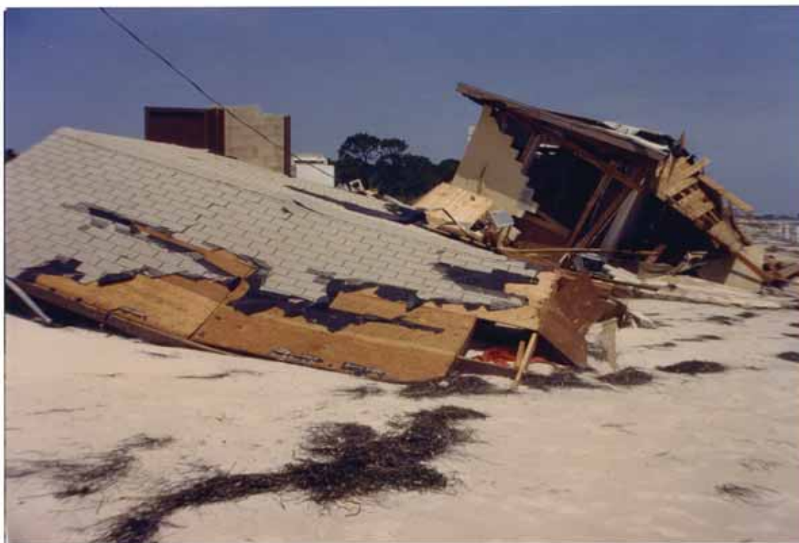
FIGURE 35. Same dwelling destroyed by Elena's erosion and waves on September 1