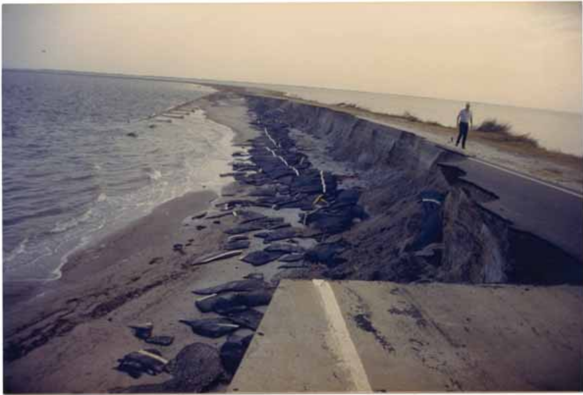
FIGURE 14. St. George Island causeway damaged by Elena's waves