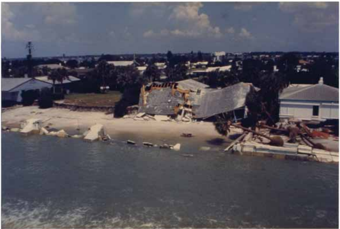
FIGURE 69. Wall and dwelling destroyed