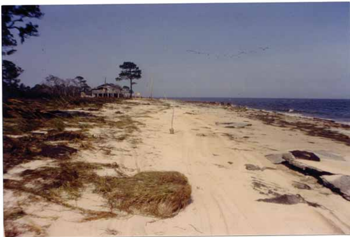
FIGURE 47. Lighthouse Point road destroyed on September 1