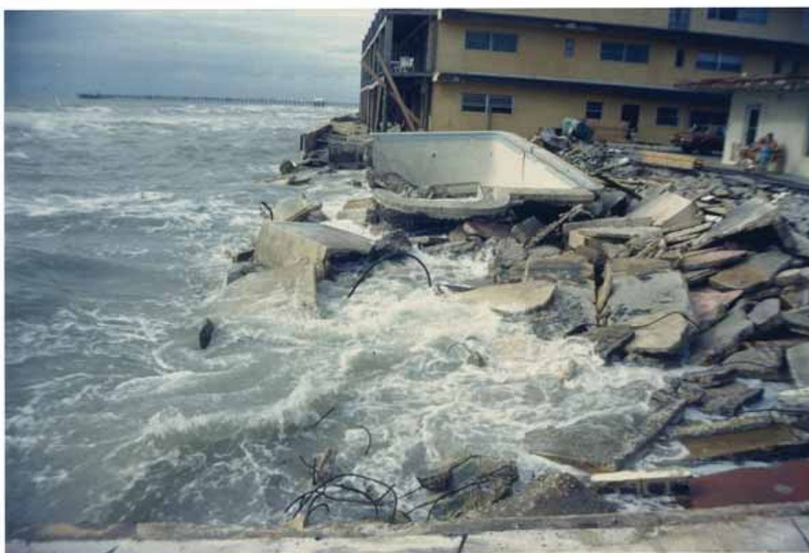
FIGURE 120. Additional damage and pool destroyed by Juan