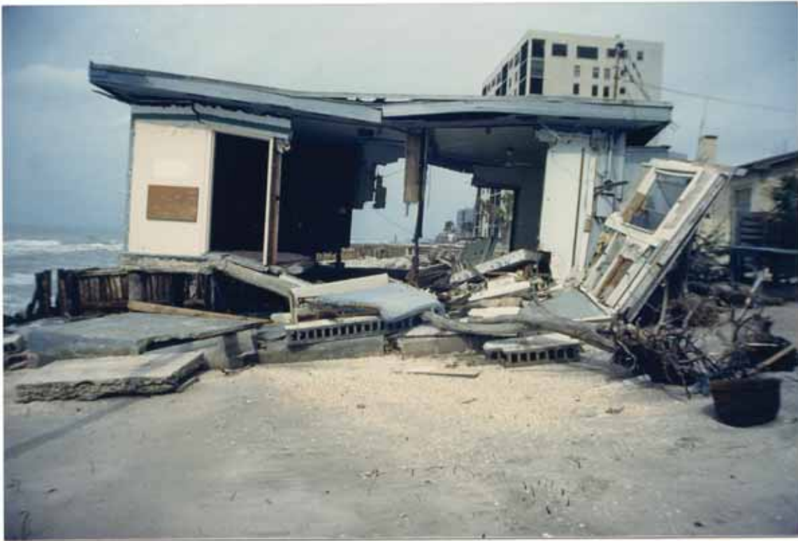
FIGURE 90. Dwelling destroyed by Elena