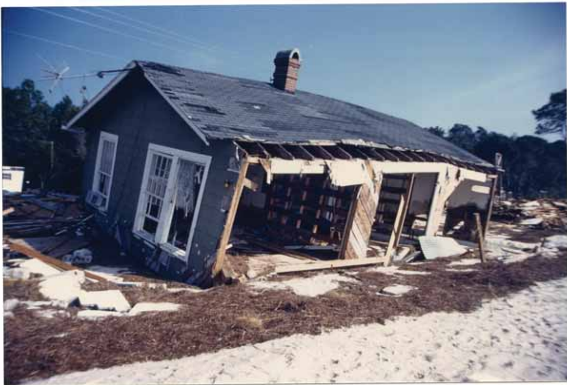
FIGURE 19. Carrabelle Beach dwelling destroyed by Elena