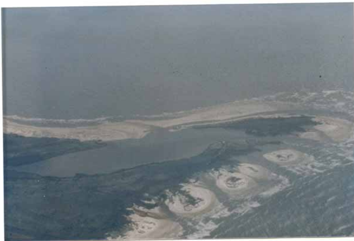
FIGURE 5. Cape San Blas, September 3, 1985