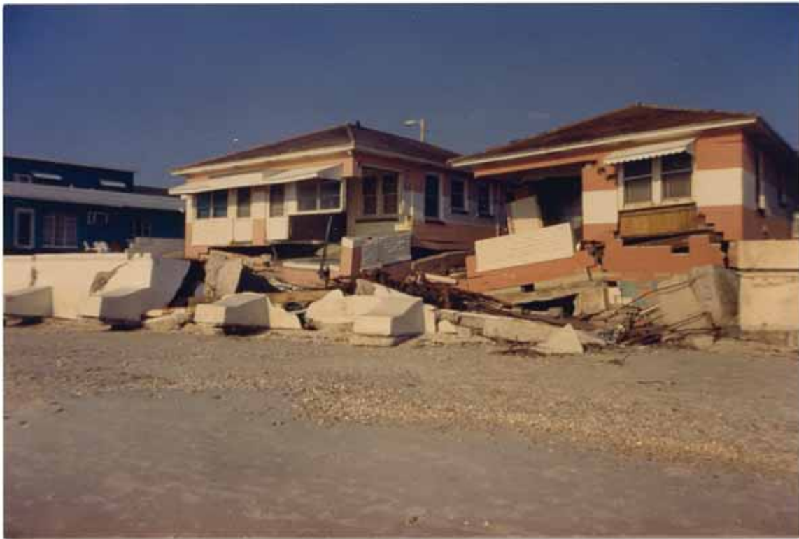
FIGURE 107. Wall destroyed and dwellings damaged