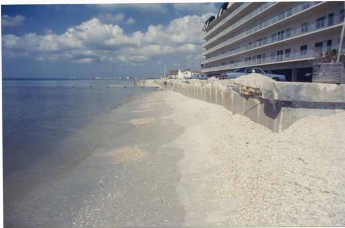
FIGURE 123. Juan damaged Sunset Chateau Condominium's bulkhead, Treasure Island