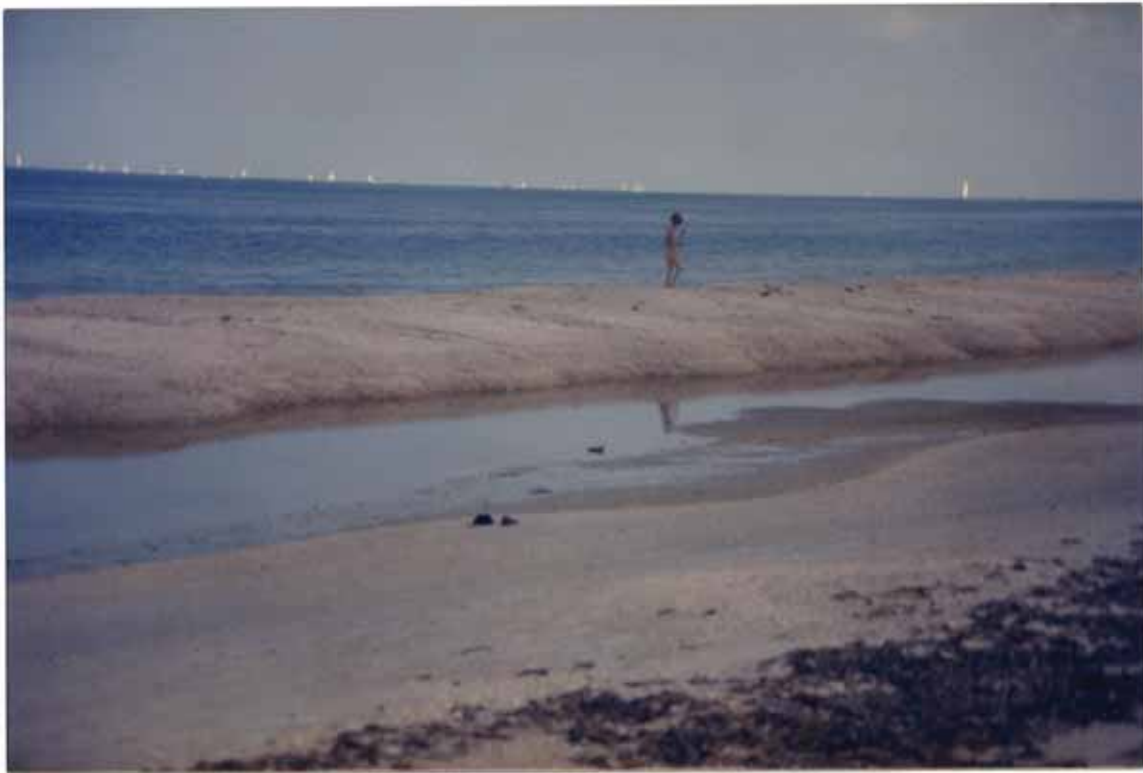
FIGURE 50. Storm beach profile, North Sand Key