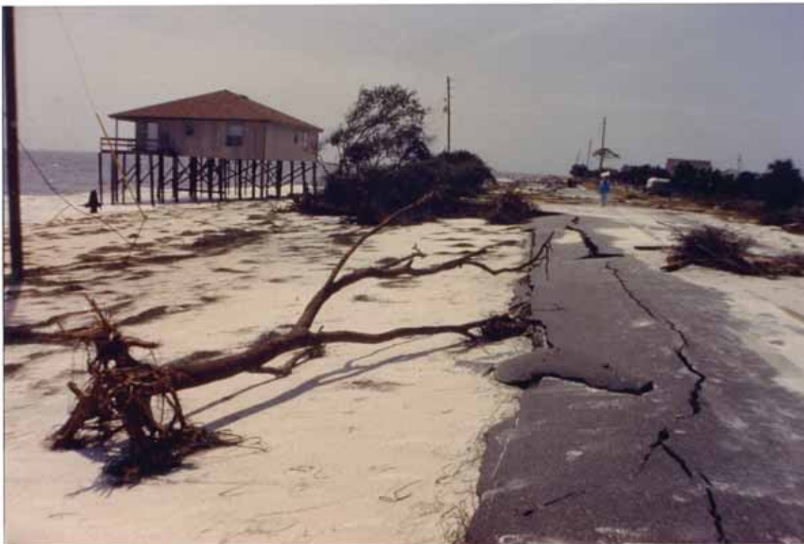
FIGURE 33. Elena erosion and damage