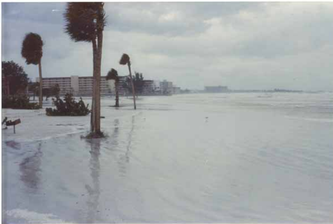
FIGURE 152. Siesta Key flooding during Elena (S. West)