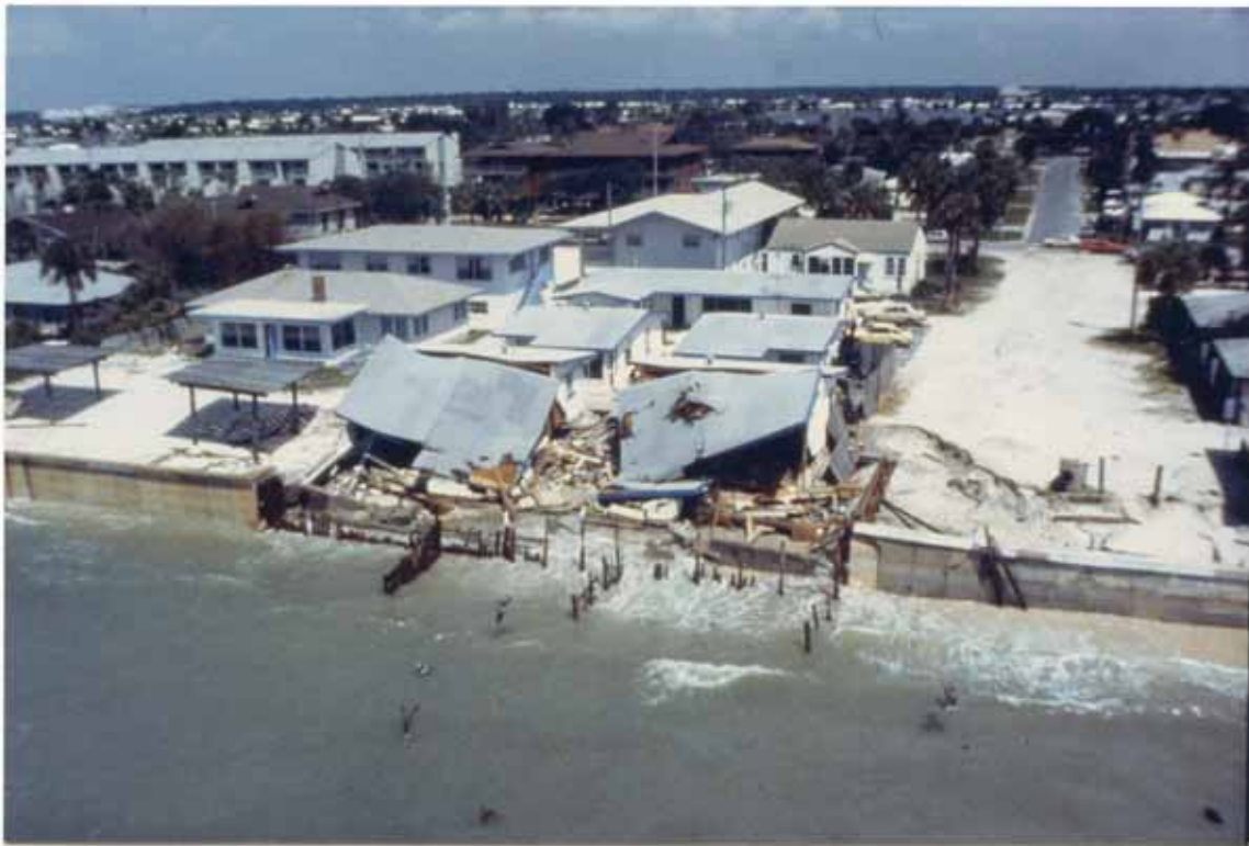
FIGURE 80. Wall and dwellings destroyed by Elena