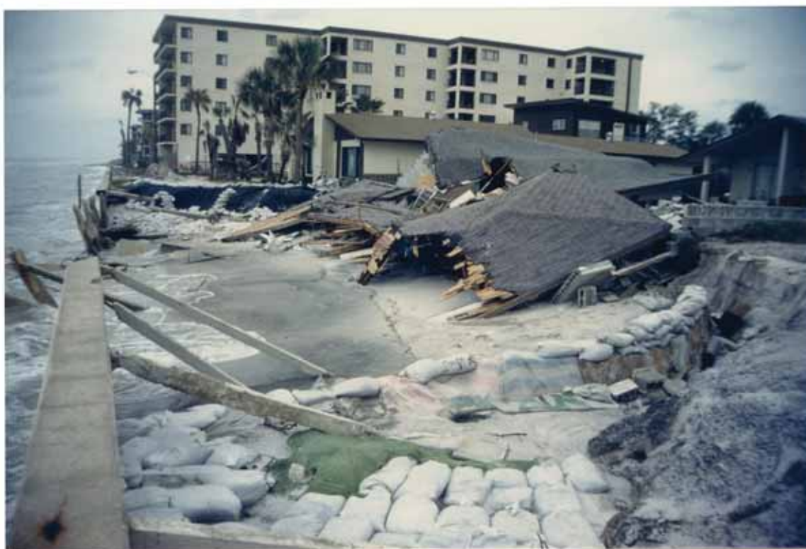
FIGURE 73. Same dwelling destroyed by Juan