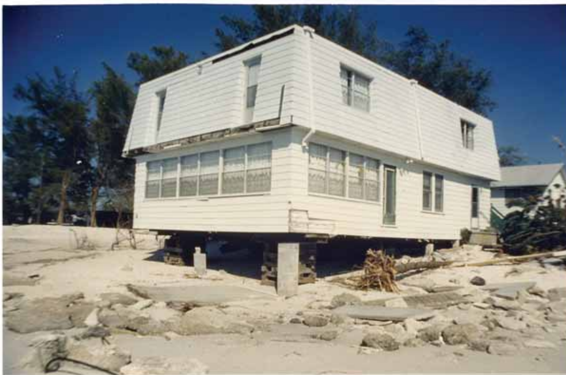
FIGURE 133. Undermined dwelling on temporary supports