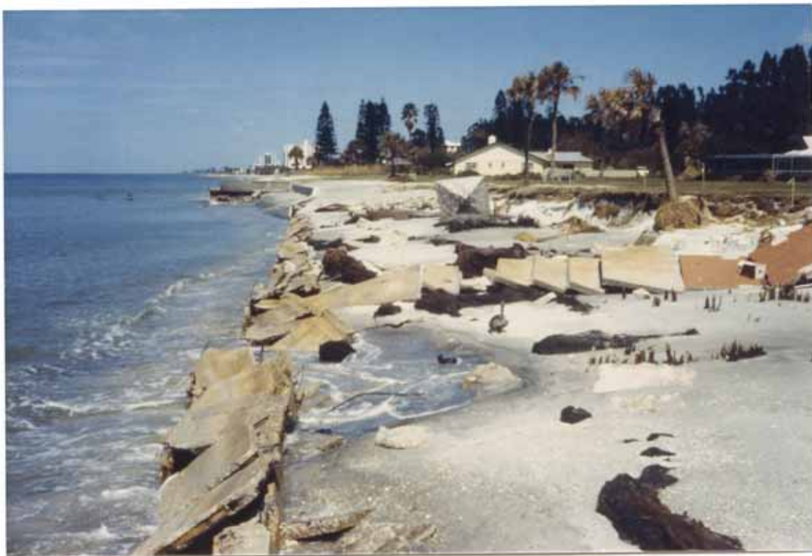
FIGURE 154. Elena destroyed Venice bulkhead (S. West)