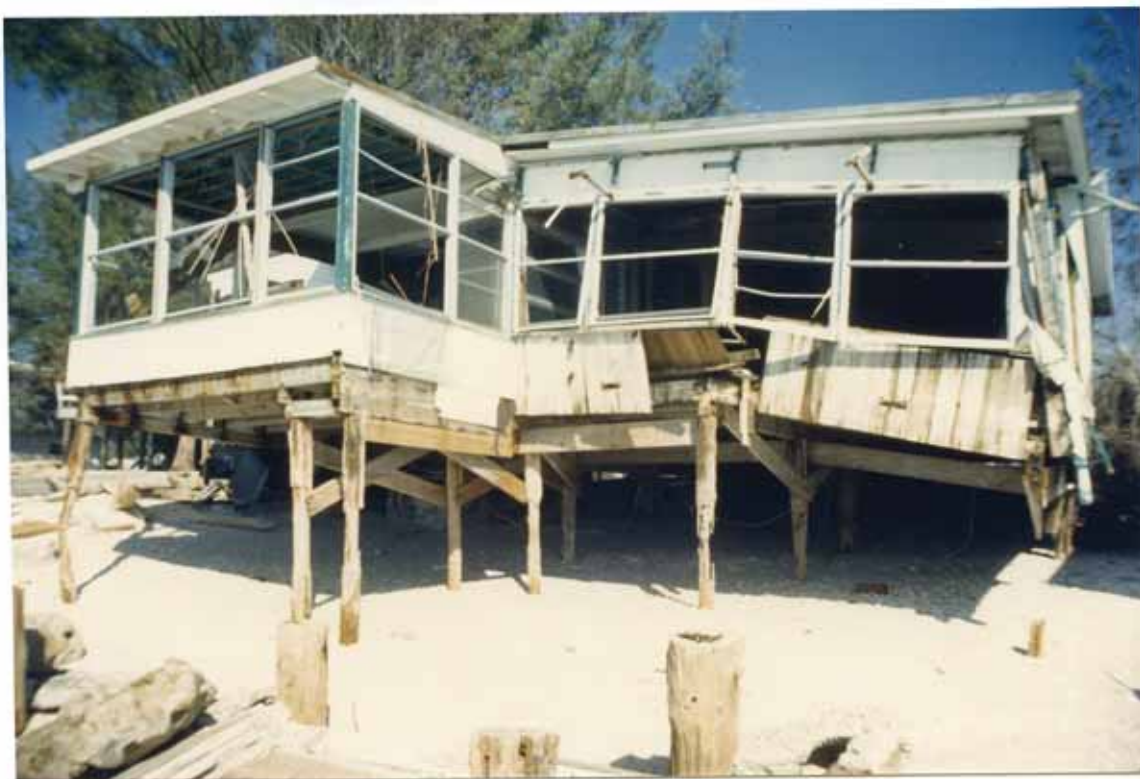
FIGURE 135. Holmes Beach dwelling destroyed by Elena