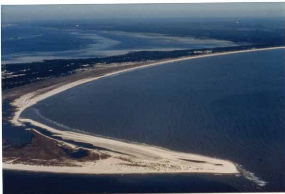
FIGURE 4. Cape San Blas, November, 1984 (K. R. Bodge)