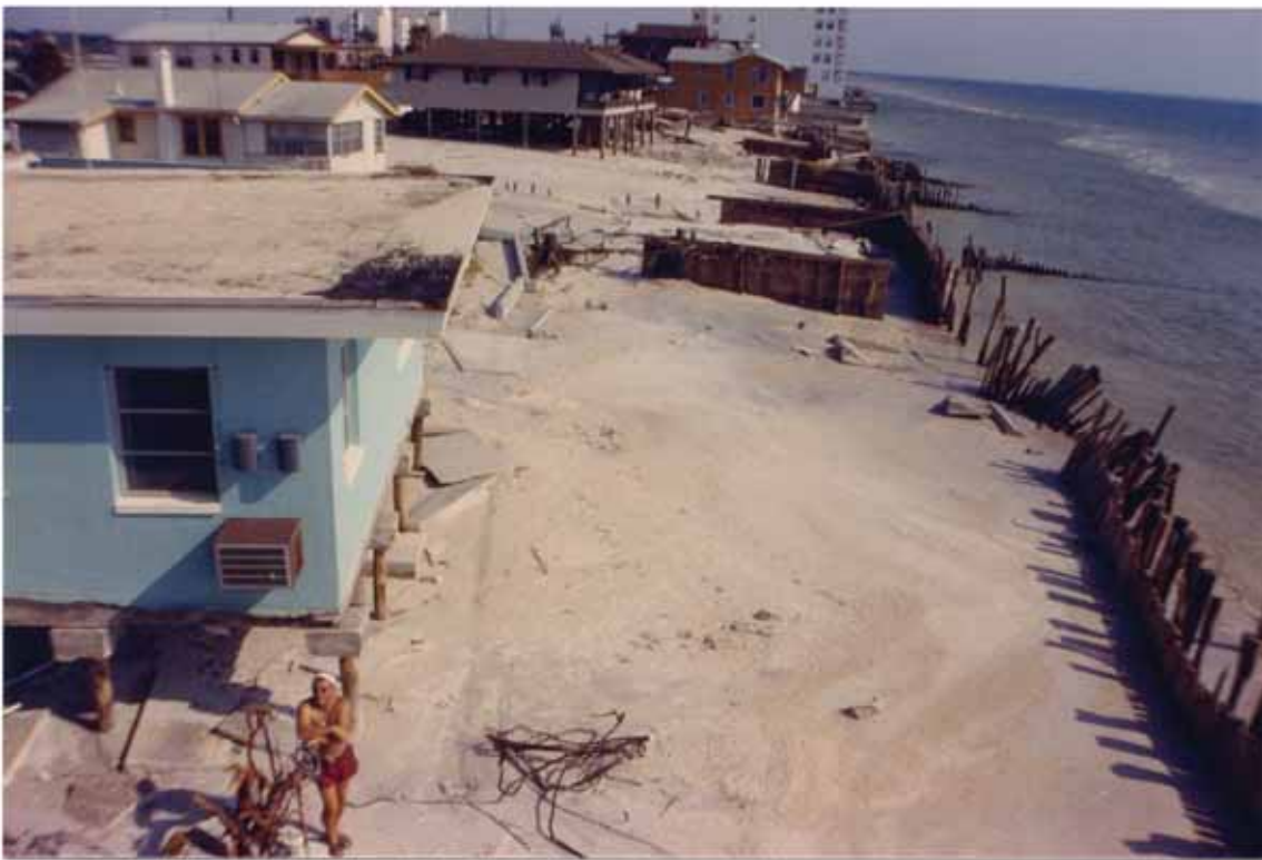
FIGURE 109. Indian Shores bulkheads destroyed, 820 feet