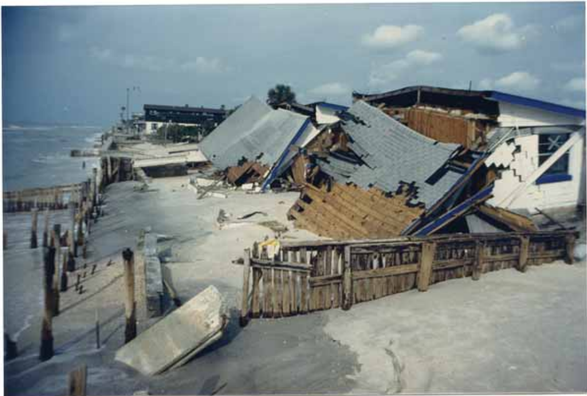
FIGURE 79. Juan's additional damage at 18th Avenue