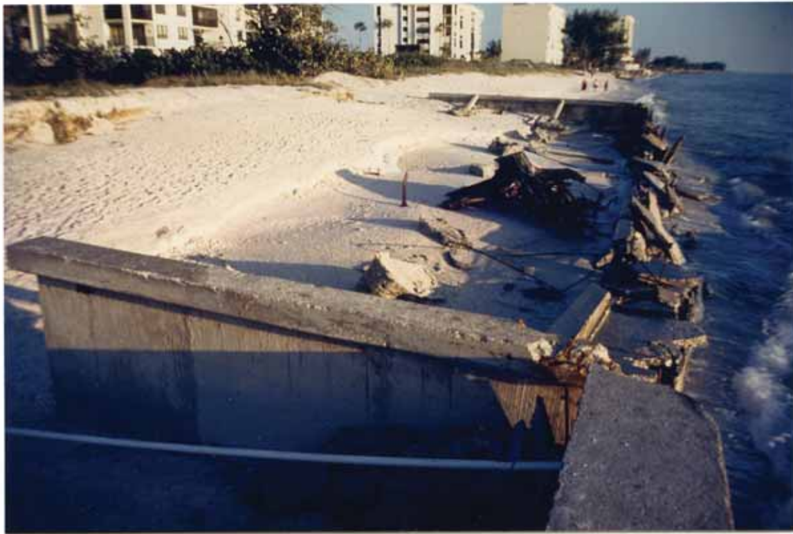
FIGURE 147. Juan destroyed concrete bulkhead