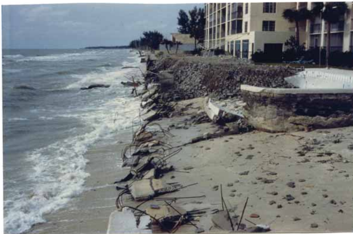
FIGURE 148. Juan destroyed pool and bulkhead, Longboat Harbor Towers (S. West)