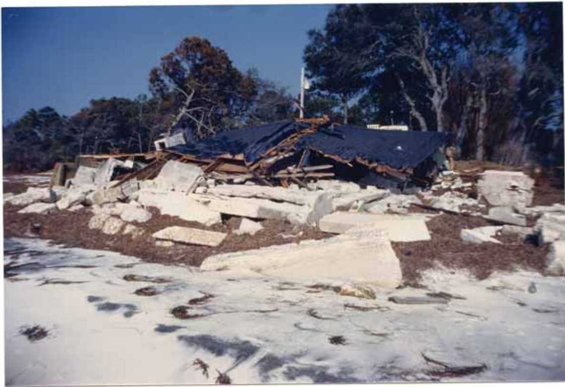
FIGURE 20. Carrabelle Beach dwelling destroyed by Elena