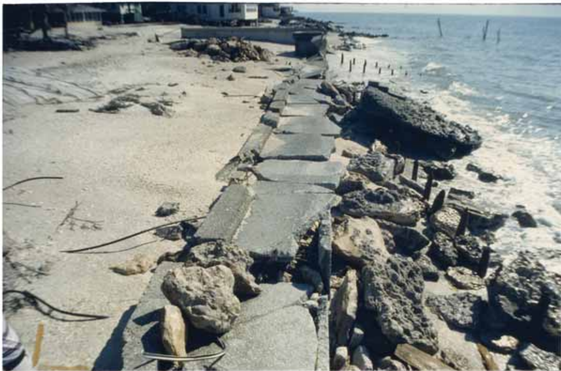
FIGURE 132. Bulkhead destroyed by wave impact loads