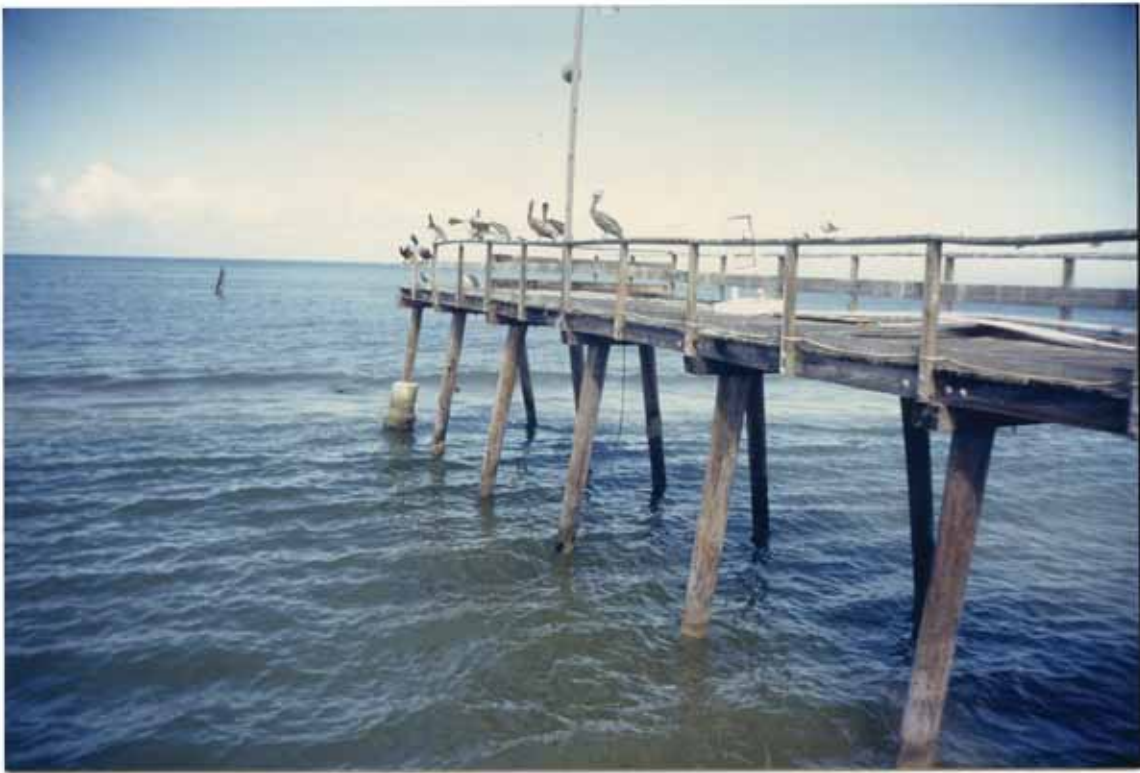
FIGURE 88. Big Indian Rocks Fishing Pier destroyed