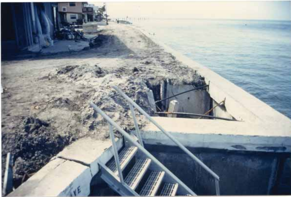
FIGURE 94. Post-Elena fill at 7th Avenue