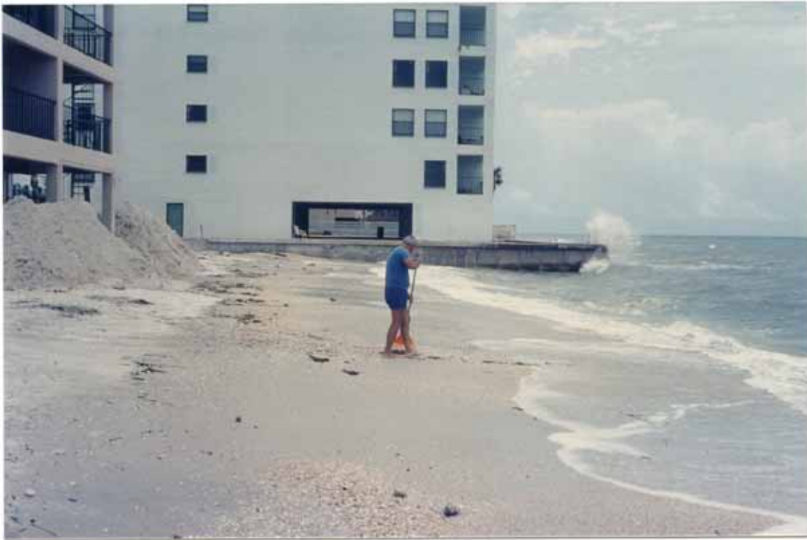
FIGURE 111. 193rd Avenue after the No Name Storm, 1982