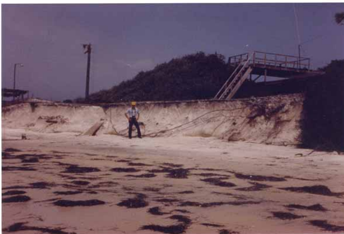
FIGURE 25. Dune erosion by Elena at the Southwest Cape