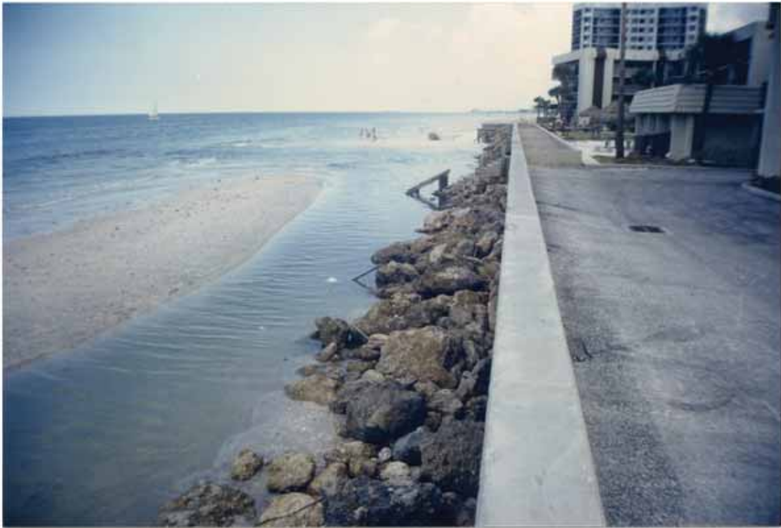
FIGURE 52. Beach erosion due to Elena at Montmarte Apartments