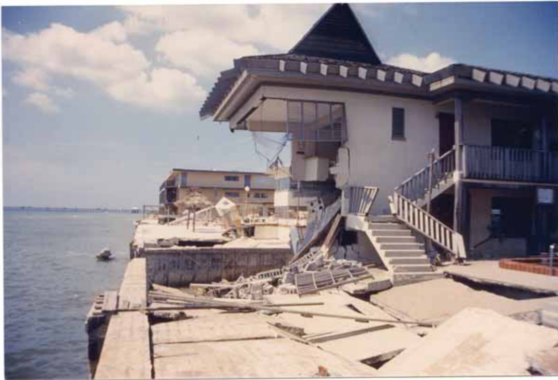
FIGURE 121. The Islander after Elena's damage