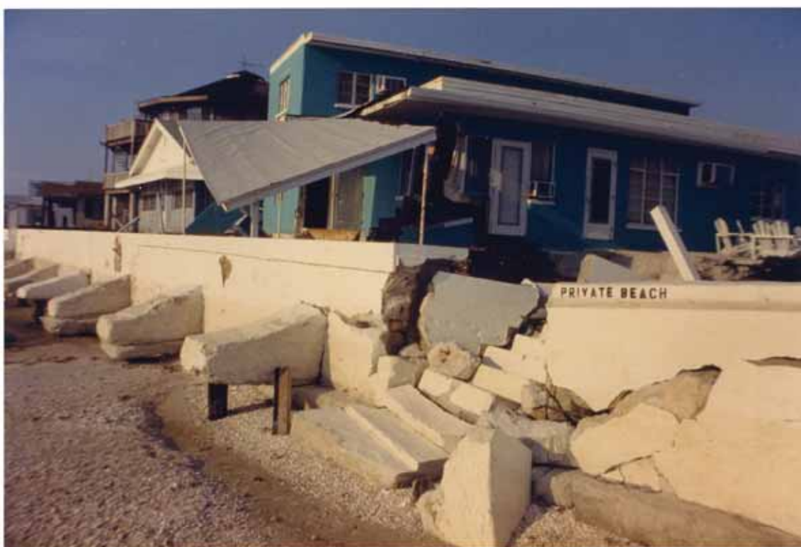
FIGURE 106. Wall damaged by wave impact loads