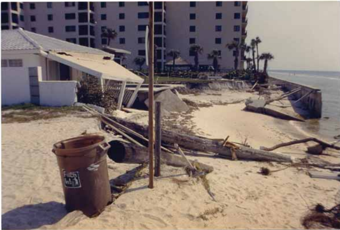
FIGURE 70. Damage at 25th Avenue, Indian Rocks Beach