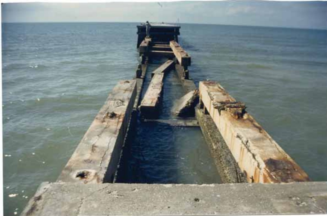
FIGURE 130. Juan damaged pier-groin at County park