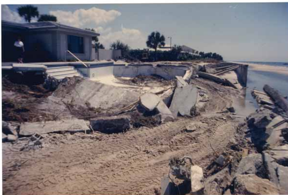
FIGURE 65. Wall and pool destroyed