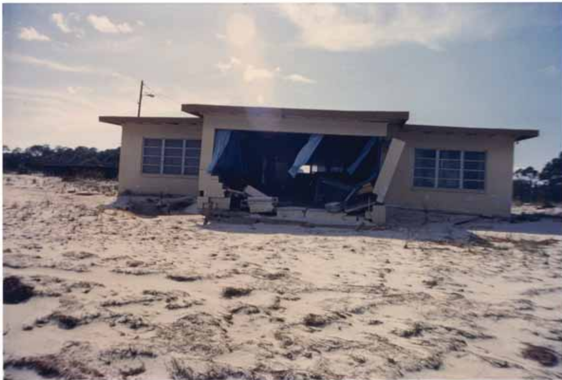
FIGURE 43. Elena's waves damaged dwelling near Bald Point