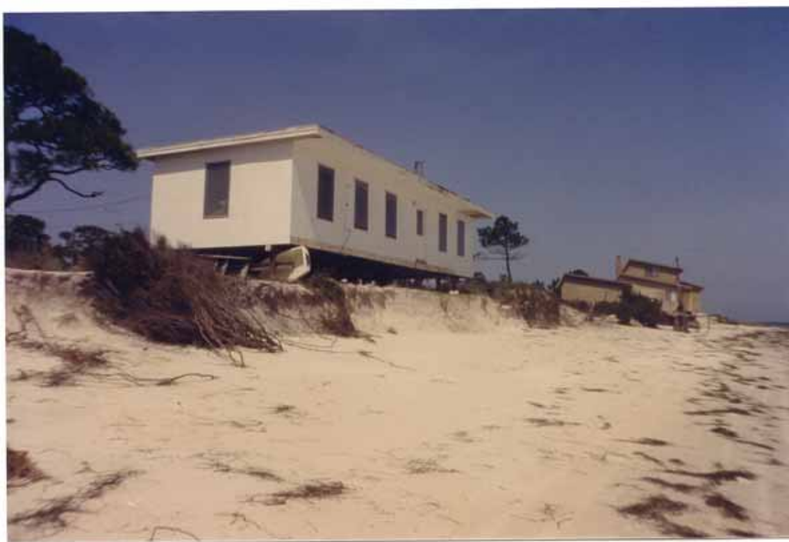
FIGURE 41. Lighthouse Point dwelling threatened by Elena's erosion