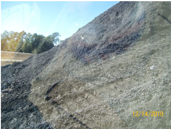
A-3 SE slope