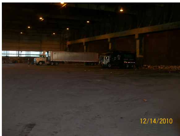
WTE tipping floor