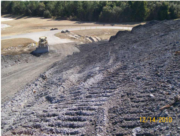
A-3 SE slope