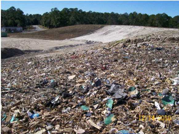
Class III, "active area"