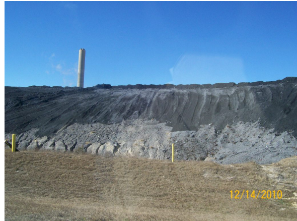
A-3 E slope