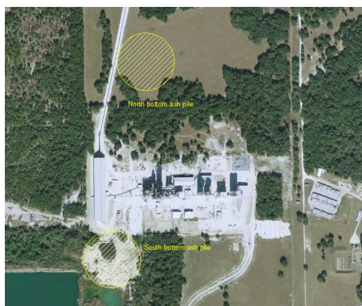
Aerial photograph #2.