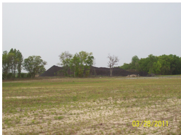
View of ash stockpile.