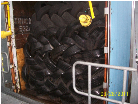
Tires stored inside truck.