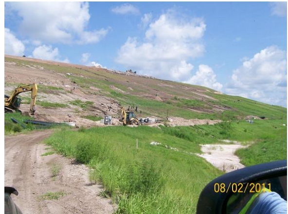
East Side Slope Erosion Repairs