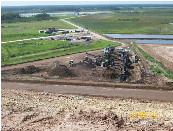
Auto Fluff Recycling