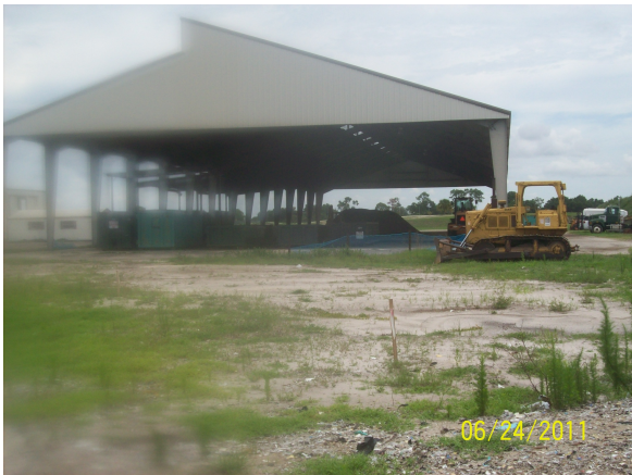
Screened fines in open bldg.