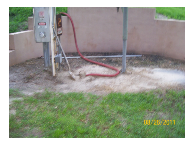
discharge to lift station