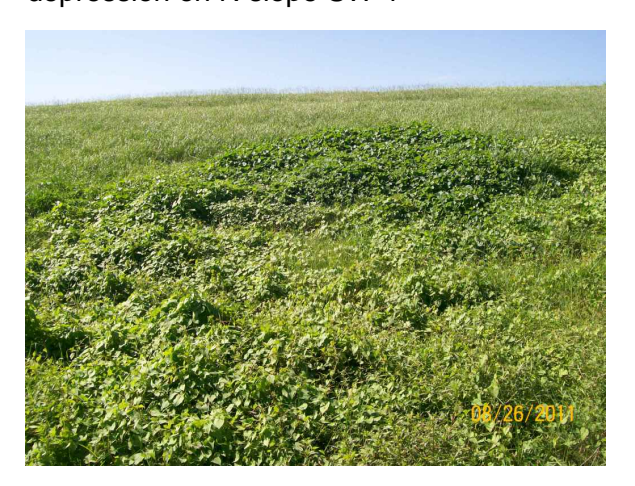
depression on N slope SW-1