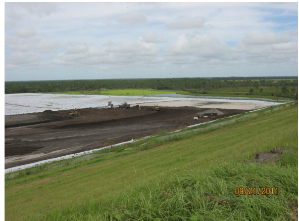
Phase 2, Cell 1