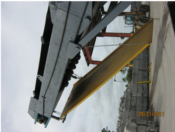
WPF - magnetic drum