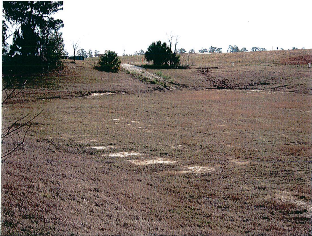
Photograph Number 5