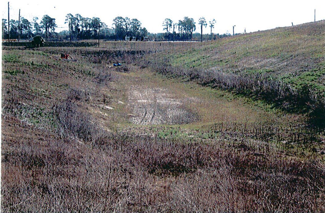
Photograph Number 6