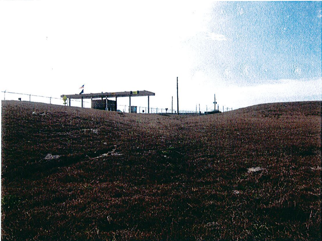
Date: February 15, 2012 Site: Citrus County Closed Landfill Re-Closure Description: Perimeter ditch into DRA-2 looking south