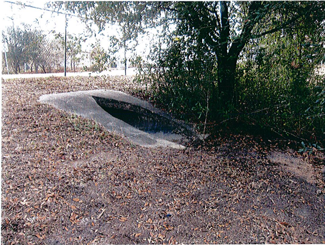
Date: February 15, 2012 Site: Citrus County Closed Landfill Re-Closure Description: Structure at DRA-2