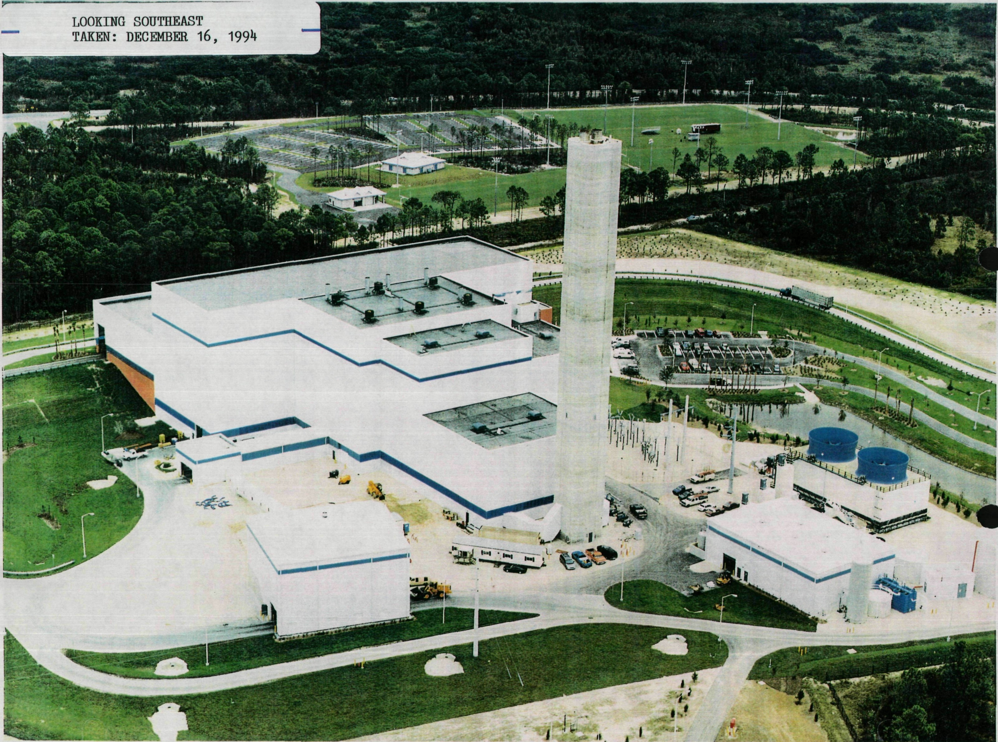
LOOKING SOUTHEAST TAKEN: DECEMBER 16, 1994