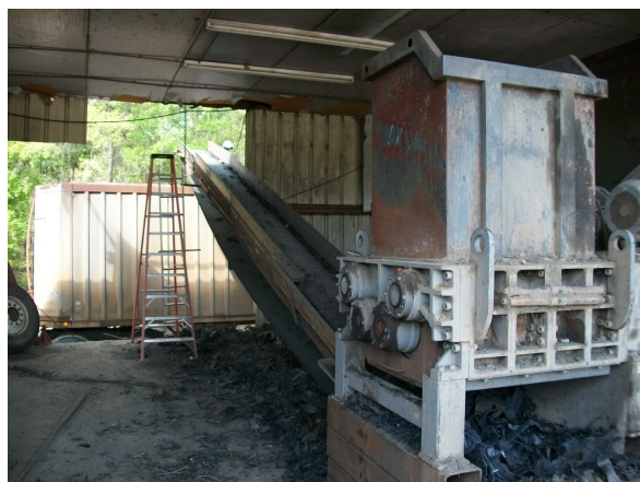
Photo1 - Tire Disposal Services