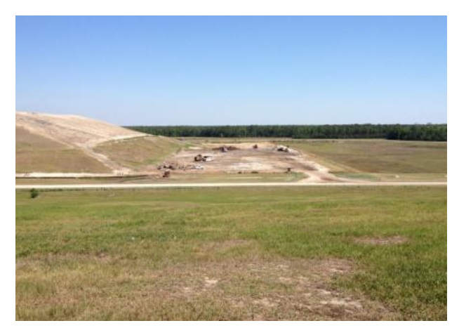
Class I Surface