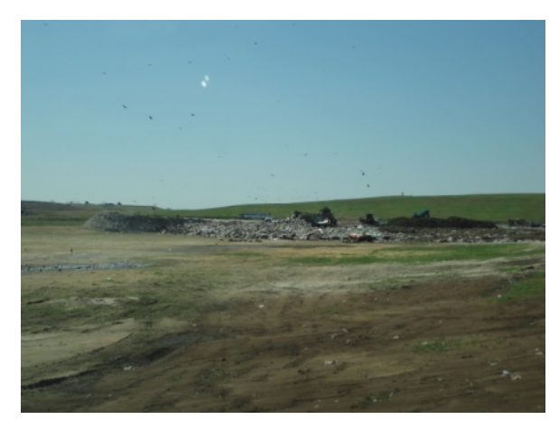
North South Slopes