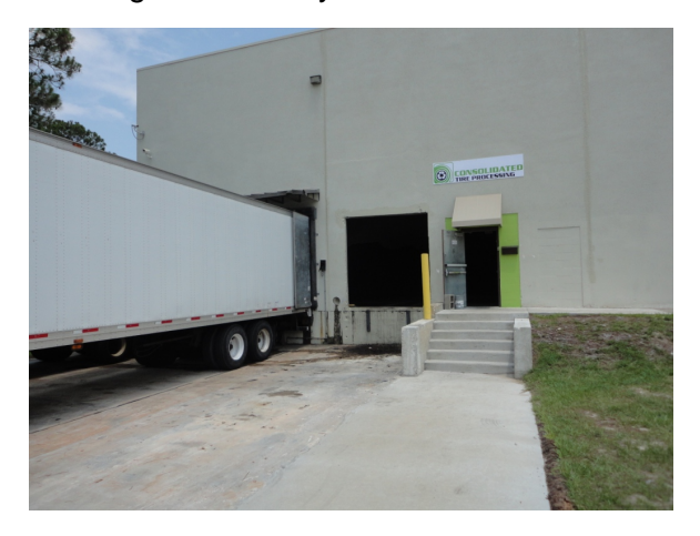
Waste Tire Storage