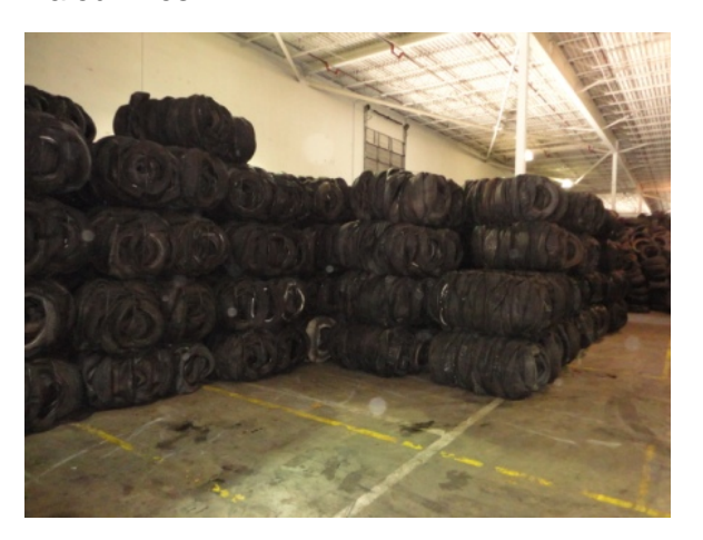
New Baling Machine