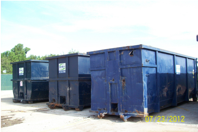
Waste Tire Containers