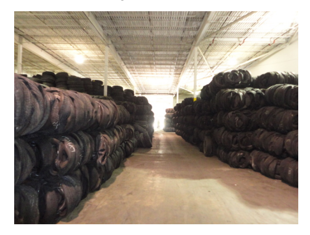
Tires for Resale