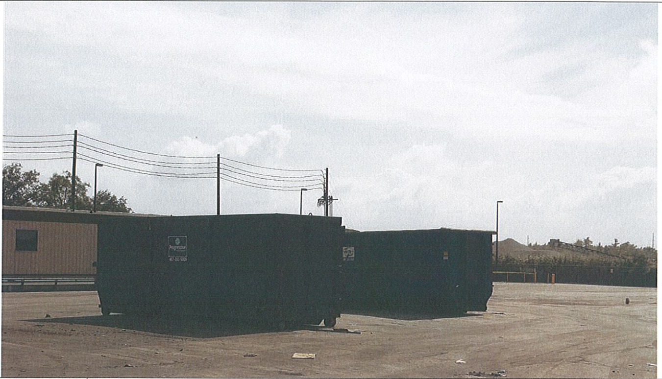
Photograph # 7 Forty cubic yard on site tire roll offs.