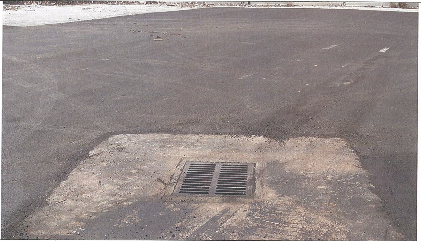
Photograph # 5 Closer look at S.W. storm water retention pond drain.