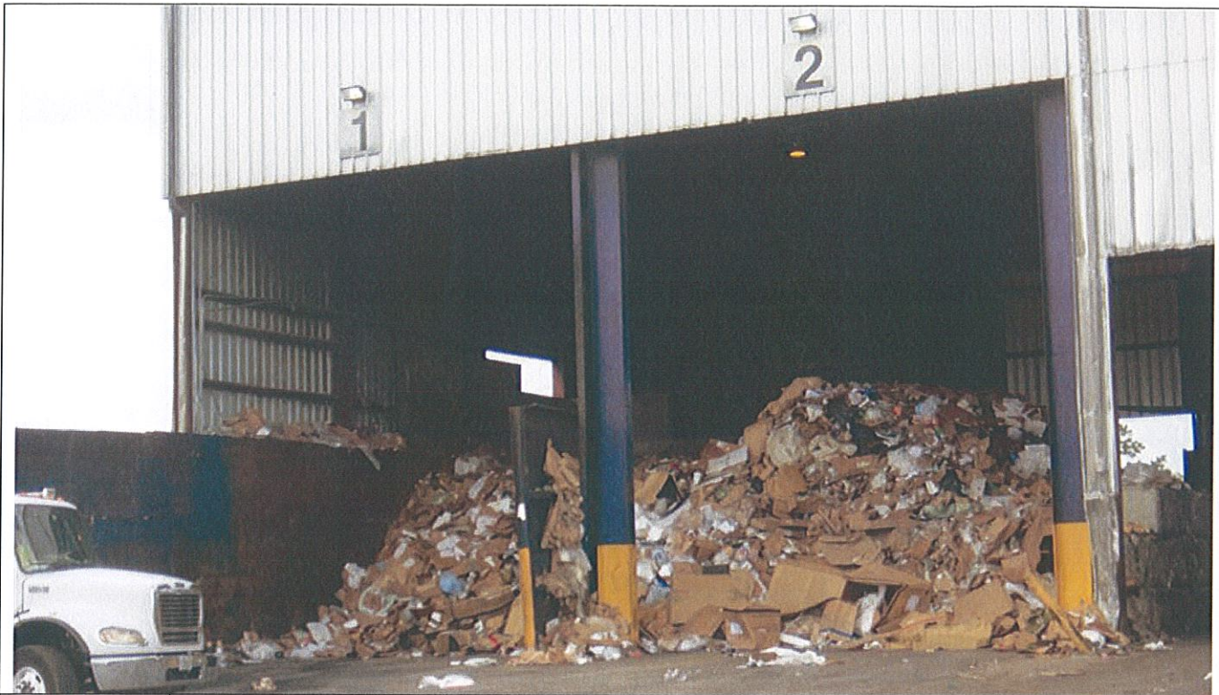
Photograph # 1

Note waste is kept undercover at doors #1 and #2.