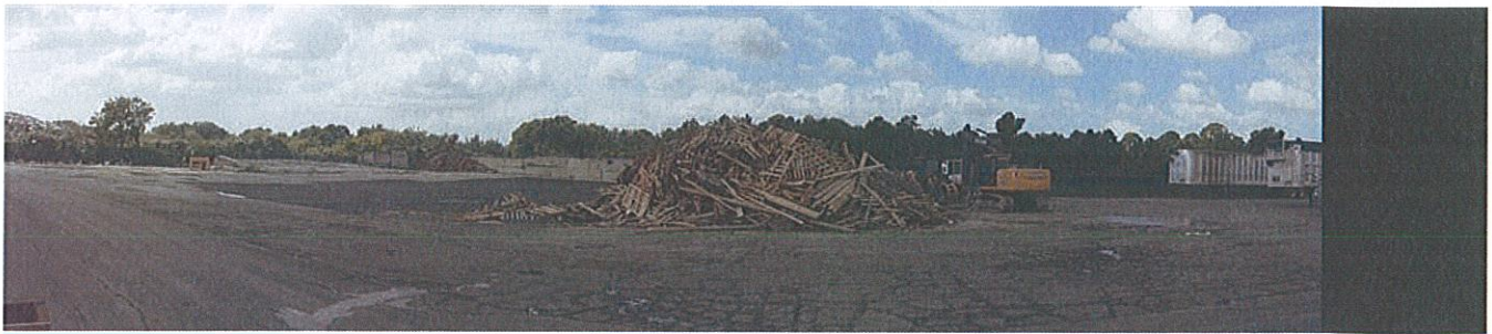
Photograph # 8 Panoramic view of S.W. corner of facility.