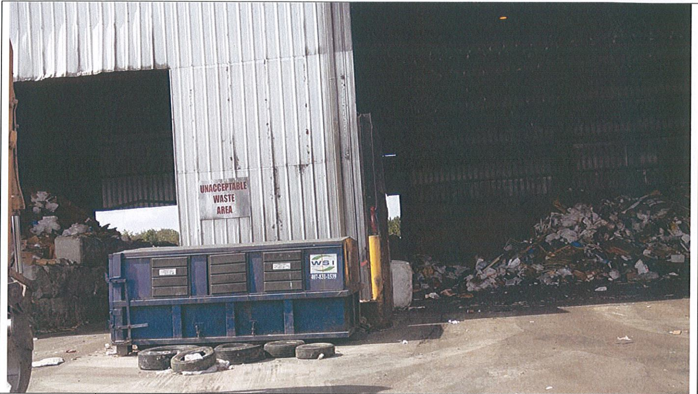
Photograph # 3 New unauthorized waste roll off with lids that seal. It keeps waste inside much dryer than the previous roll off with a tarp.