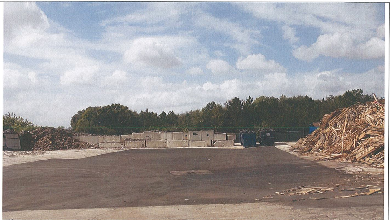
Photograph # 4 Storm water retention pond drain and wood waste storage area located on S.W. side of facility has been repaved.