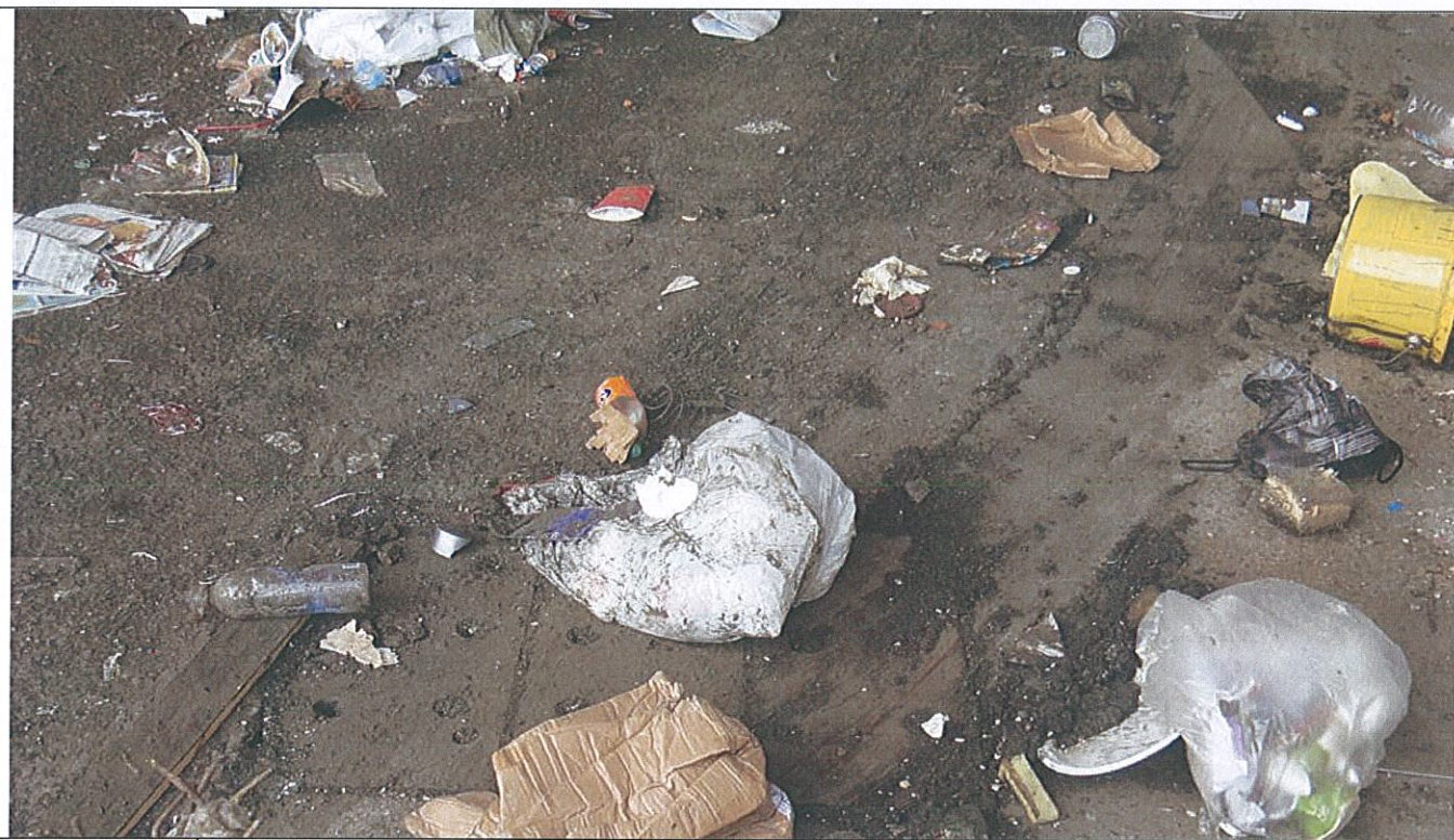
Photograph # 2

Note waste is kept undercover at doors #1 and #2.