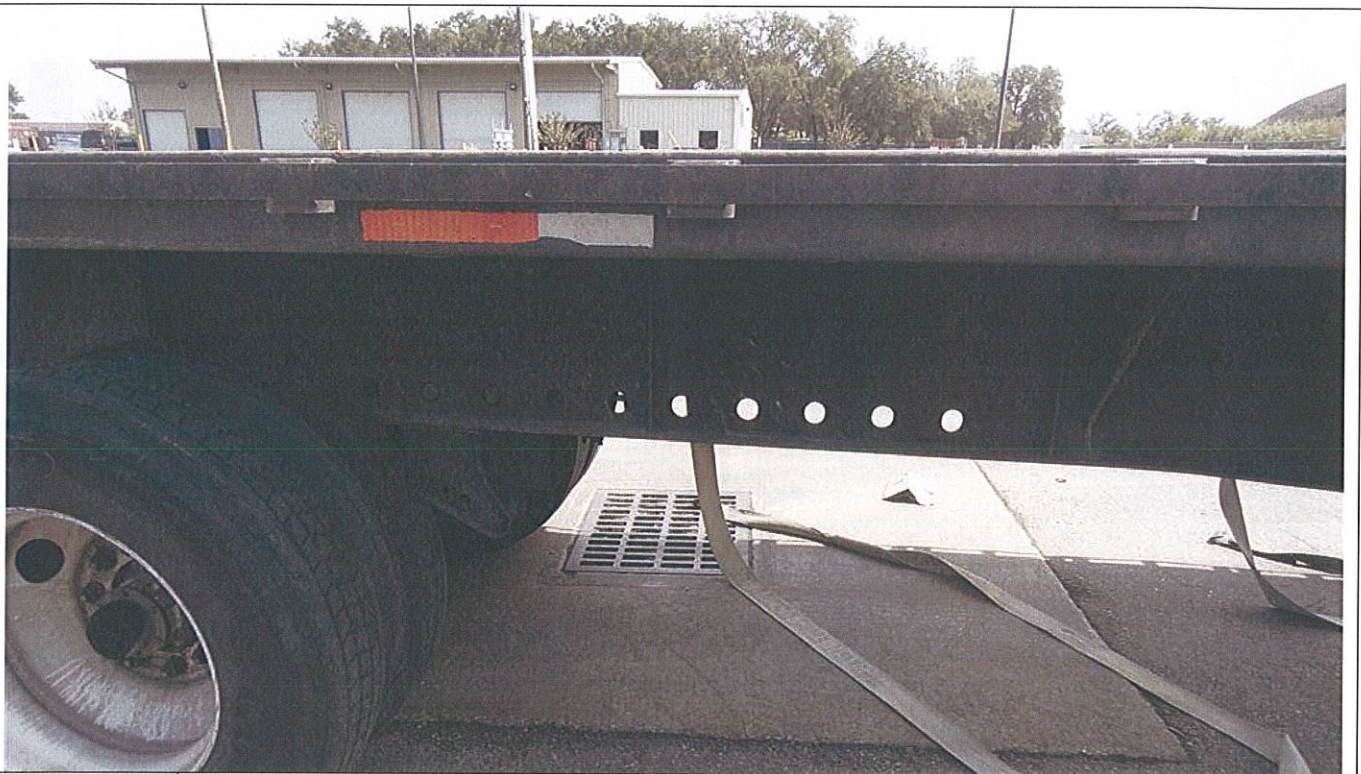
Photograph # 6 S.E. storm water retention pond drain, note it's clean and unobstructed.