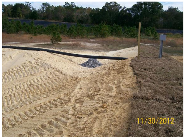
Temporary Header - pic 1