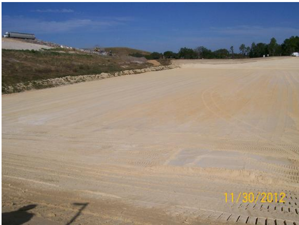
Cell 3 - pic 1