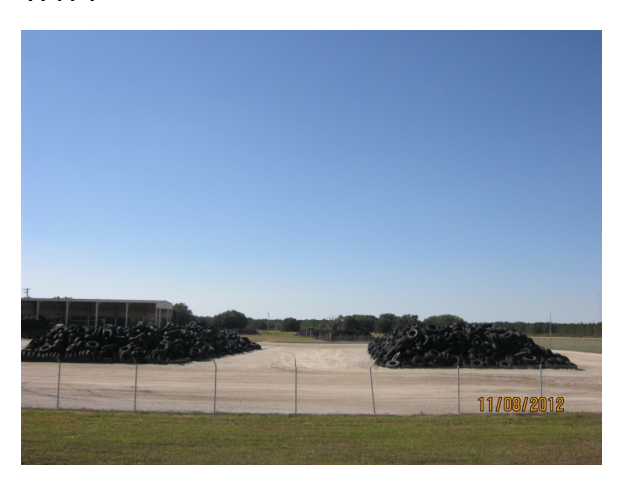
County inspection example