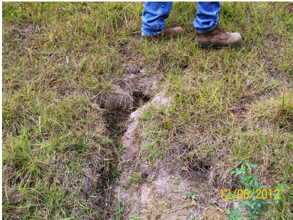
Erosion on Side Slope Units 44-47