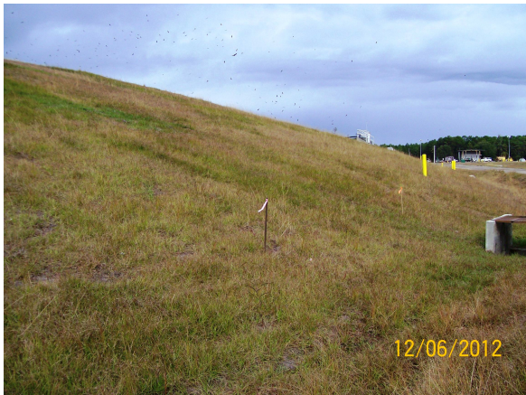
Phase I, units 40-43