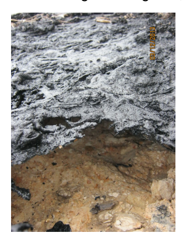
liner damage to subgrade, erosion