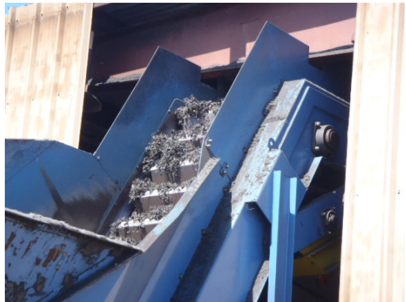
Granulated Fines from tires