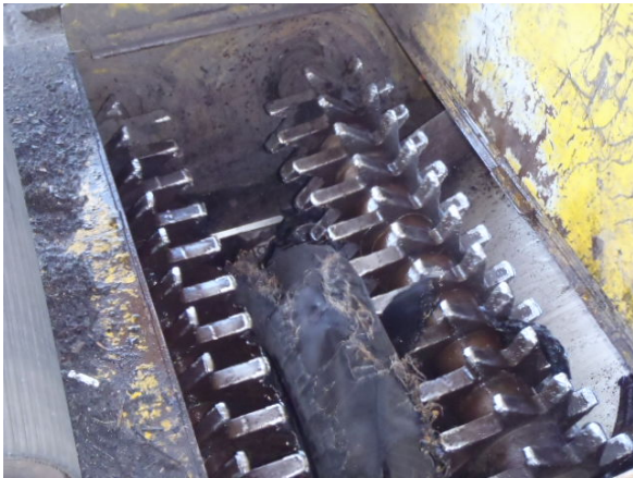
Tires being shredded