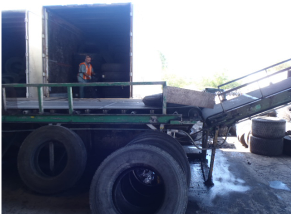
Tires being loaded in Shredder