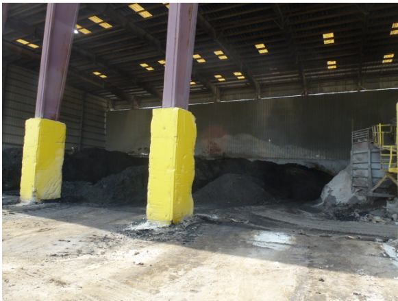
view of soil