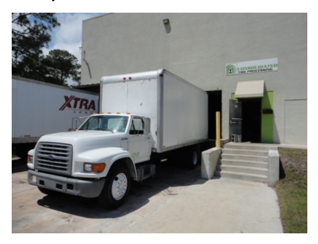
Used Tire Storage