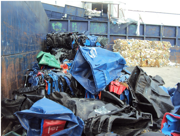
Processed Paper & Plastic