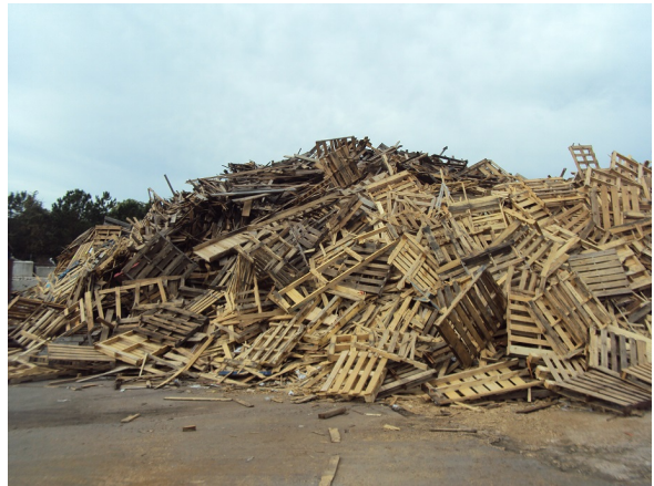
Wood Pallet Pile