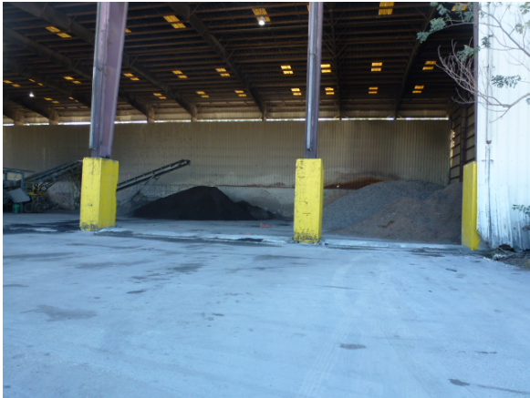
view of biomass