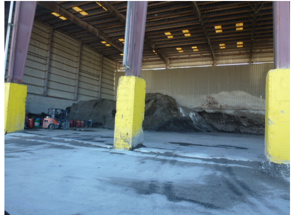
view of soil