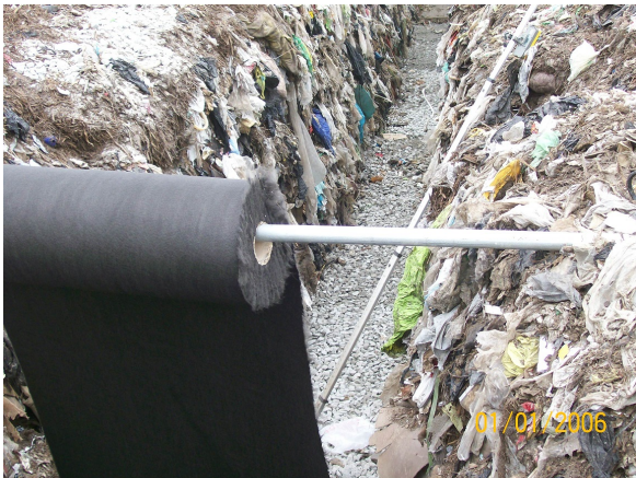
Horizontal 10A - pic 2