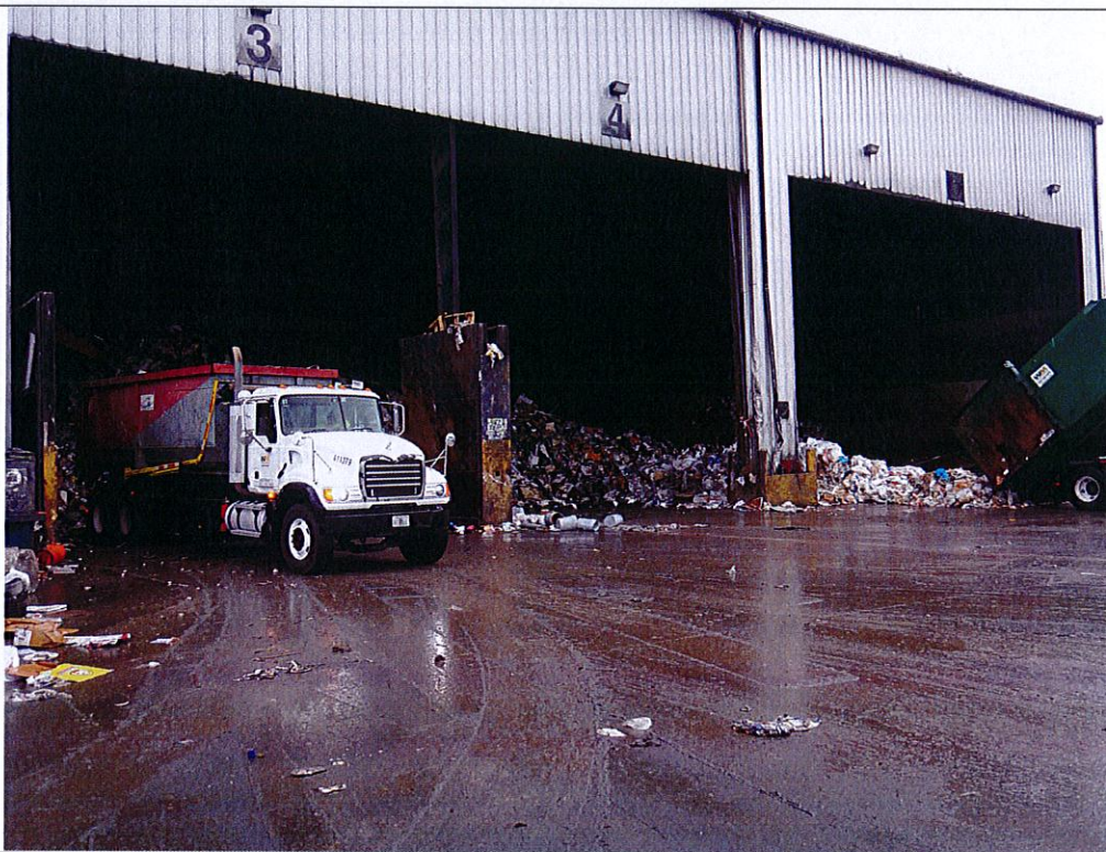
Photo 2: Doors #3, 4 and 5 waste is kept on approved tipping floor. At door #5 after the truck leaves front loader will push waste on parking lot into approved tipping floor.