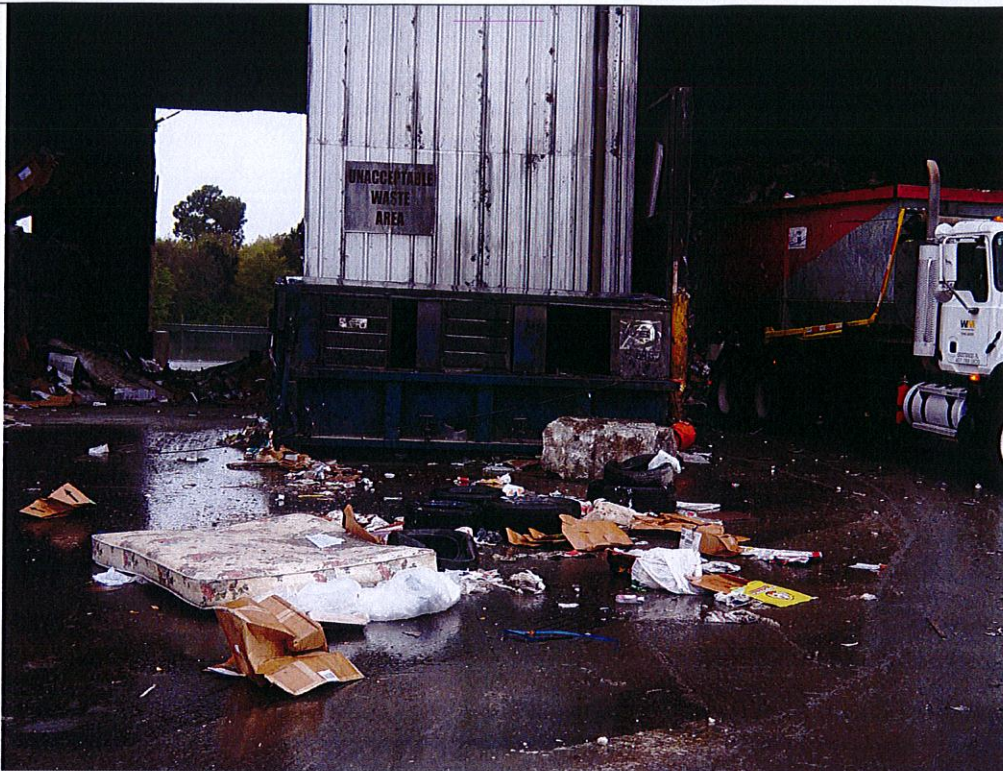
Photo 1: Storage area for unauthorized waste in roll off. Note cardboard, tires, Class III waste littering the parking lot. I was advised by Mr. Estevez that the waste and trash will be cleaned up at the end of the shift.