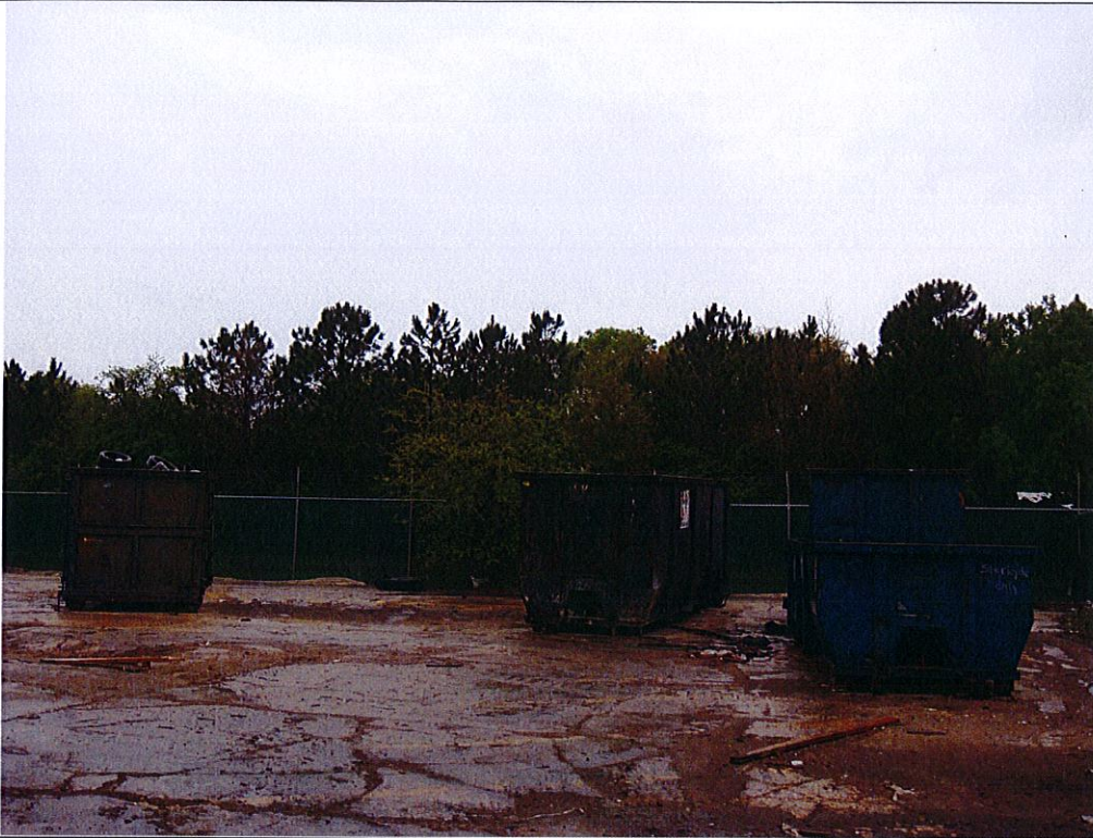
Photo 7: Roll offs in the background are tire roll offs. 20 cu-yard roll off contains CCA treated wood.