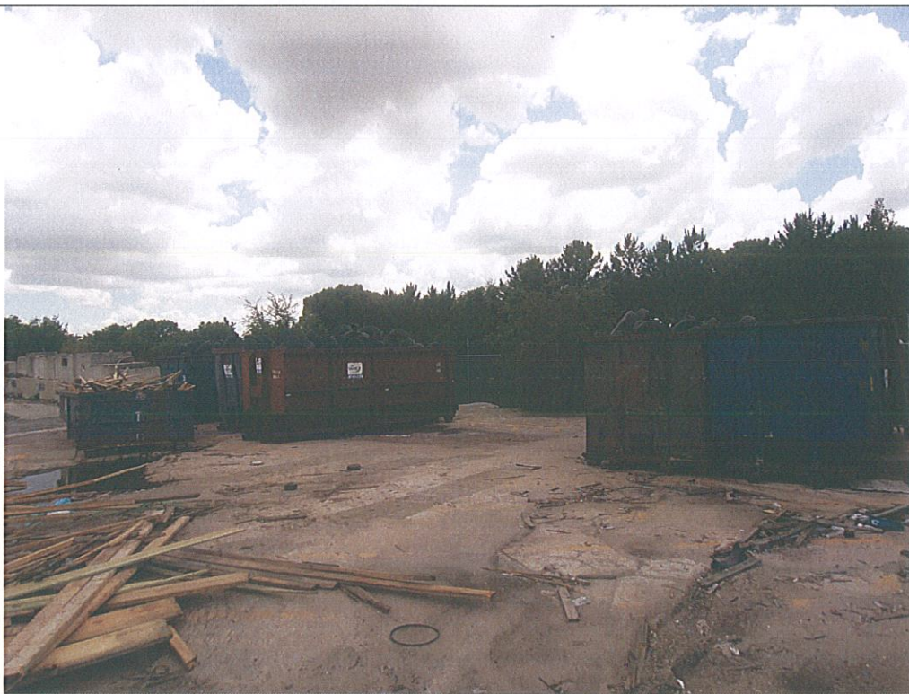
Photo 2: 40 cubic yard roll offs contain tires and the 20 cu yard roll off contains CCA treated wood.