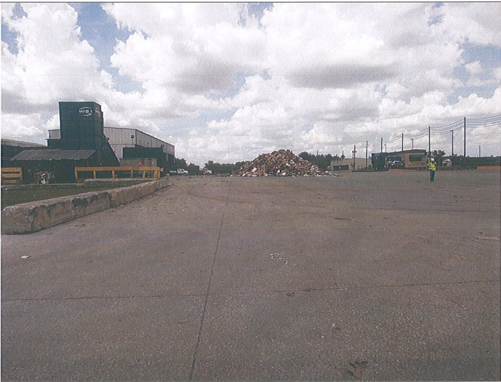
Photo 4: Photo of bailed cardboard storage area. I was advised by Mr. Wilson that at the time of my inspection there were only 7 cardboard bails in their inventory.