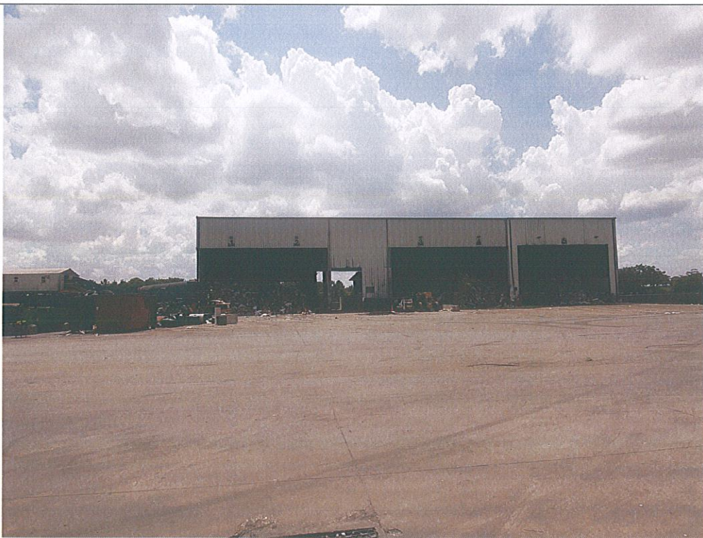
Photo 8: Photo depicts access road/parking lot and the 5 bay doors on site.