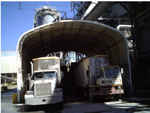
AFM handling area