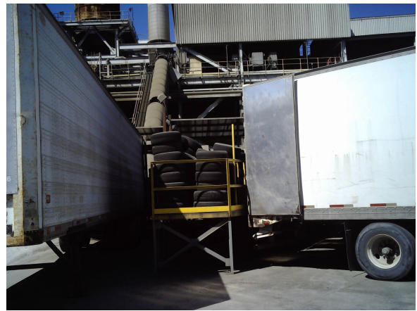
tire handling area