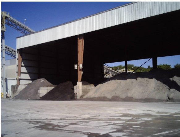
ASB - AFM 2nd Bay from Left