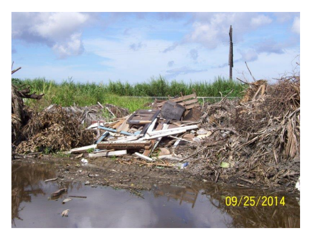
Forever Rec. Photos - 2