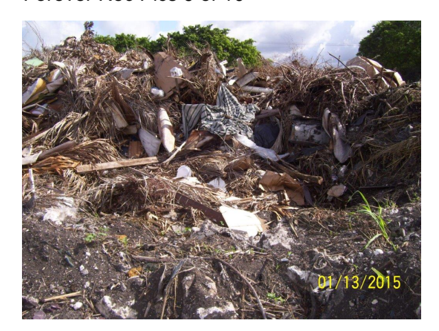
Forever Rec Pics 9 of 10