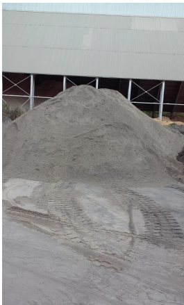
AFM storage A-frame (background)