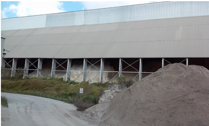
AFM A-frame (80% gypsum, 20% AFM)