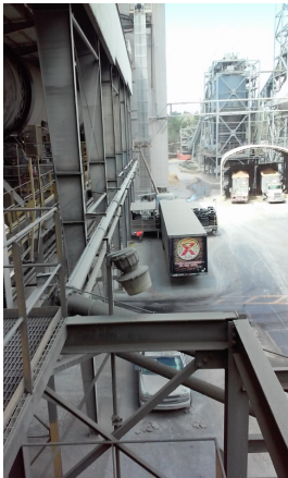
Kiln 1 tire area (preheater base)