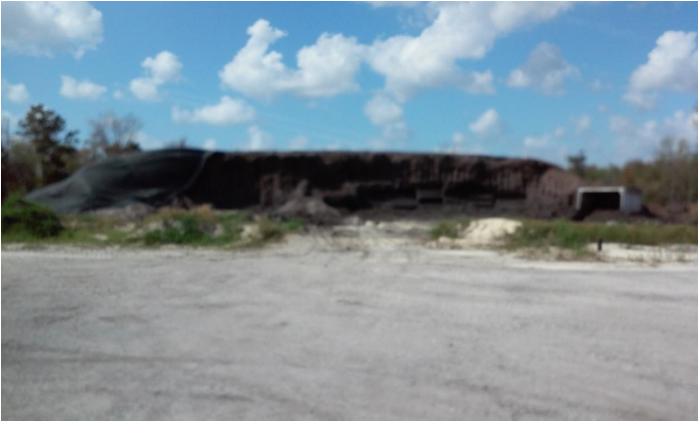
Covered flyash storage area 2