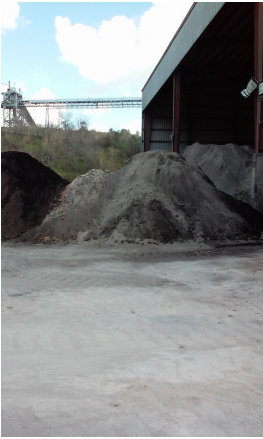
ASB Storage area