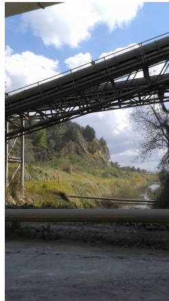
Leachate ditch, South view