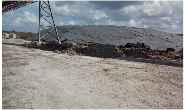
Covered flyash storage area 1