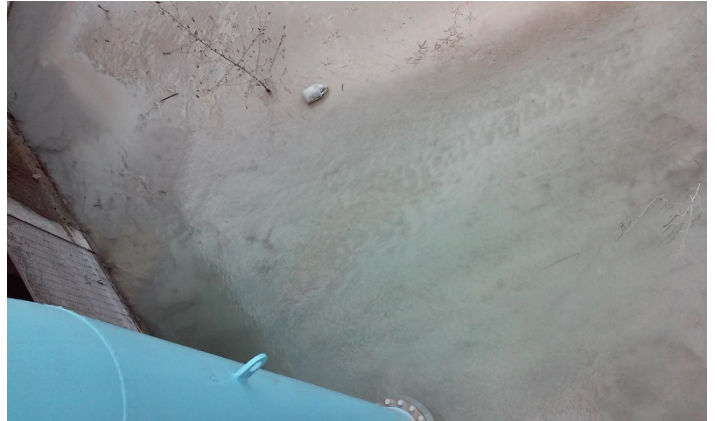
leachate ditch pump to pond