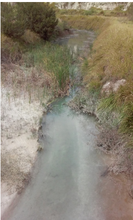
Leachate ditch from facility