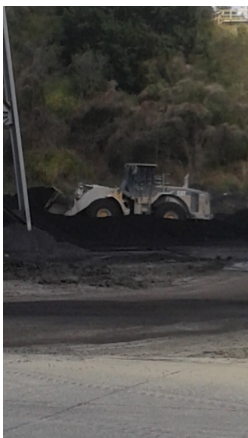
Coal yard with front-end loader