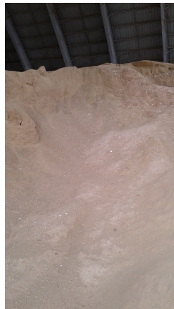
AFM (sawdust) inside A-frame