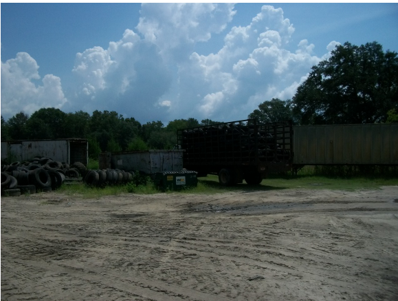
Photo3- Waste tires at TDS site