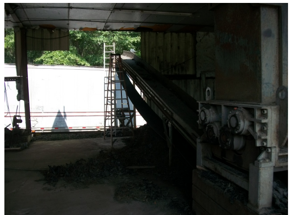
Photo2-TDS tire processing equip.