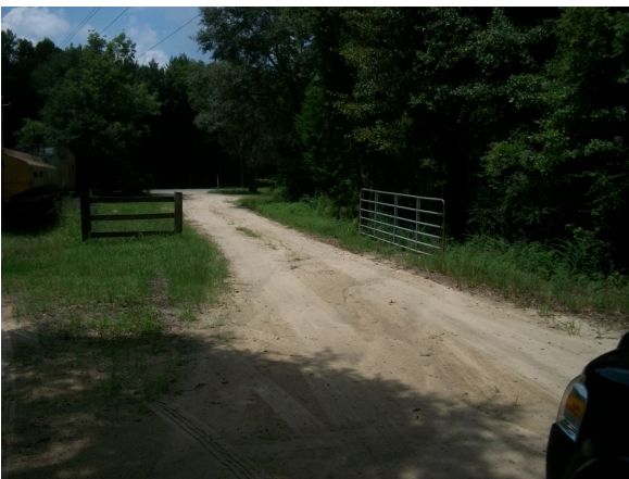
Photo1- TDS entrance gate