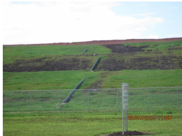
Stage III Erosion to be Repaired