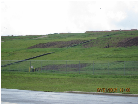
Stage III Erosion Repair